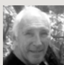
Phil Liggett Public Commentator (Tour Down Under) and Conservation Advocate