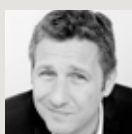
Adam Hills Entertainer (Comedian)