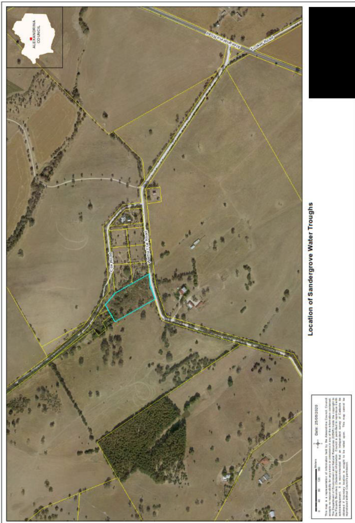
Location of Sandergrove Water Troughs

This map is a representation of information held by the Alexandria Council. Council accepts no responsibility for any errors or omissions in any of the information contained on this map. The information is provided for general information only. Council is permitted to reproduce it with acknowledgement. It is recommended that an independent survey of cadastral be obtained if necessary, as it is subject to be revised upon. This map cannot be reproduced without Council's permission. 0 40 80 120 160 Meters Date: 25/06/2020