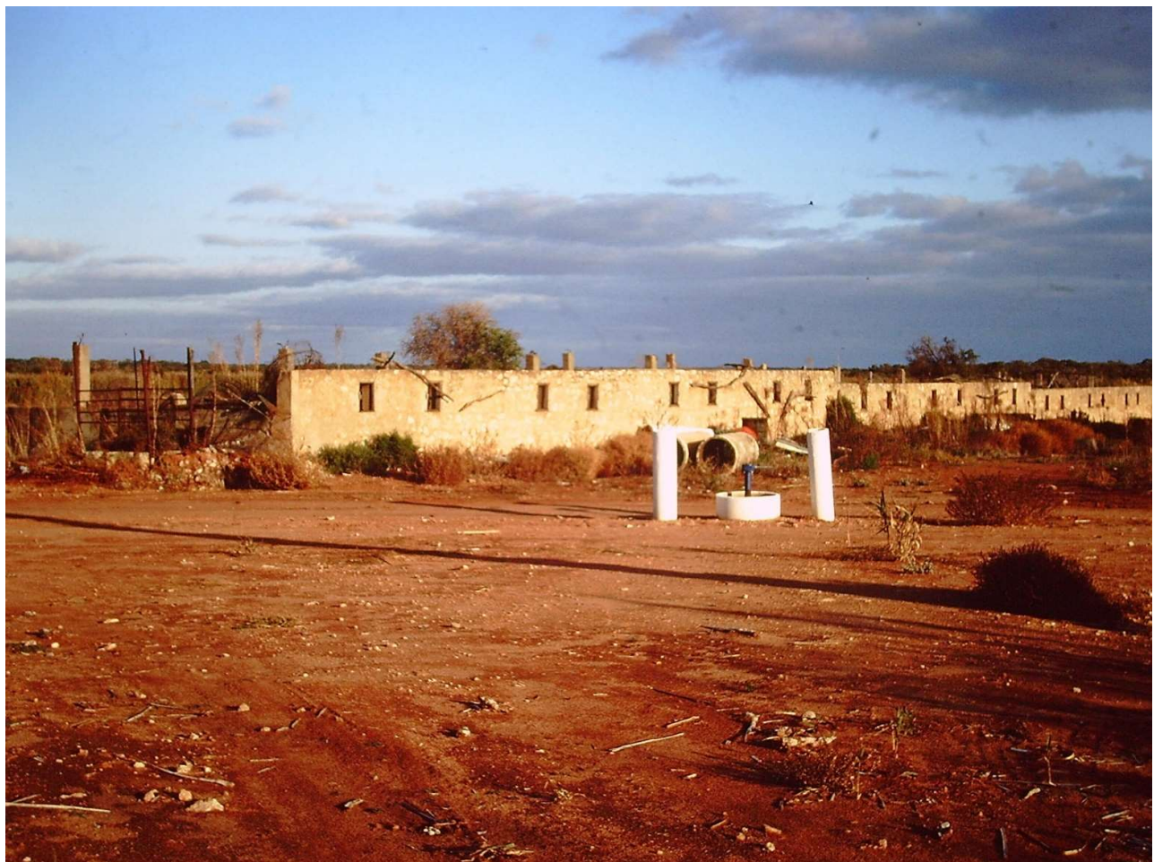
Image: Loveday Internment Camp as it looked in 1996.

On the traditional lands of the First Peoples of the River Murray and Mallee Region.