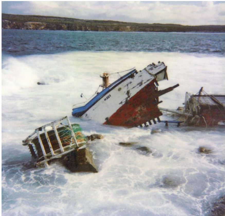
Image: Wreck of the Magic II. Wrecked 8 August 1990.

https://www.environment.sa.gov.au/topics/heritage/maritime-heritage/shipwrecks-of-sas-west-coast