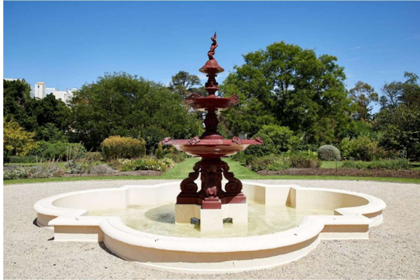
Image: Boy and Serpent Fountain, Adelaide Botanic Garden.

Read more about each of the eleven State Heritage Places through this link: