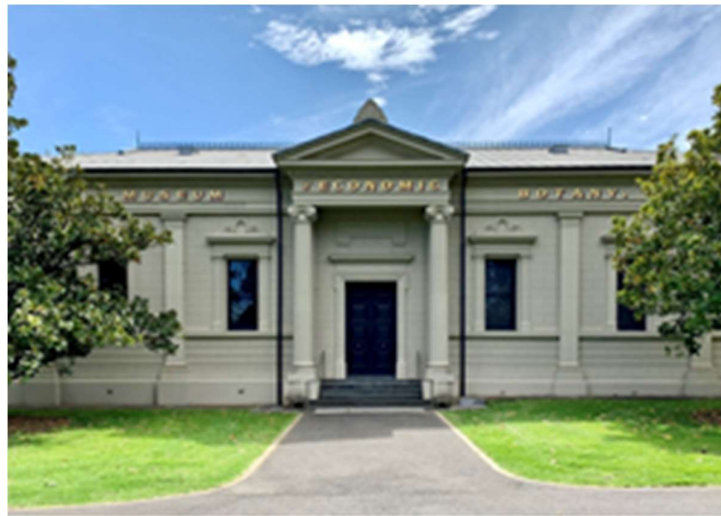
Image: Museum of Economic Botany, Adelaide Botanic Garden. Source Keith Conlon