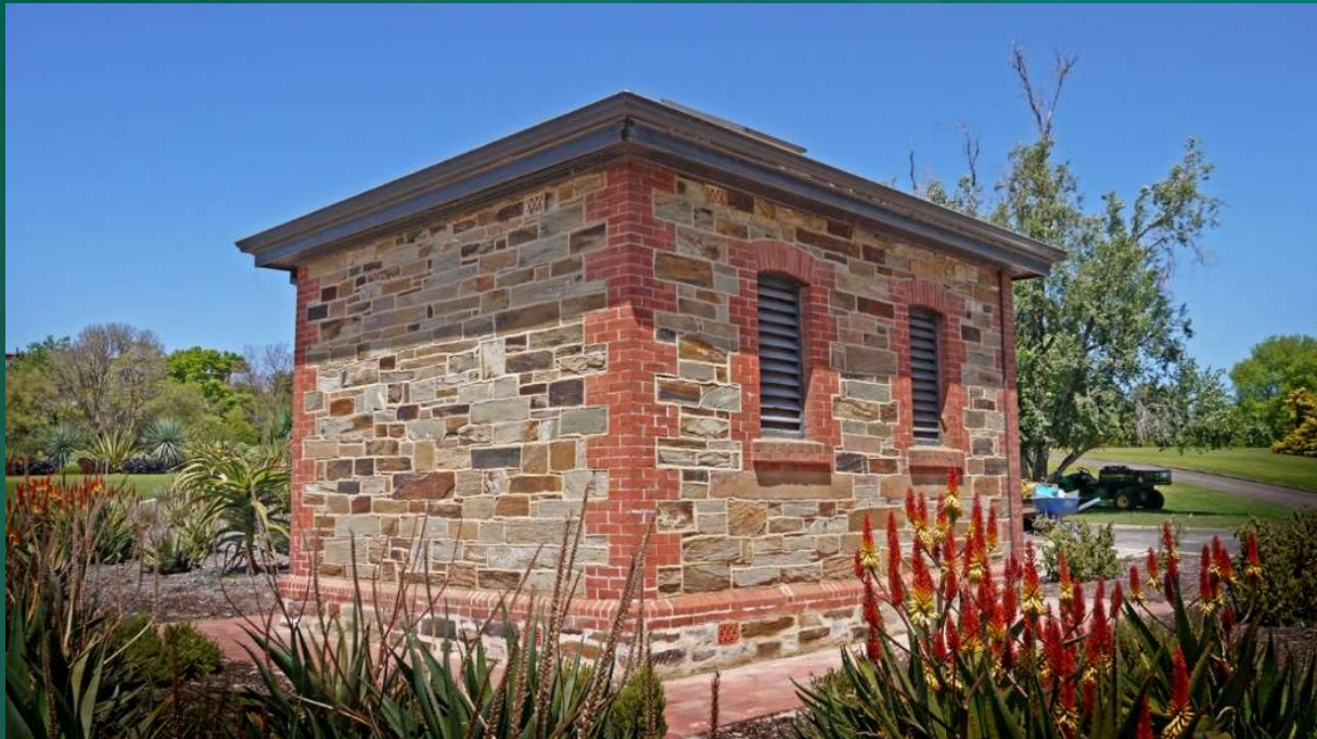
Photo: East Lodge, Adelaide Botanic Garden.

Heritage News contains news from the Council meeting and other topical news relating to conserving and promoting South Australia's unique heritage.