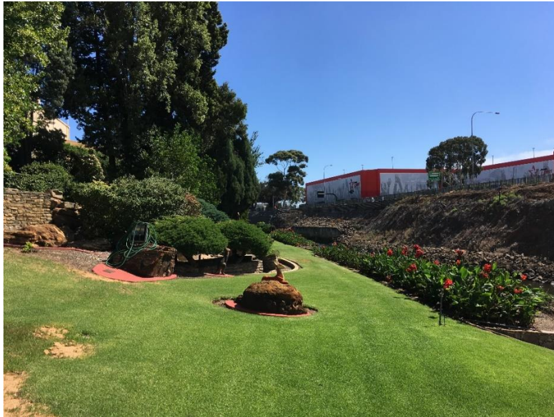
West End Brewery Garden showing the lawns, canna lilies and 'deer seated on a rock' model and background of trees in rear garden bed

107 Port Road, Thebarton (River Torrens/Karrawirri Parri (adjacent Adam Street Thebarton))