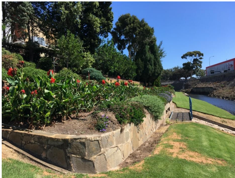
West End Brewery Garden showing the stone retaining wall to the rectangular beds

(River Torrens/Karrawirri Parri (adjacent Adam Street Thebarton))