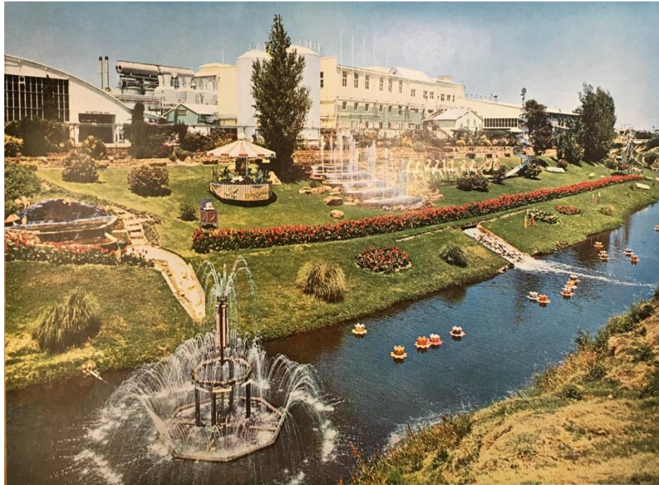
Brewery Garden Christmas Display 1968, note the cascade, grotto and fountains in the river and cascade