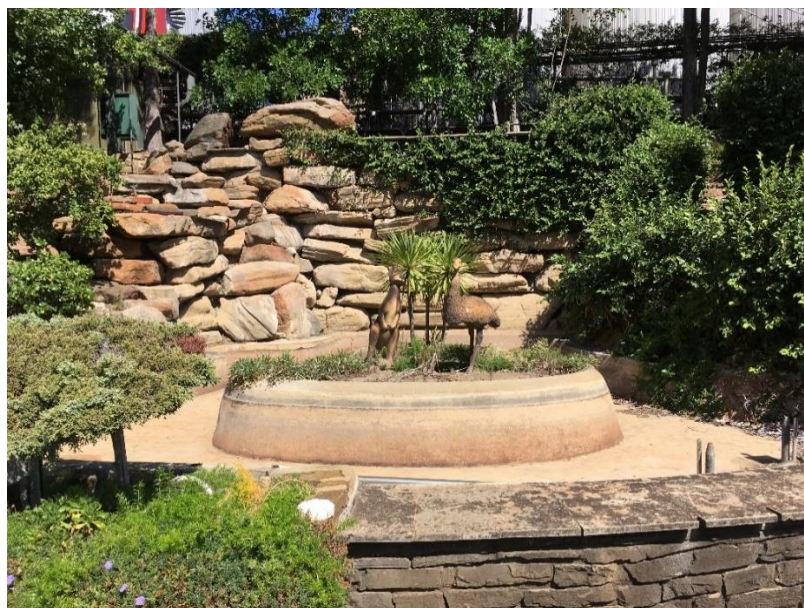
West End Brewery Garden showing the pond (now dry) that was once a part of the cascade, with central island with kangaroo and emu figures