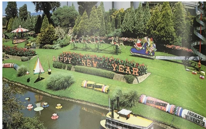
Easter (1980) (left) and Christmas (1981) (right) displays

Source: SABCo Annual Reports 1980 and 1982