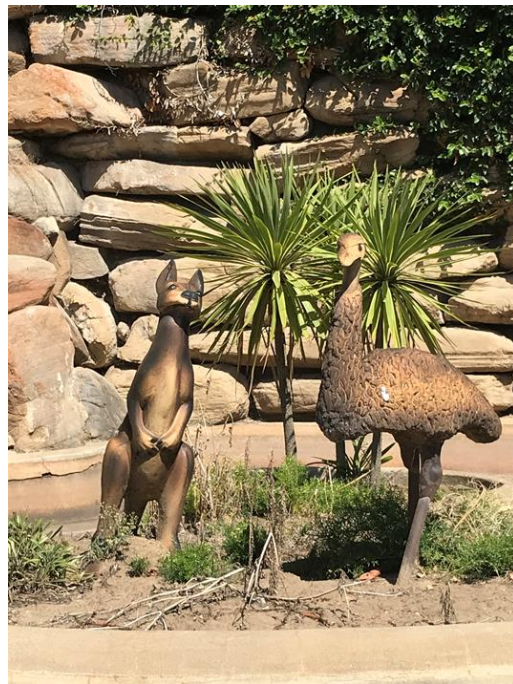
West End Brewery Garden showing examples of the figures in the garden