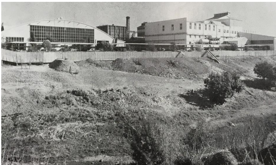
Work on the garden begins, with dirt brought in to fill and level out some of the hollows in the bank, 1959