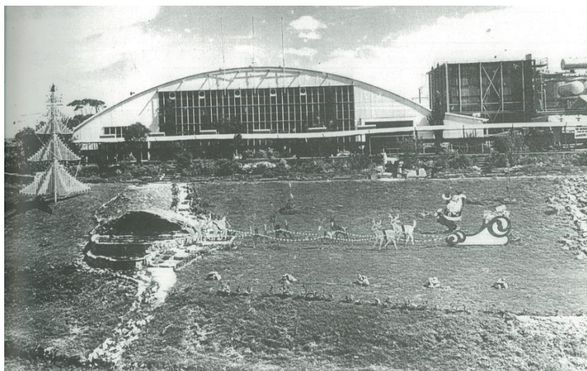
First Christmas Display, 1959, note the grotto (left), garden bed with stone retaining walls at rear of the garden and rubble (far right) that will become the cascade

place for the first Adelaide Festival of Arts display that was installed only a few months later in 1960.