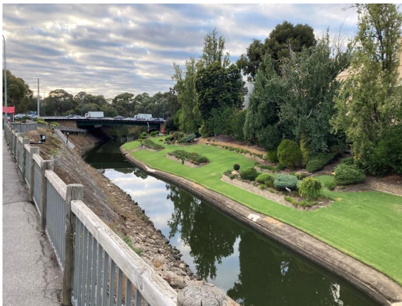
West End Brewery Garden showing the three mass planted rectangular garden beds

(River Torrens/Karrawirri Parri (adjacent Adam Street Thebarton))