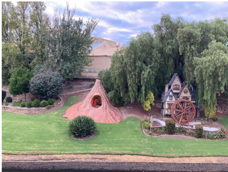
West End Brewery Garden showing 'Vulcan's' volcano, the feature bird of paradise plant, and mill with rockery garden

(River Torrens/Karrawirri Parri (adjacent Adam Street Thebarton))