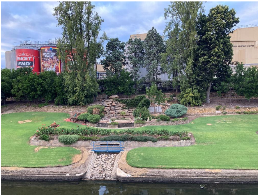
West End Brewery Garden pond

(River Torrens/Karrawirri Parri (adjacent Adam Street Thebarton))