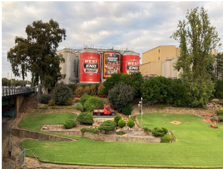
West End Brewery Garden showing the brewery truck and rock garden that was previously the grotto

(River Torrens/Karrawirri Parri (adjacent Adam Street Thebarton))