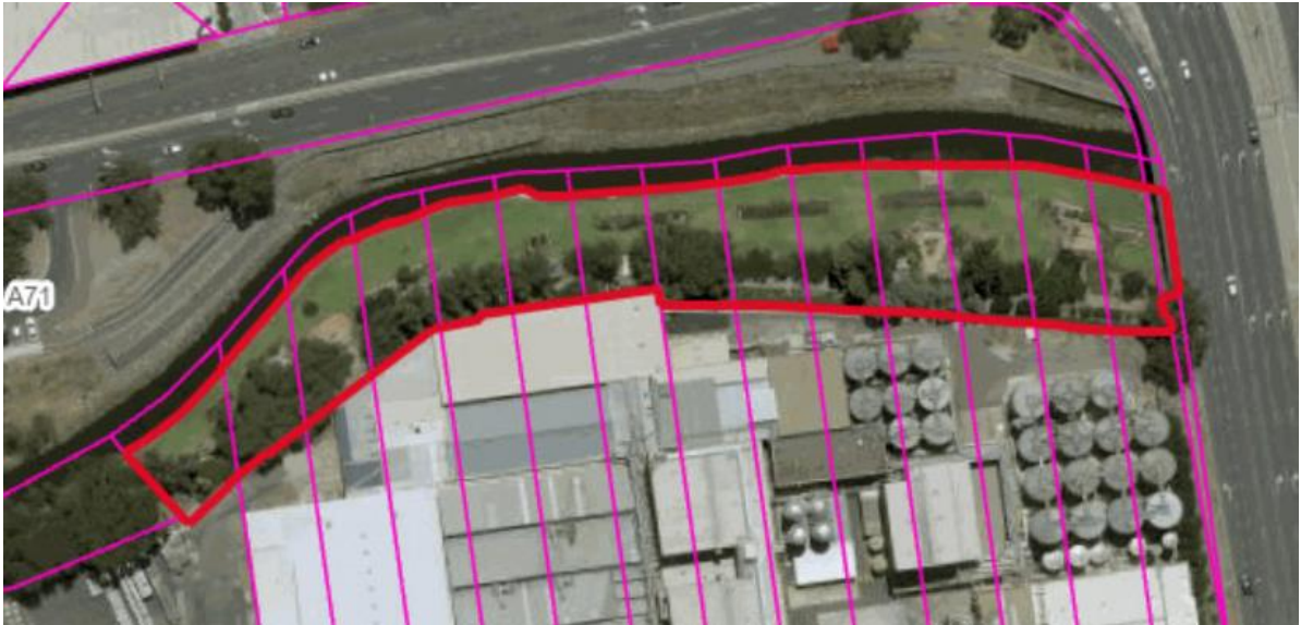
Former West End Brewery Garden (former SABCo Brewery garden), CTs as listed in table below, Hundred of Adelaide

107 Port Road, Thebarton, (River Torrens/Karrawirri Parri (adjacent Adam Street Thebarton))