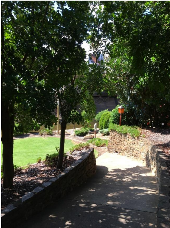
West End Brewery Garden showing one of the paths that dissect the rear garden bed

(River Torrens/Karrawirri Parri (adjacent Adam Street Thebarton))