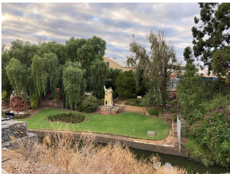
West End Brewery Garden showing the tree stump and kidney-shaped garden bed