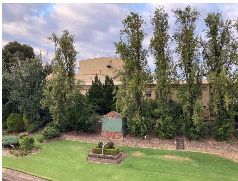
West End Brewery Garden showing the 'Inn' from the Nativity, the basket or crown shaped garden bed and one of the stairways that dissect the rear garden bed