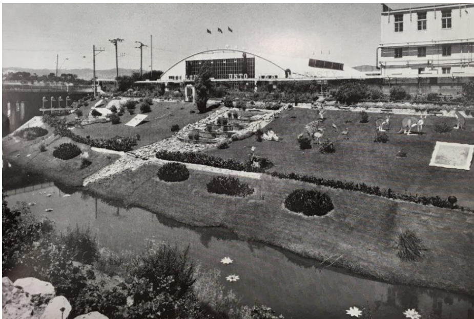
Brewery garden display for the visit of Queen Elizabeth II and Prince Philip, 1963, note the addition of the lily pads in the river

In keeping with SABCo management's aim to create a connection between the brewery and community, a number of seasonal displays were installed in any one year, including annual displays for Easter and Christmas and more periodic events such as the Adelaide Festival of Arts and the Royal visit by Queen Elizabeth II and Prince Philip in 1963.