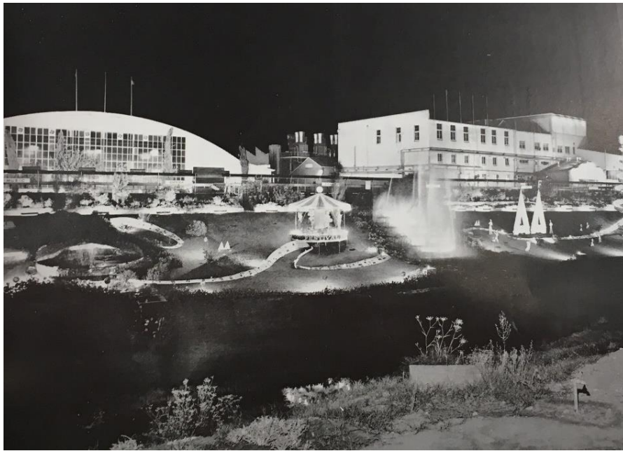
Display for the 1962 Adelaide Festival of Arts, note the completion of the cascade (mid right)