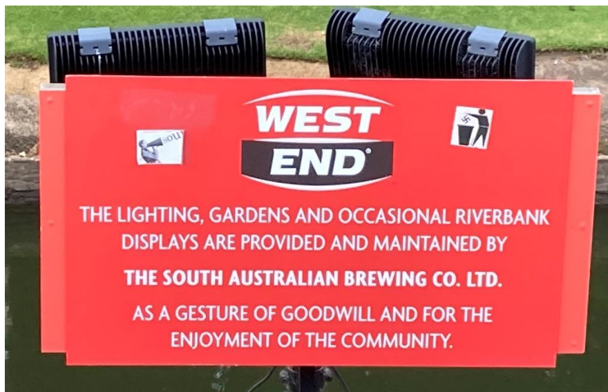
Sign on the northern riverbank from SABCo about the garden