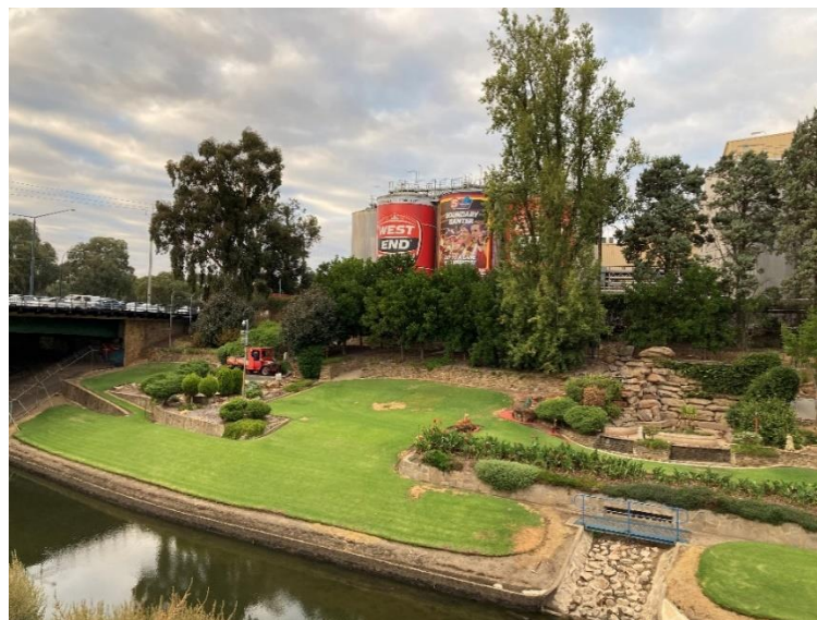
West End Brewery Garden showing the pond and rock garden (previously the cascade)