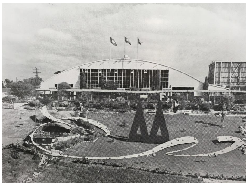
Display for the first Adelaide Festival of Arts, 1960, incorporated the Festival logo, note the growth of the plants and improvements to the lawn