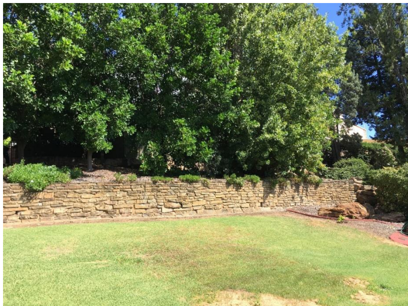
West End Brewery Garden showing the stone retaining wall to rear garden bed