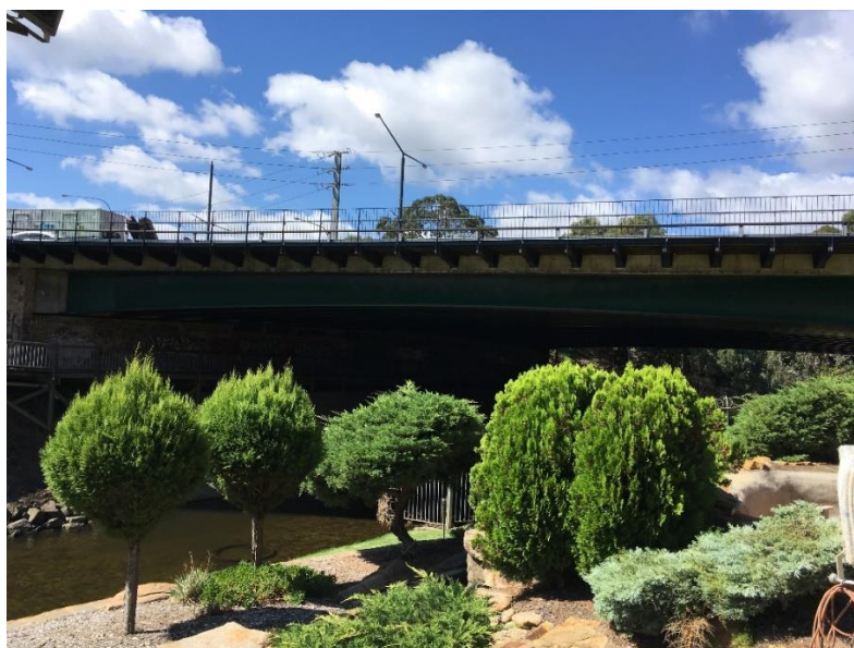
West End Brewery Garden showing an example of the conifers in the rockery gardens