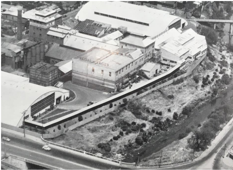
The bank as it appeared in c.1956