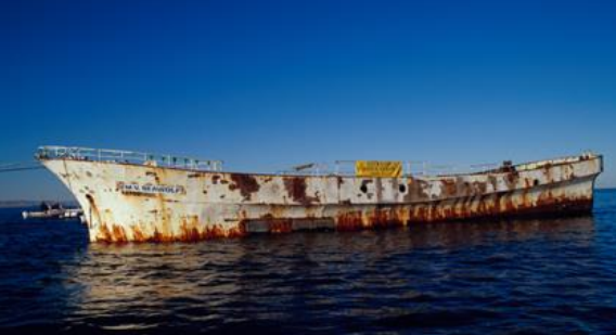
Seawolf in position for scuttling, March 2002

Seawolf port side, 2002