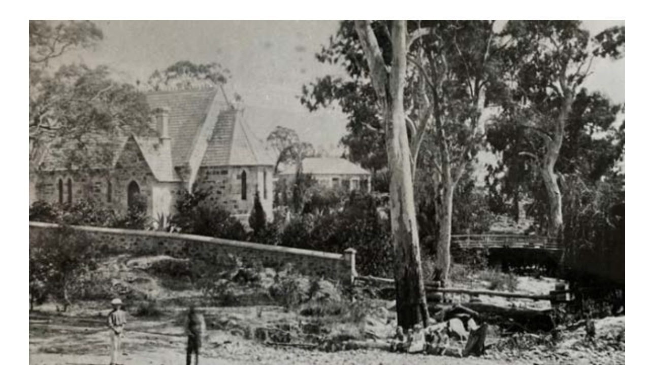
Image: St Thomas' Church Pewsey Vale, image by Capt. Sweet c.1877, note the shingle roof, rectors cottage adjacent to the church and the foot bridge across Jacob's Creek

Council concluded that it would not consider provisional entry at this meeting without further evidence of the intactness and integrity of the buildings on site and therefore will seek Ministerial authorisation to enter this property under section 39 of the Heritage Places Act.