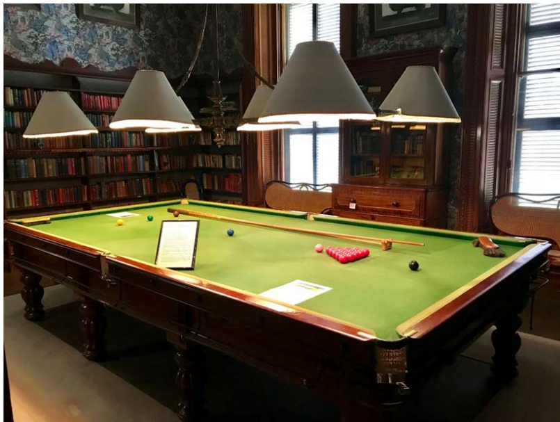
Billiard table and 6-pendant light fitting in the Billiard Room, Martindale Hall Source: DEW Files 19 August 2019

The Billiard & Sporting collection includes the Billiard table, table light, scorer, poster (rules of the game) and a billiard cue.