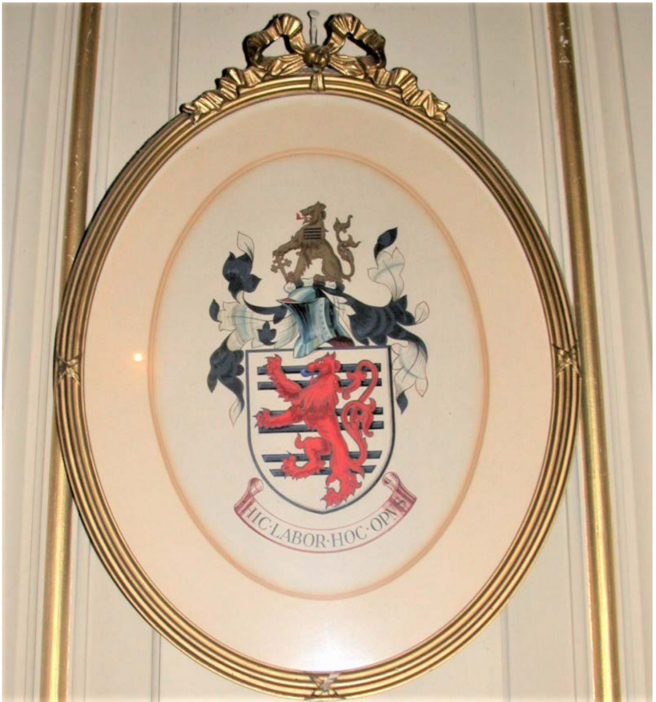
Image: Martindale Hall - Mortlock Coat of Arms.