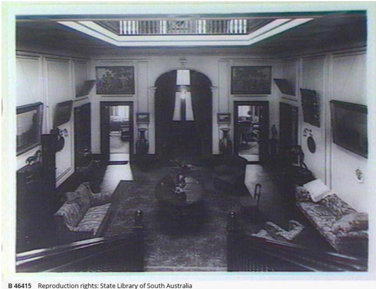
B 46415

The Pictorial Collection includes a variety of original artworks and machine-woven tapestries used to decorate the house in a manner fitting a grand country mansion. Of particular note are the Mortlock family portraits that hang in the first floor gallery above the hall. There is also a series of photographs depicting the lifestyle and interests of the Mortlock family, including their sporting pursuits, travel and the prize winning rams that supported the success of their pastoral empire.