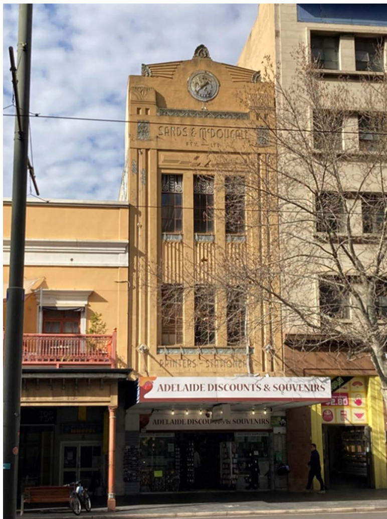
former Sands & McDougall Building

It was also pleased to note that the developers of this site have produced a suitable design that incorporates this important art deco facade into the new build.