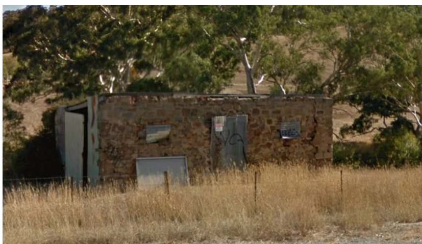
Image: The blacksmith/stable is the only remaining structure associated with the Traveller's Inn at Blumberg.

Council agreed this nomination did not meet any of the criteria for provisional entry.