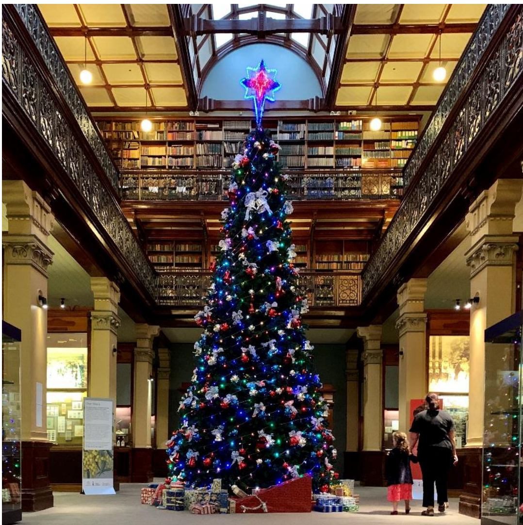
Image: Mortlock Library Christmas Tree.

The South Australian Heritage Council wishes everyone a very Merry Christmas and a heritage filled 2021!