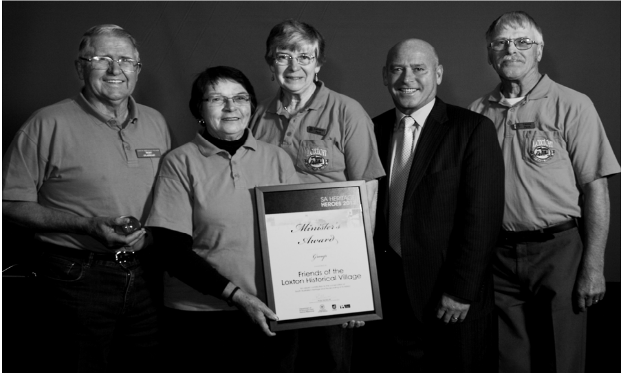
Friends of the Loxton Historical Village receiving the Heritage Heroes award from the Minister, Hon Paul Caica MP.