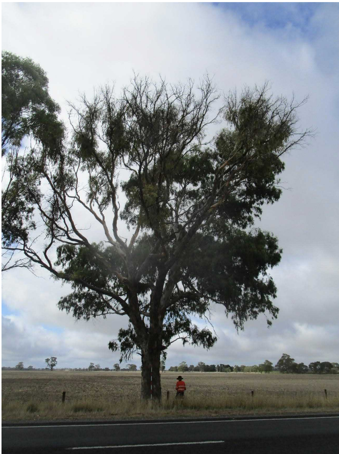
Plate 10-4: Scattered tree 12 (was S_4) (centre)