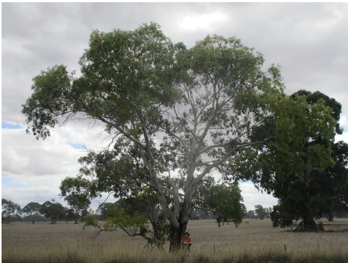
Plate 10-36: Scattered tree 41 (was S_36)(centre)