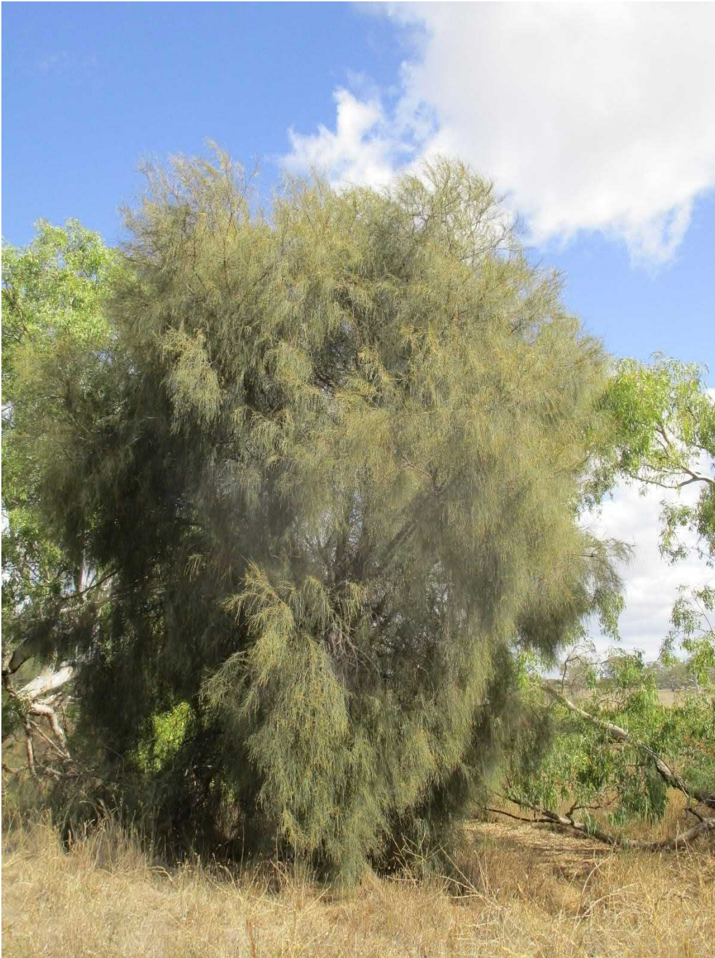
Plate 10-51: Amenity tree 5 (S_AT5)(centre)