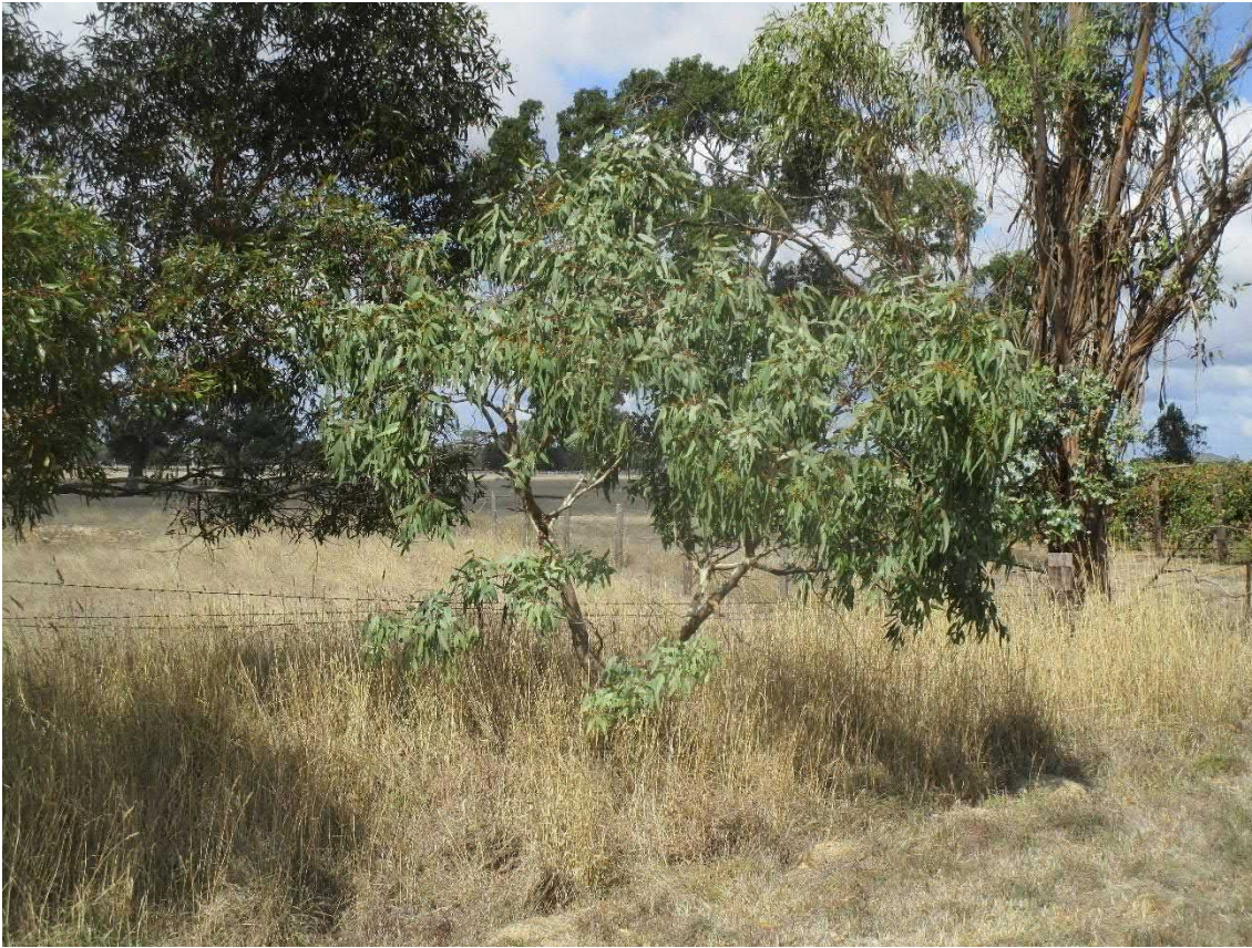
Plate 10-19: Scattered tree 26 (was S_19)(centre)