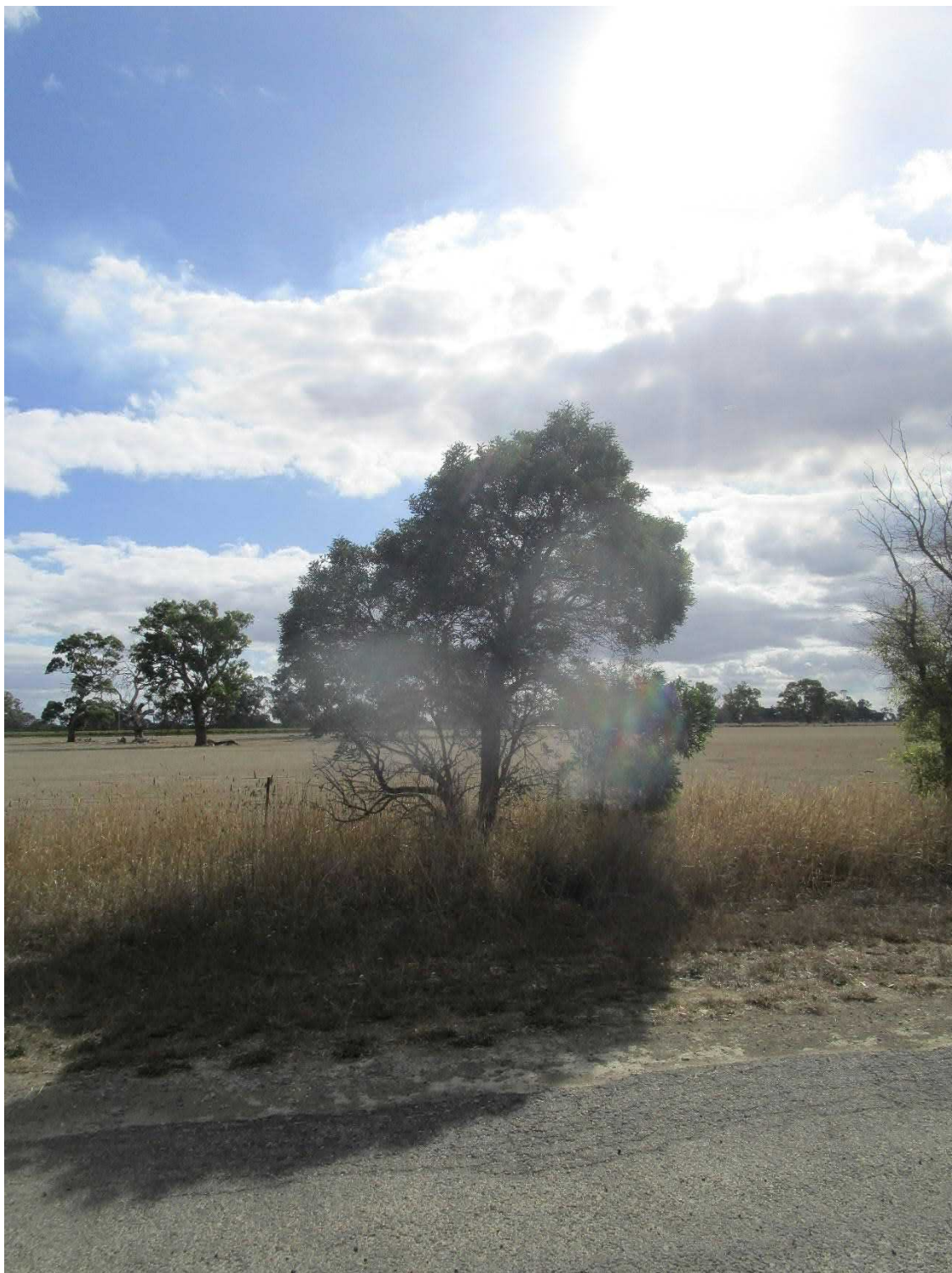
Plate 10-39: Scattered tree 44 (was S_39)(centre)