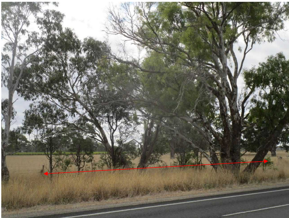
Plate 10-43: Scattered tree clump F (was S_D)(as indicated above)