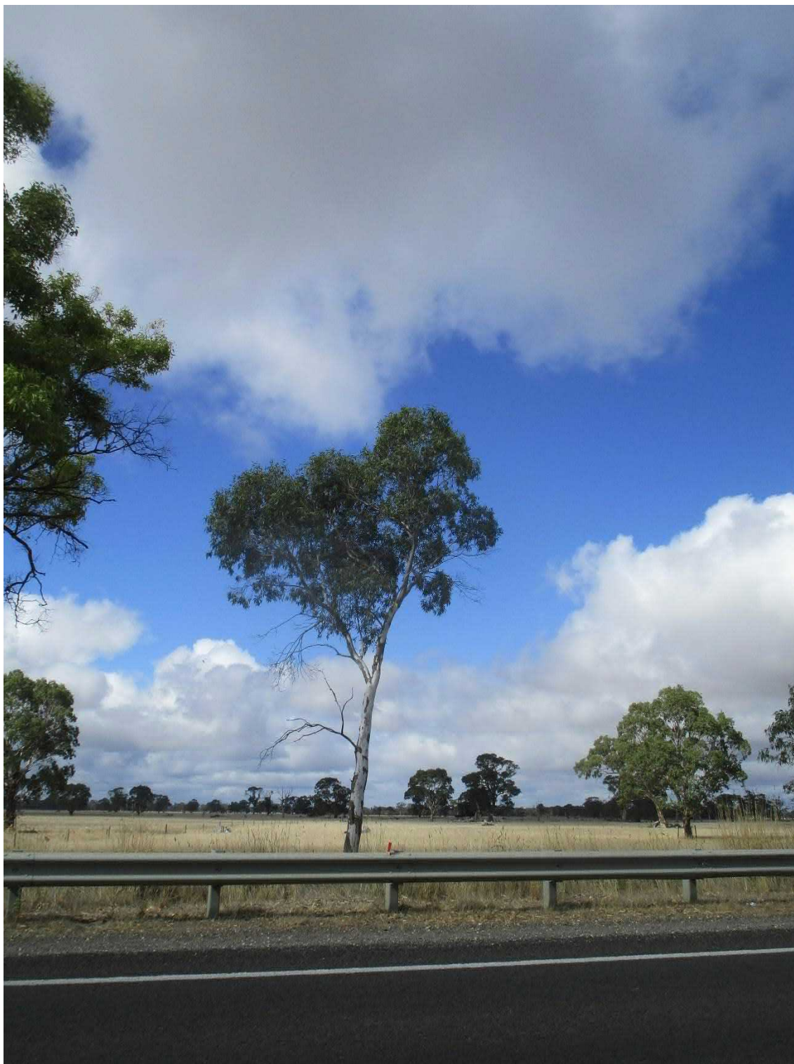
Plate 10-13: Scattered tree 20 (was S_13) (centre)