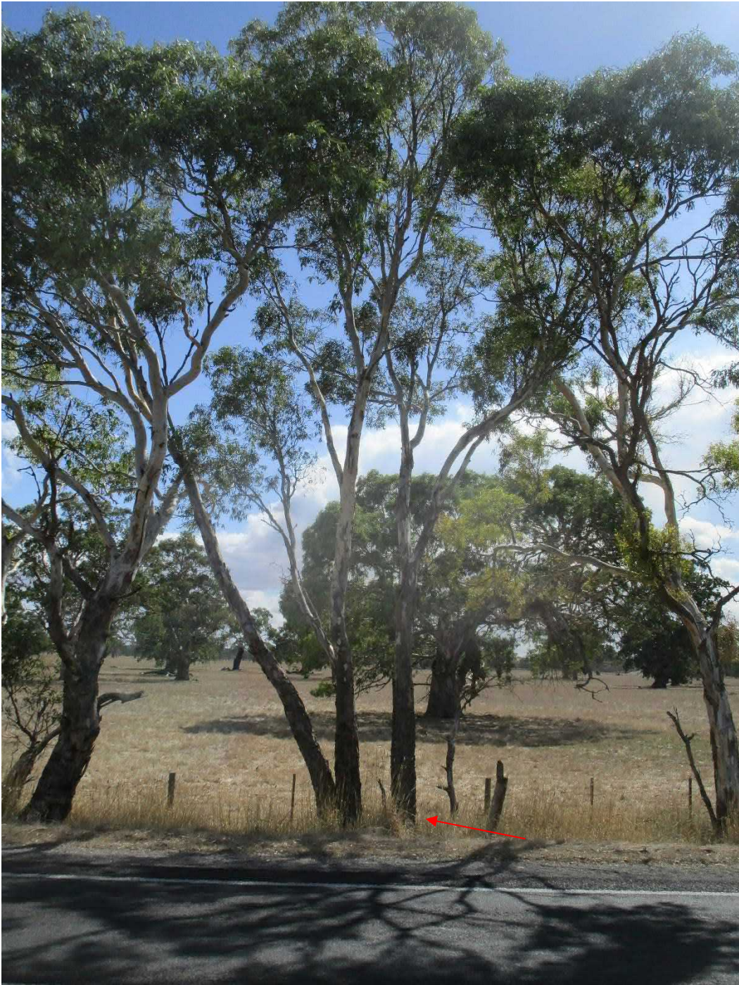
Plate 10-23: Scattered tree 30 (was S_23)(centre, right)