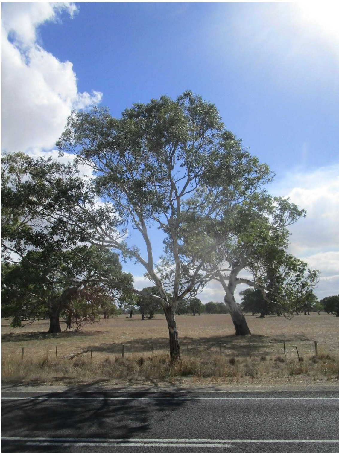
Plate 10-27: Scattered tree 34 (was S_27)(centre)