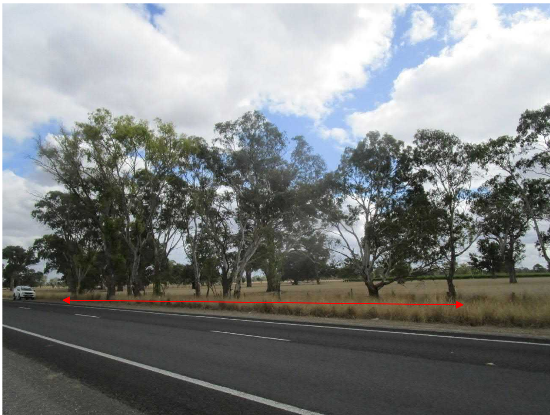
Plate 10-44: Scattered tree clump G (was S_E)(as indicated above)