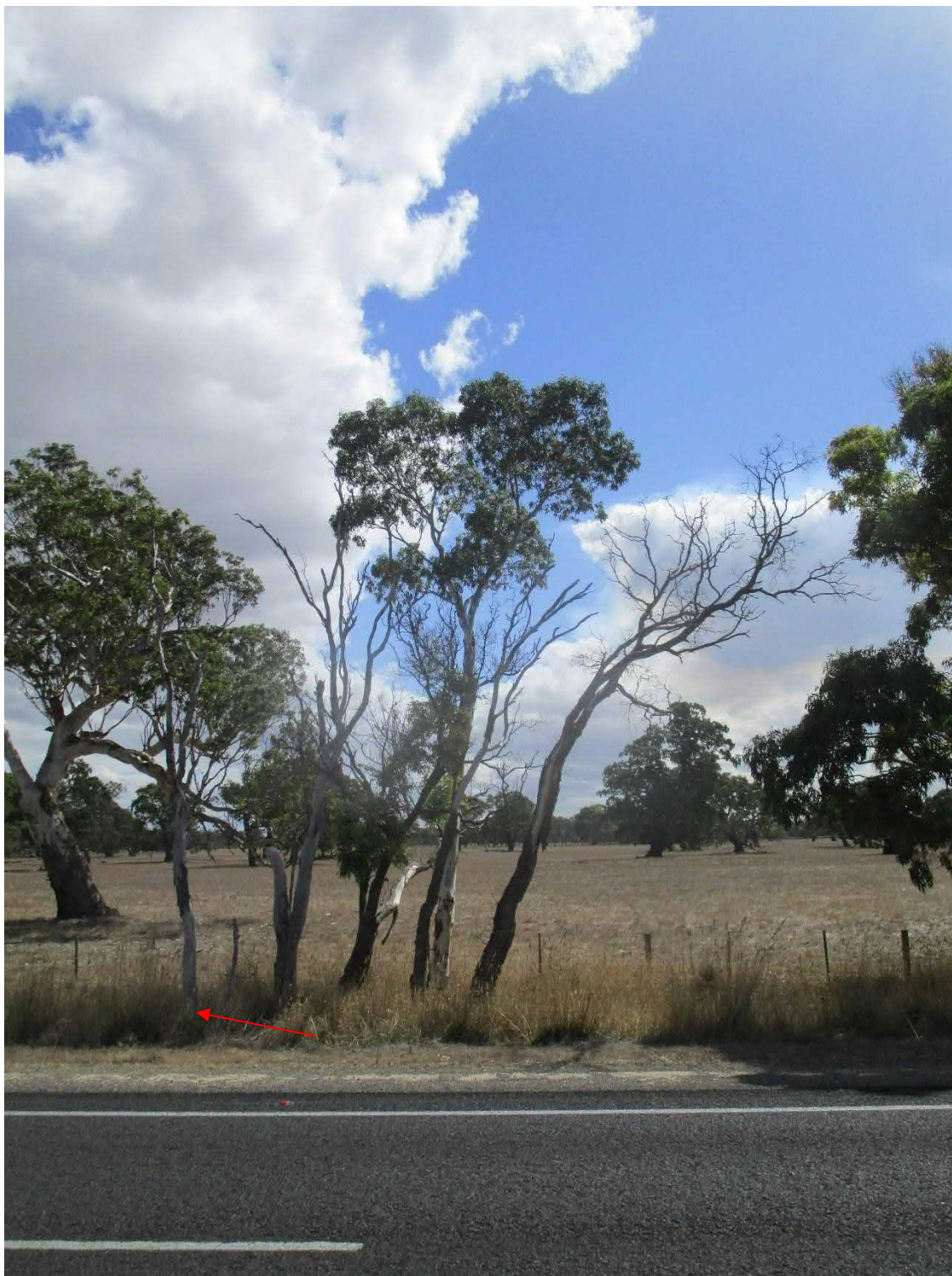
Plate 10-28: Scattered trees (dead), original tree number S_28 (left), not on map, not in scattered tree sheet.