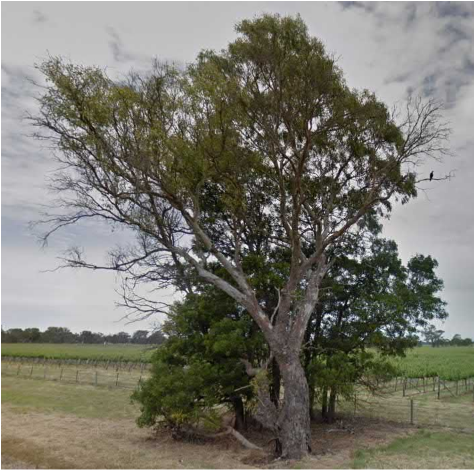
Plate 10-40: Scattered tree clump C (was S_A) with Scattered tree 18 (was S_C) in foreground