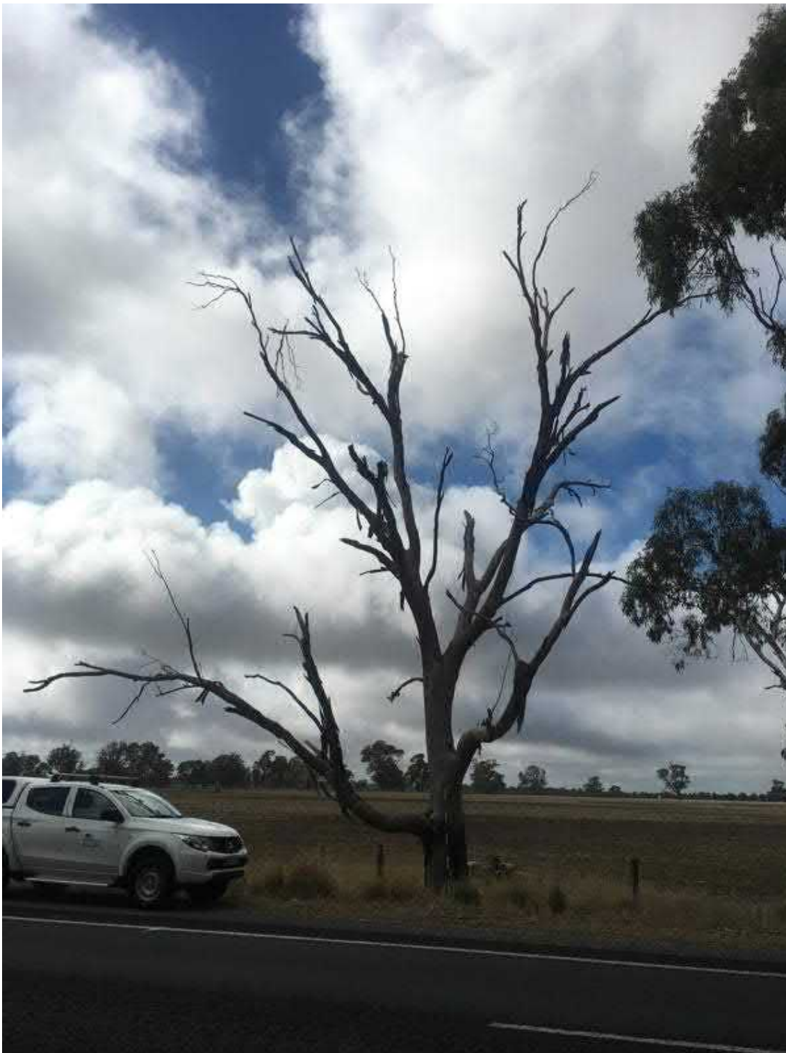
Plate 10-2: Scattered Tree 10 (was S_2, DEAD) (centre by road)