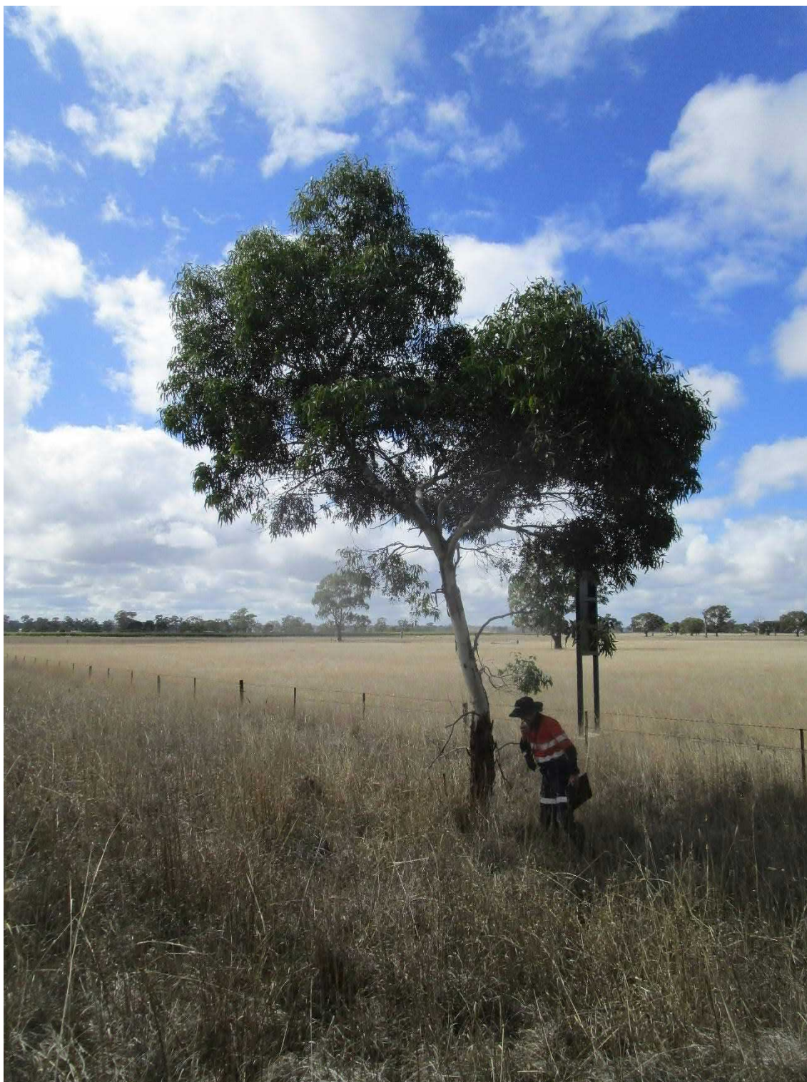
Plate 10-47: Amenity tree 1 (S_AT1)(centre)