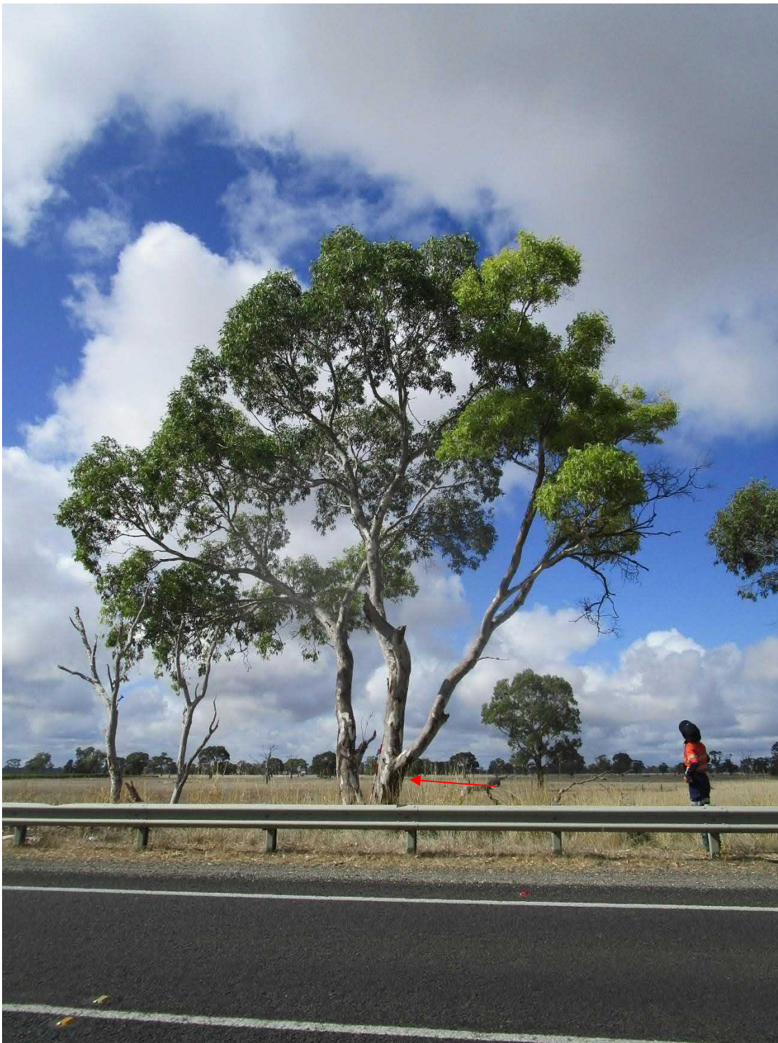
Plate 10-12: Scattered tree 19 (was S_12) (centre, multi-stemmed)