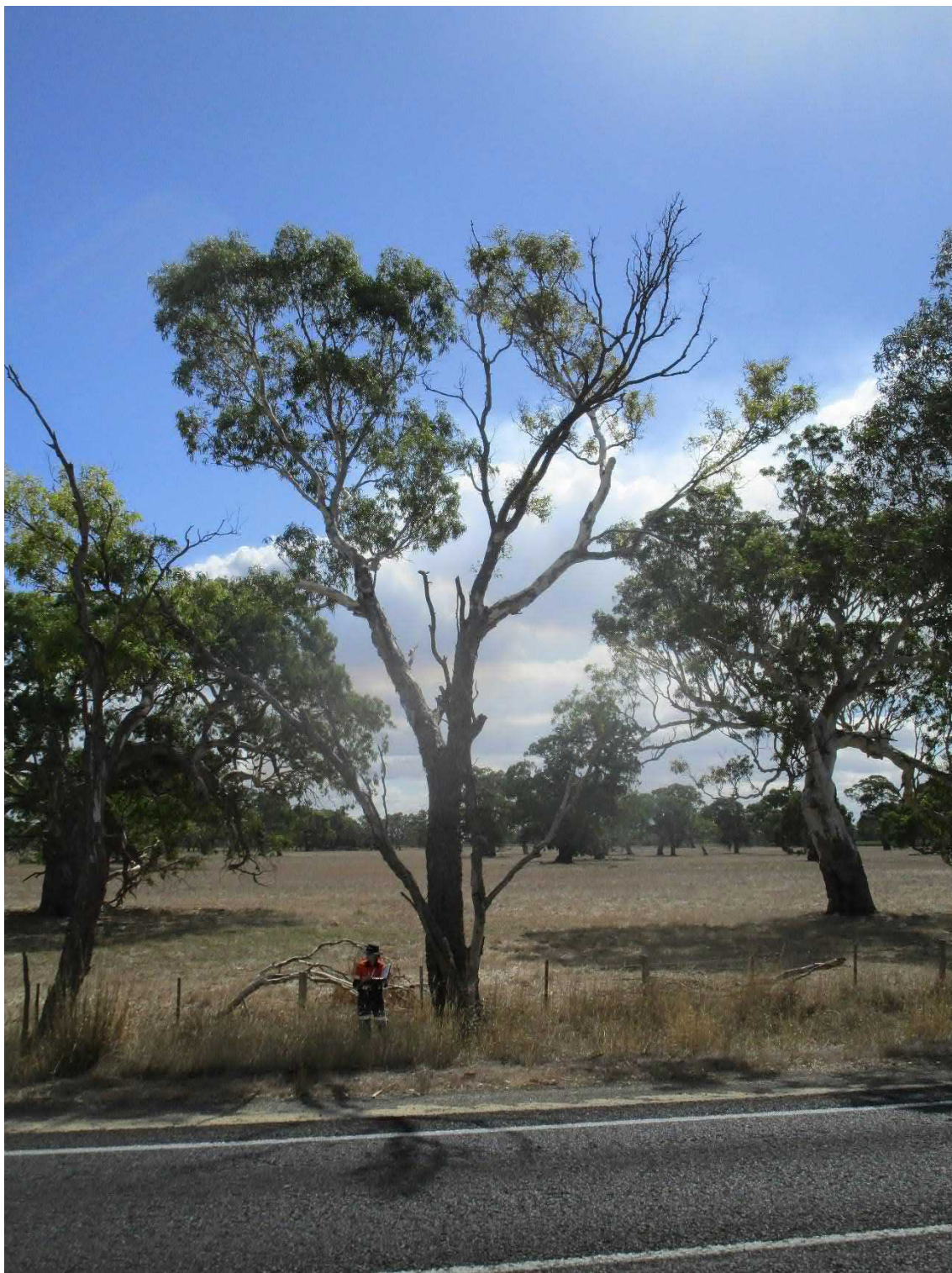
Plate 10-26: Scattered tree 33 (wasS_26)(centre)