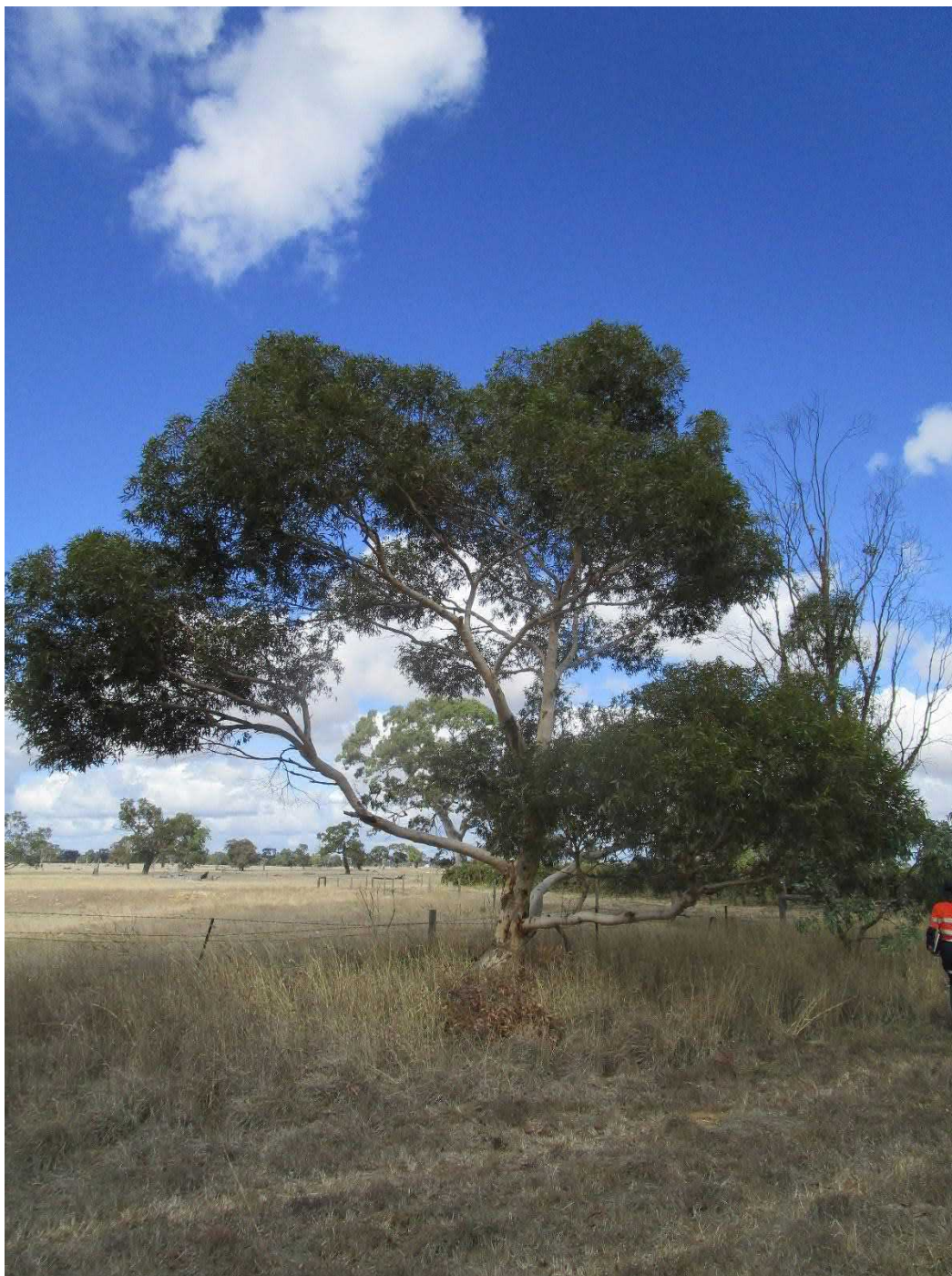
Plate 10-50: Amenity tree 4 (S_AT4)(centre)