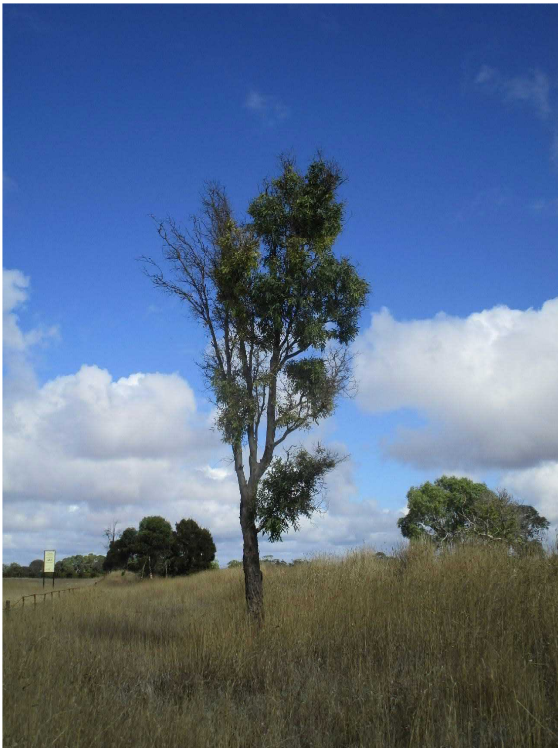
Plate 10-15: Scattered tree 22 (was S_15)(centre, foreground)