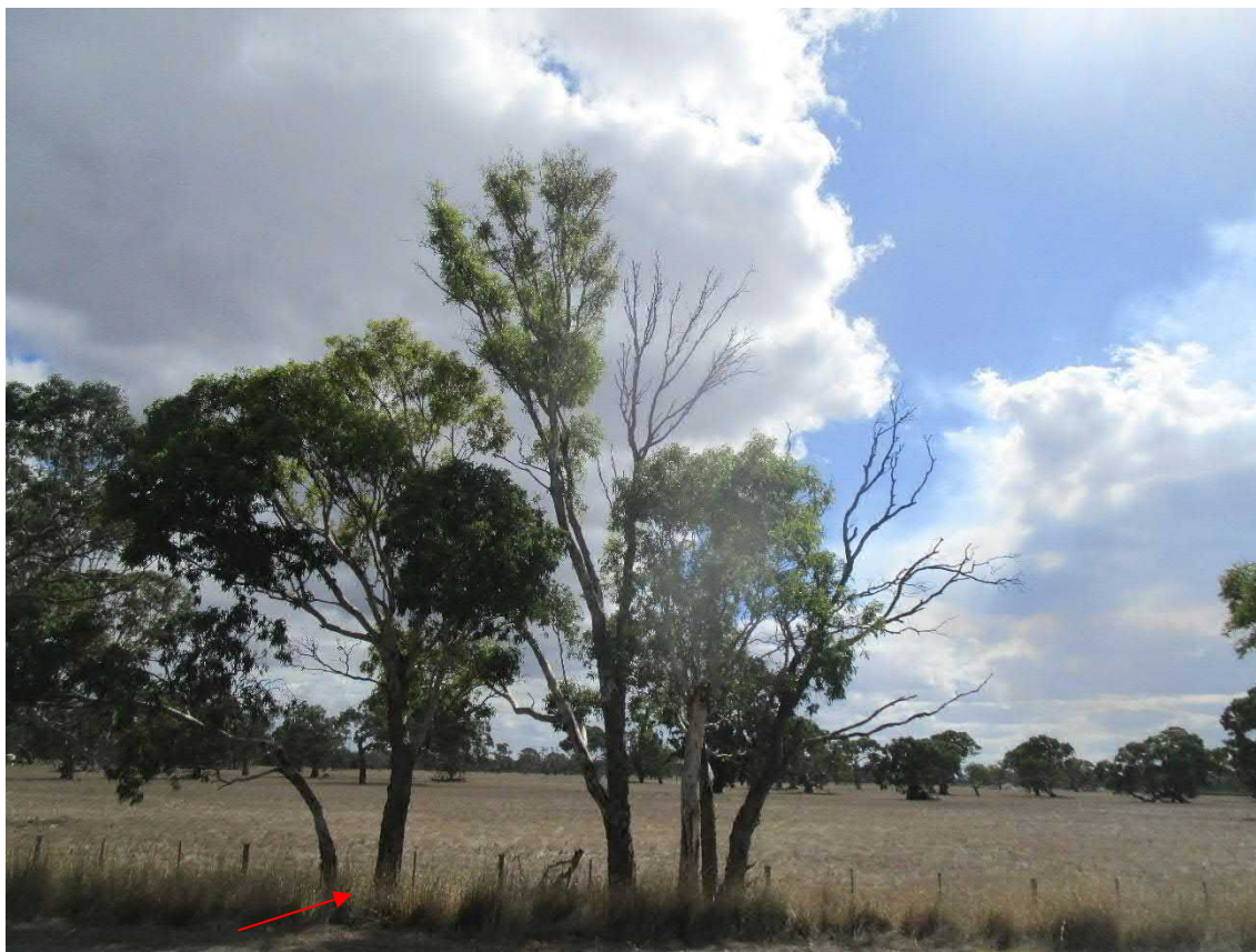
Plate 10-32: Scattered tree 37 (was S_32)(left, multi-stemmed)