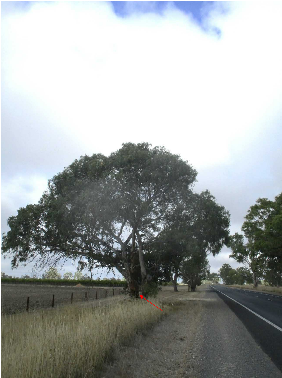
Plate 10-6: Scattered tree 14 (was S_6) (centre)