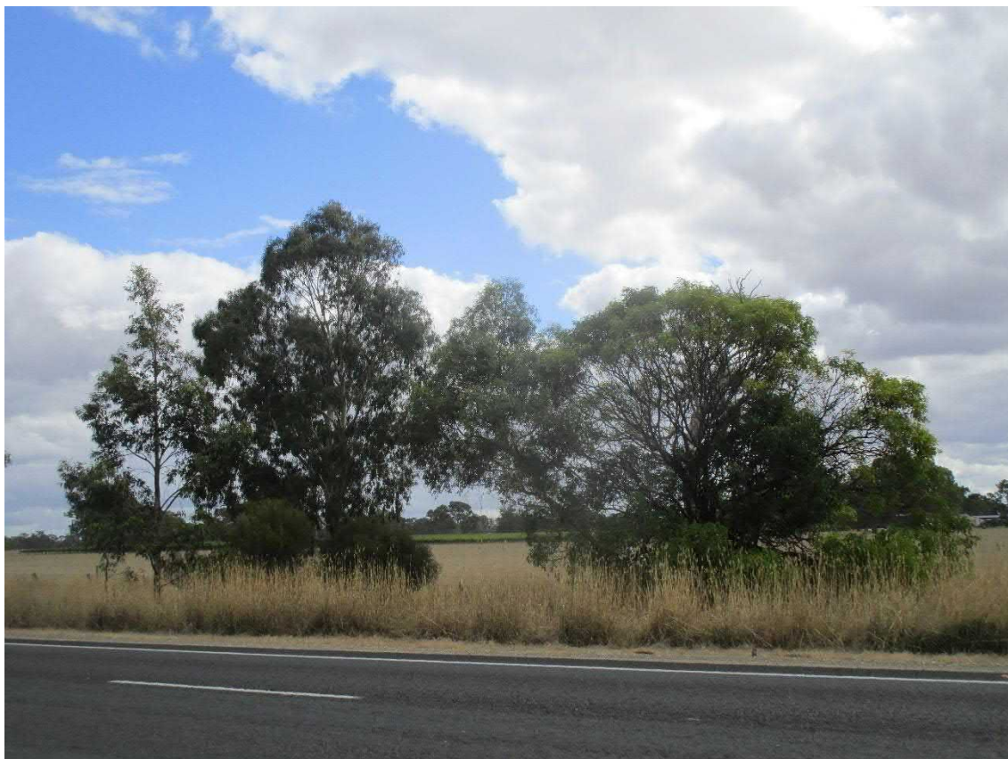
Plate 10-45: Amenity patch 1 (S_AP1)(patch as shown above – all vegetation)