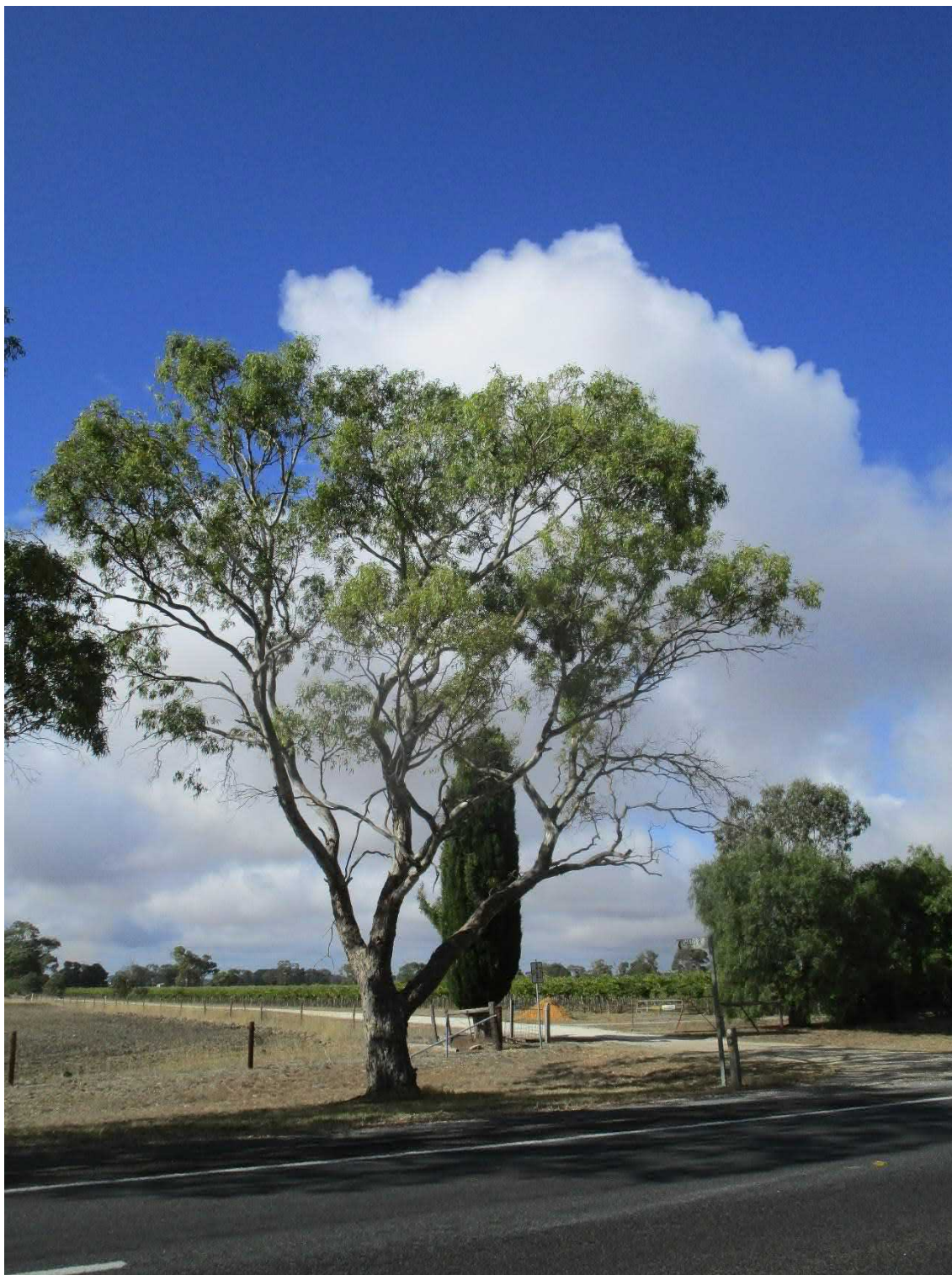
Plate 10-9: Scattered tree 17 (was S_9) (centre, roadside)