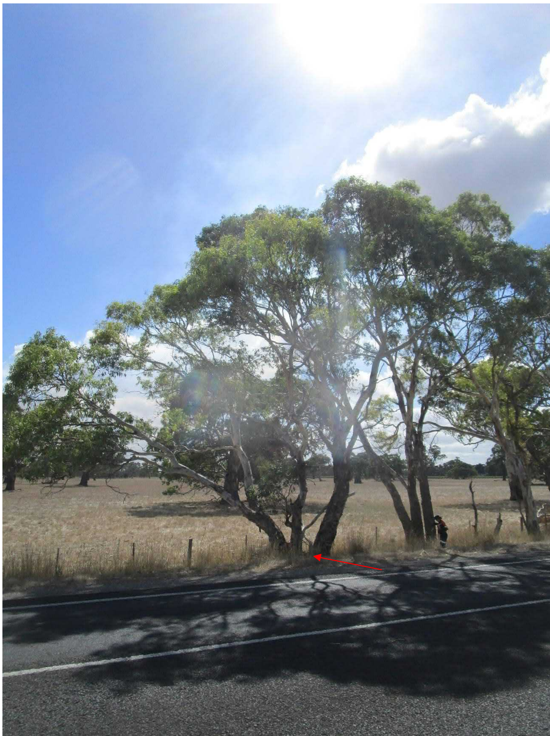
Plate 10-21: Scattered tree 28 (was S_21) (centre, multi-stemmed)