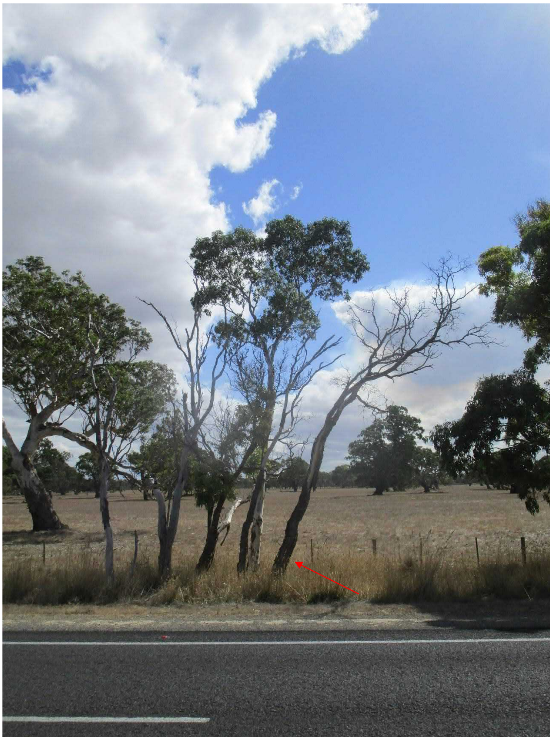
Plate 10-31: Scattered tree (was S_31) (dead) (right), not on map, not in scattered tree sheet