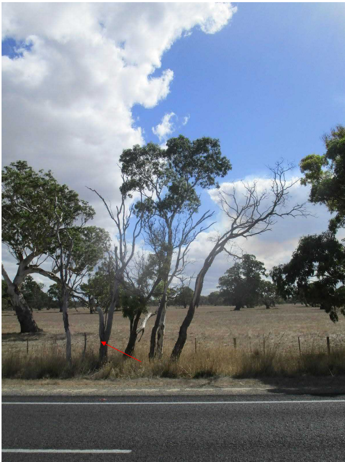
Plate 10-29: Scattered tree 35 (was S_29) (second from left)