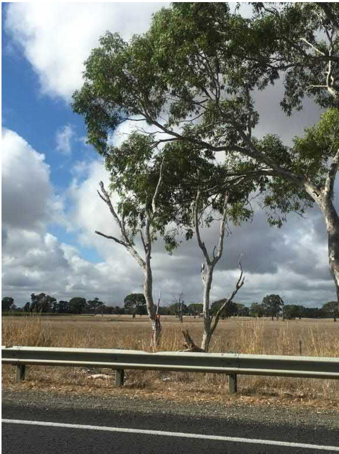
Plate 10-11: Scattered trees (dead, not included in scattered tree sheet, S_11 in DIT sheet)(centre)