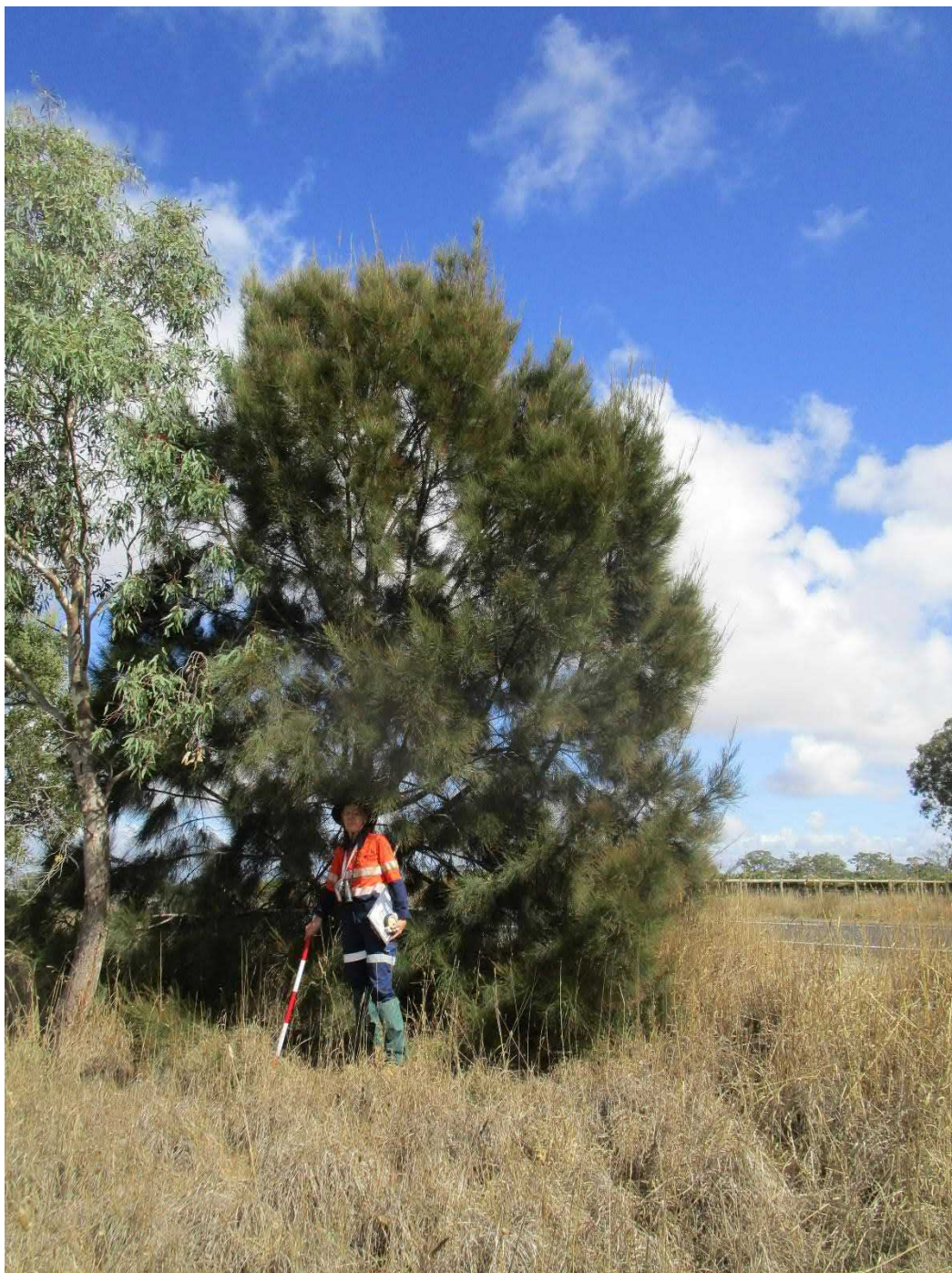
Plate 10-49: Amenity tree 3 (S_AT3)(centre)