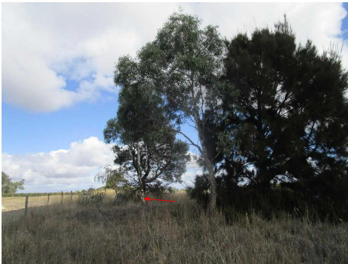
Plate 10-17: Scattered tree 24 (was S_17) (left side, front tree)