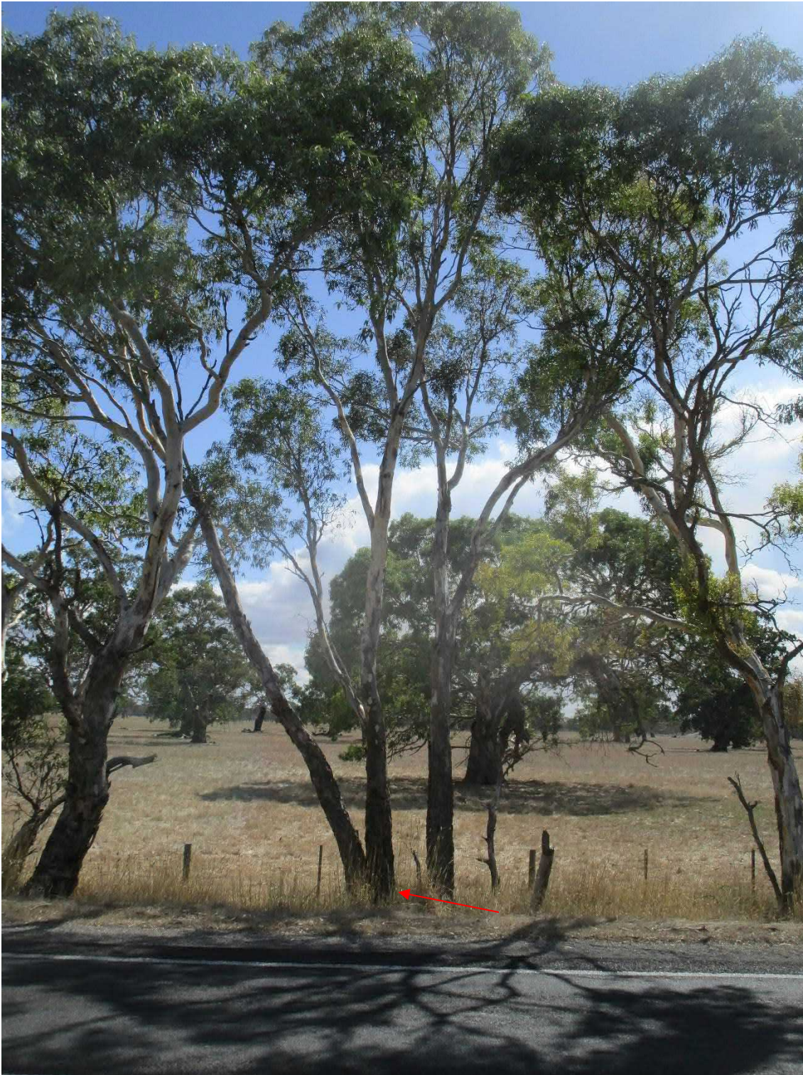
Plate 10-22: Scattered tree 29 (was S_22)(centre left, multi-stemmed)