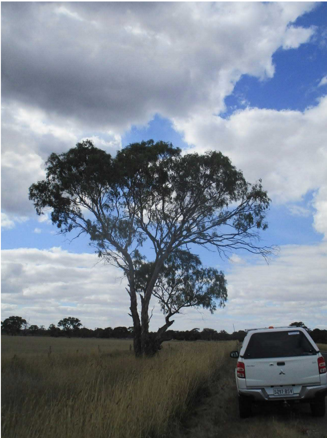
Plate 10-38: Scattered tree 43 (was S_38)(centre)