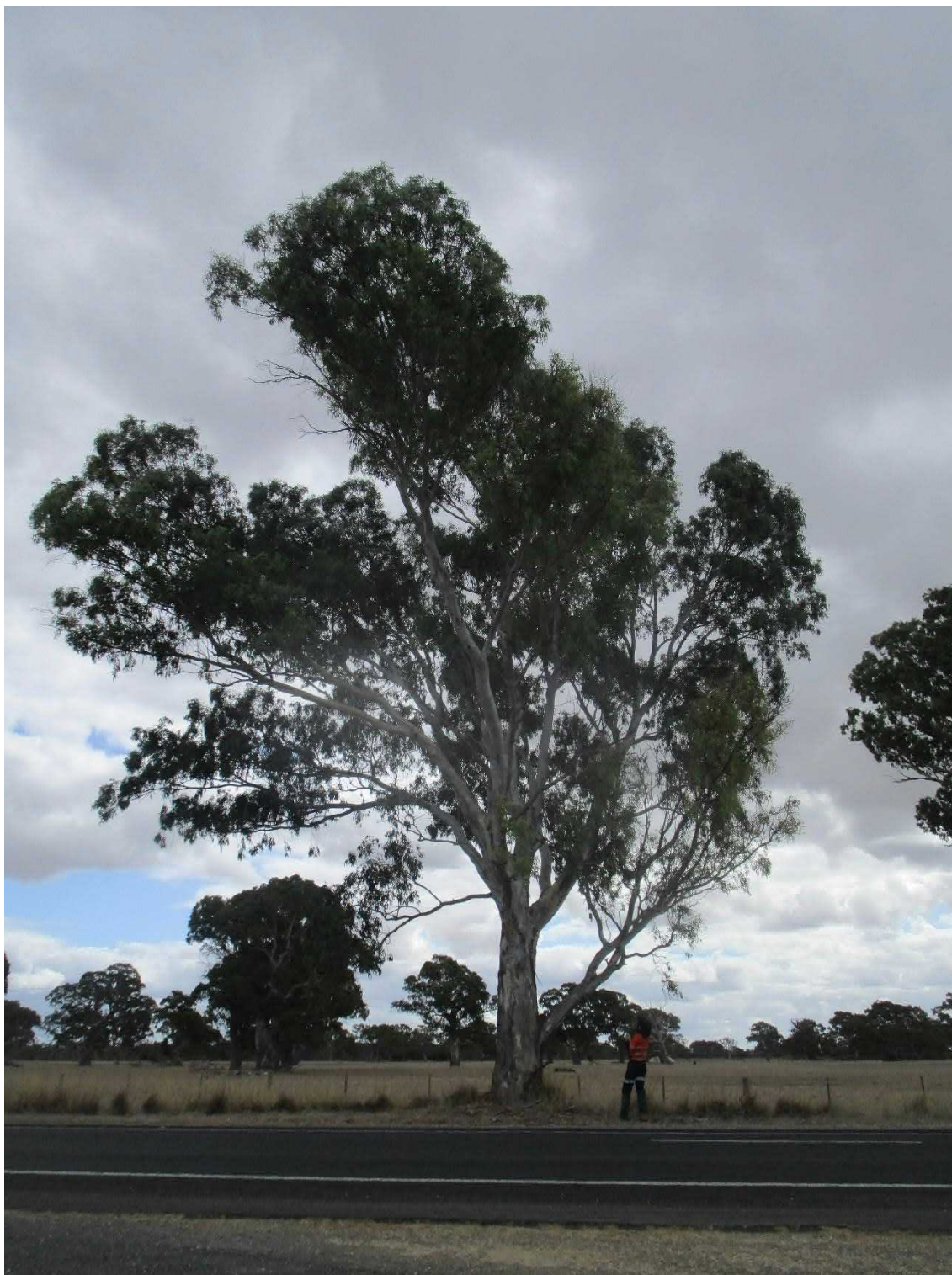
Plate 10-37: Scattered tree 42 (was S_37)(centre)