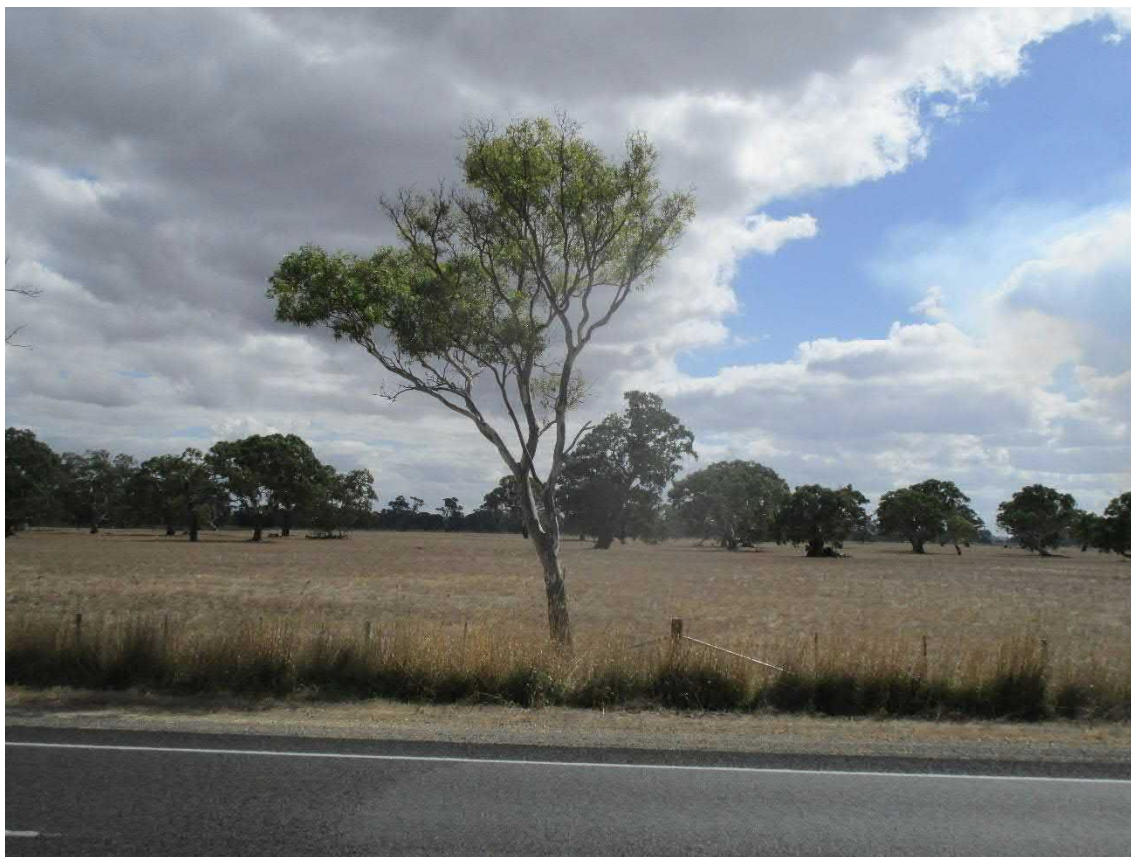
Plate 10-35: Scattered tree 40 (was S_35)(centre)