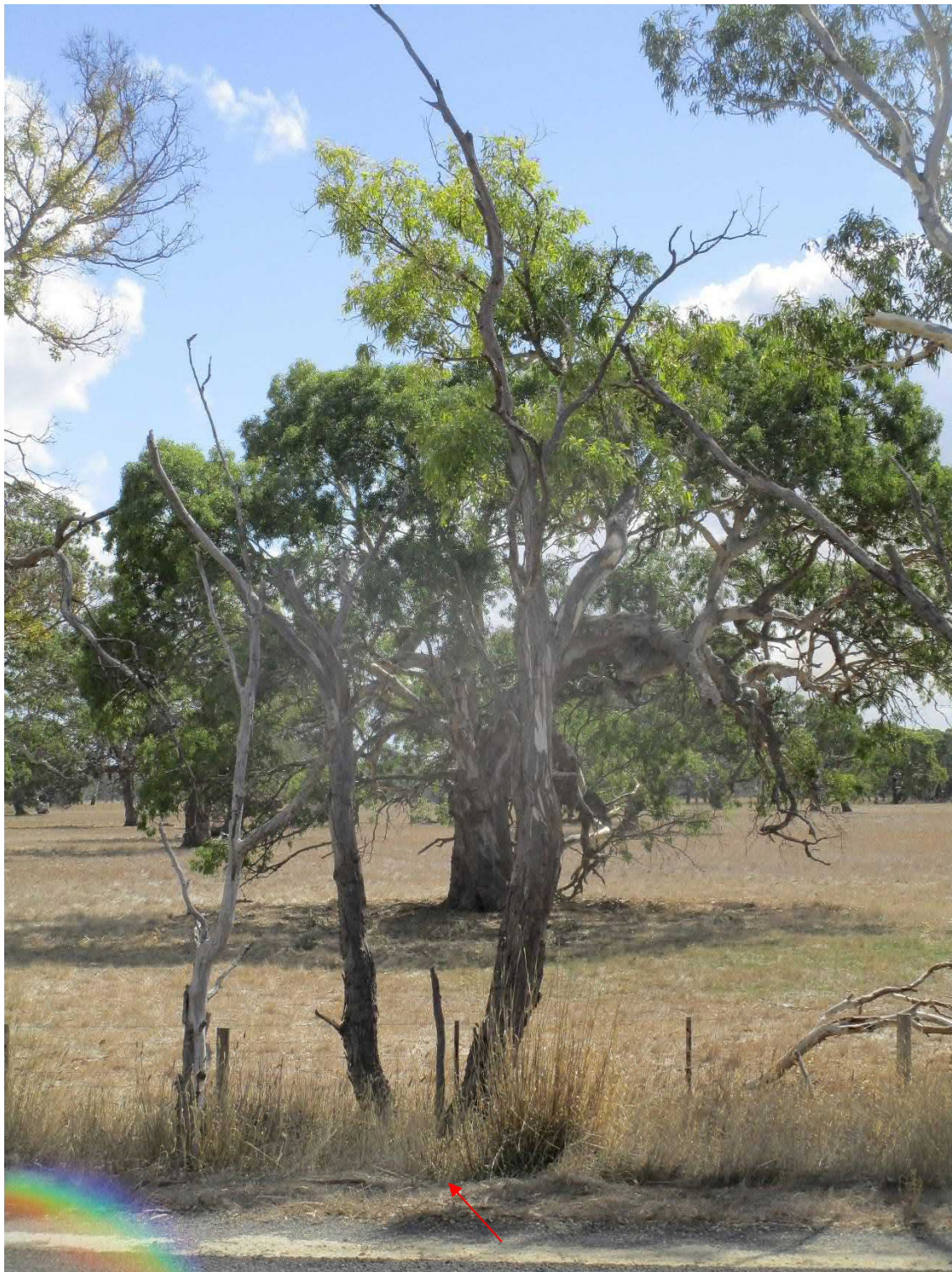
Plate 10-25: Scattered tree 32 (was S_25) (90% dieback) (centre on fence line)