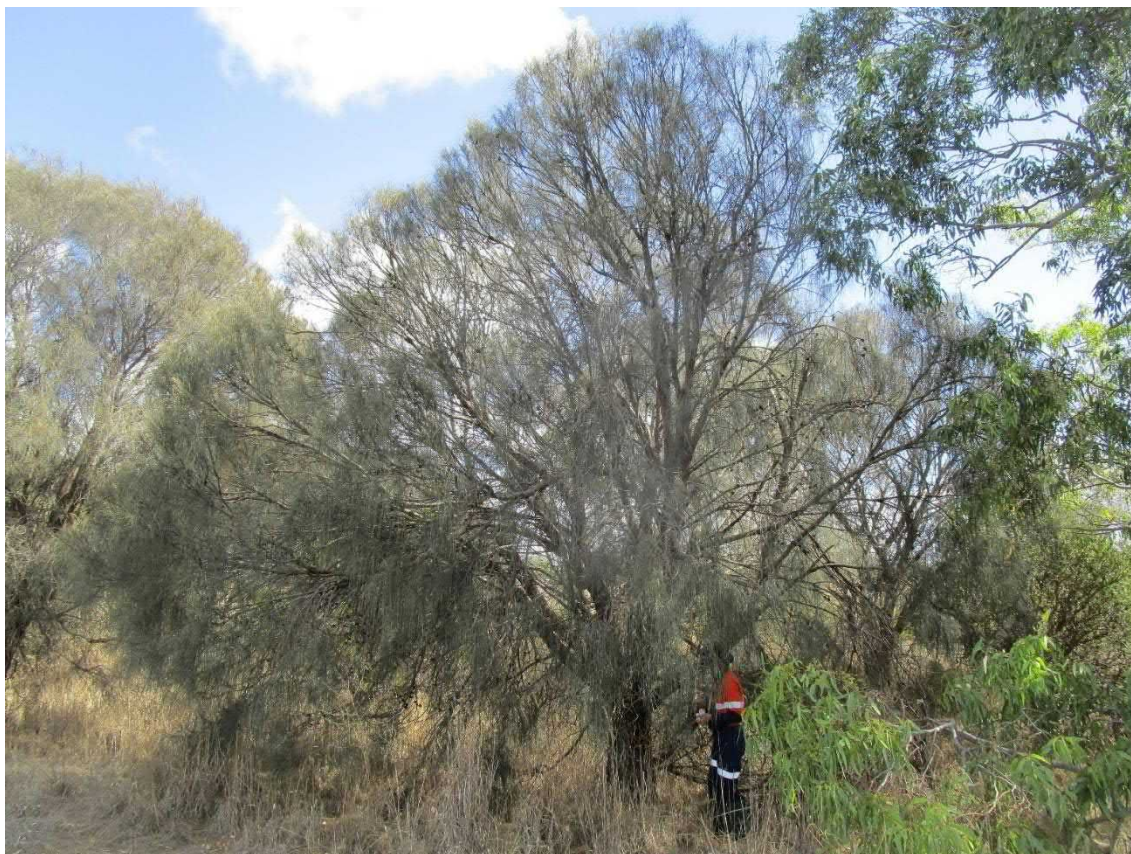
Plate 10-52: Amenity tree 6 (S_AT6)(centre)