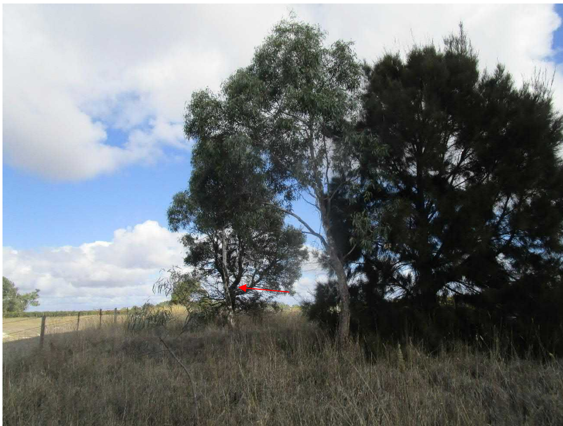
Plate 10-18: Scattered tree 25 (was S_18) (left side, rear tree)