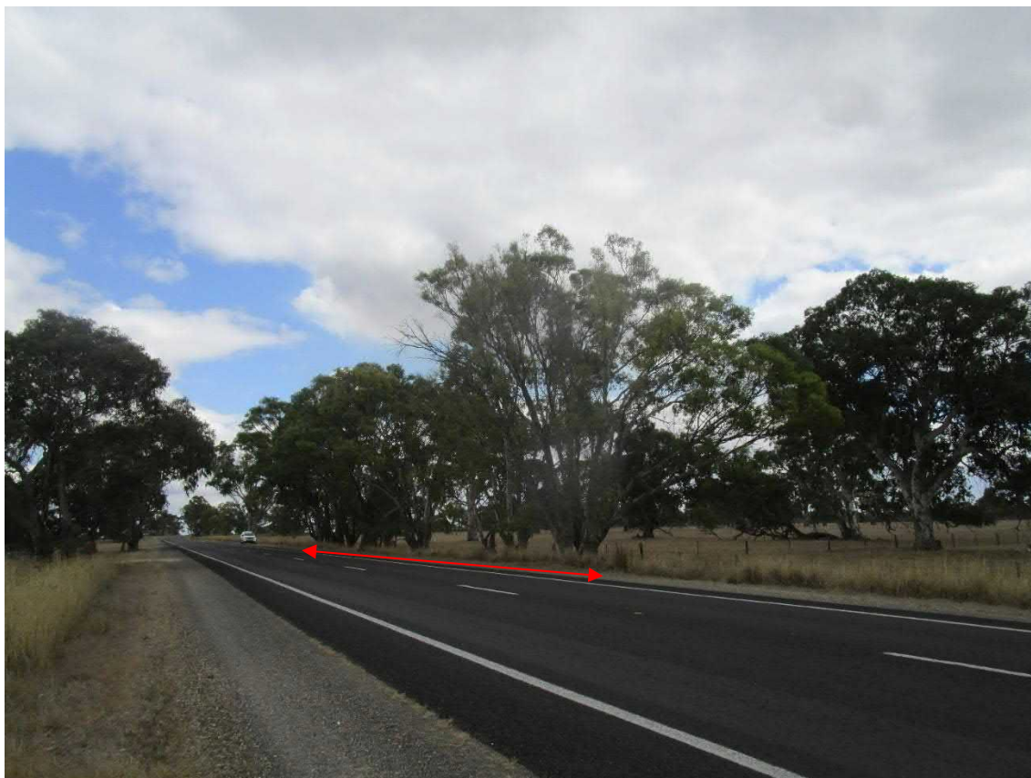
Plate 10-42: Scattered tree clump E (was S_C)(as indicated above)