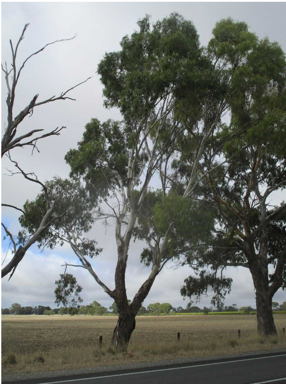
Plate 10-3: Scattered tree 11 (was S_3) (centre)