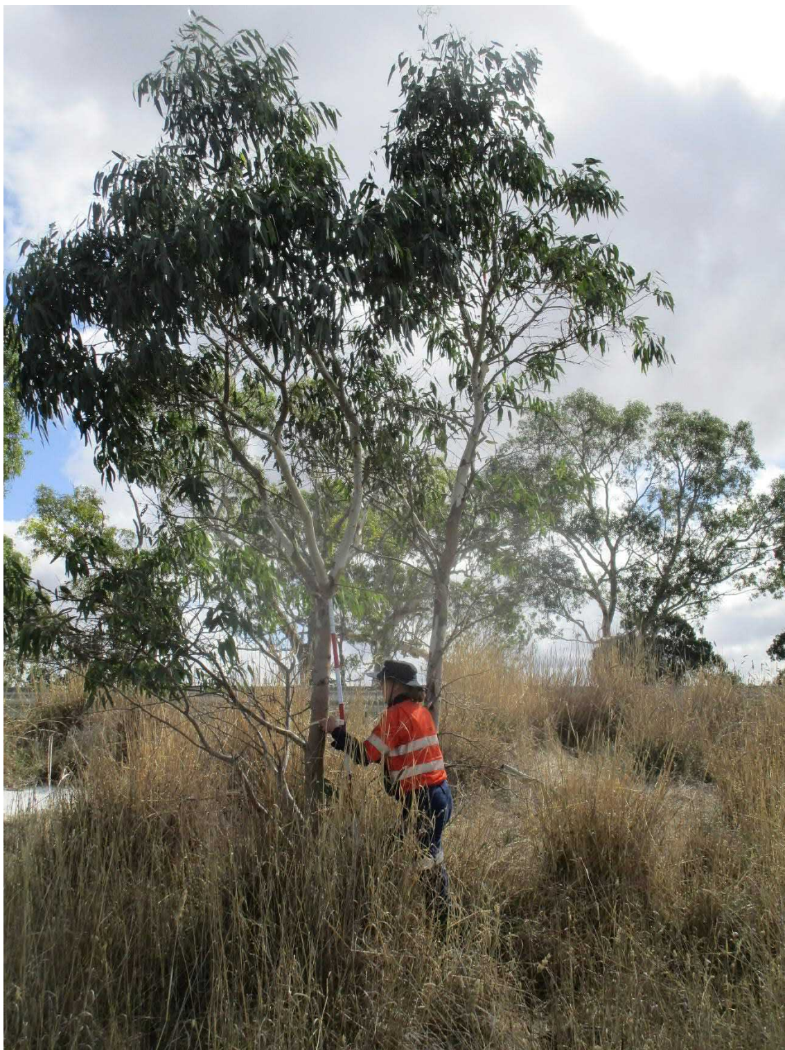
Plate 10-14: Scattered tree 21 (was S_14)(centre)