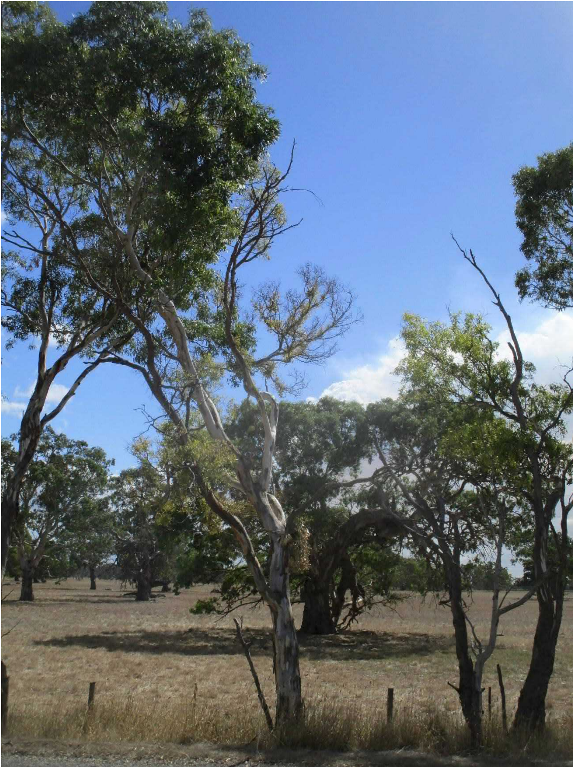
Plate 10-24: Scattered tree 31 (S_24) (centre)