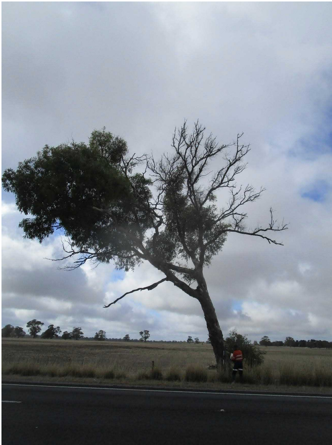
Plate 10-5: Scattered tree 13 (was S_5) (centre)