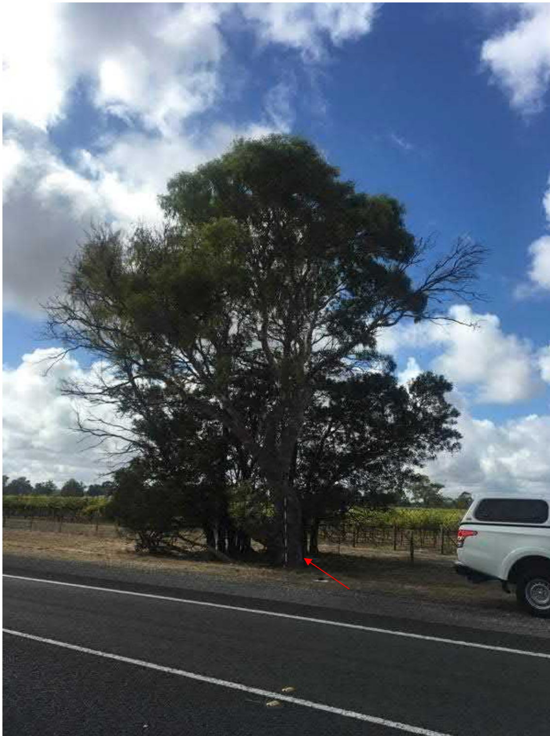
Plate 10-10: Scattered tree 18 (was S_10) (centre, front by roadside)