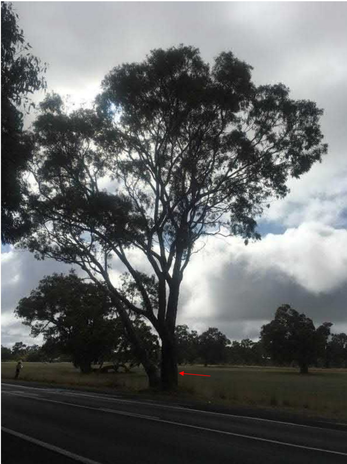
Plate 10-1: Scattered Tree 9 (was S_1, centre by road, multi-stemmed)

Amenity Trees / Patches or Scattered Trees being trimmed or removed