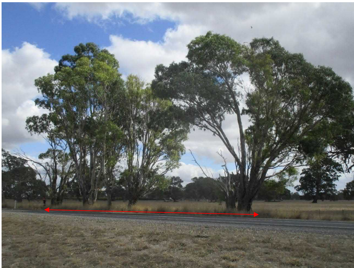
Plate 10-41: Scattered tree clump D (was S_B)(as indicated above)