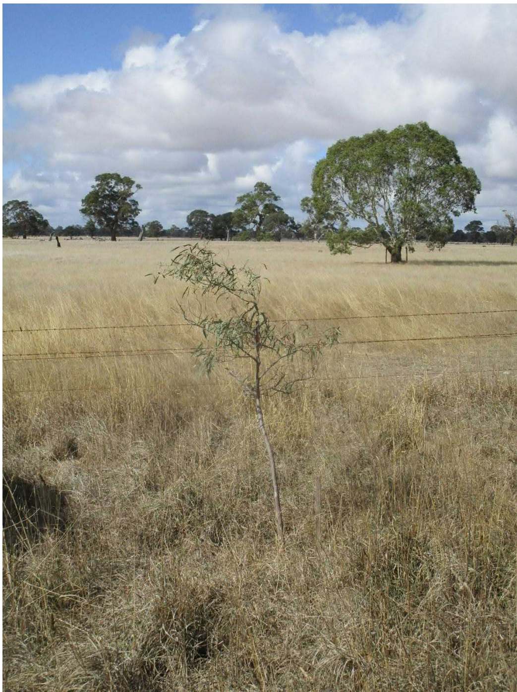
Plate 10-48: Amenity tree 2 (S_AT2)(centre) (sapling)