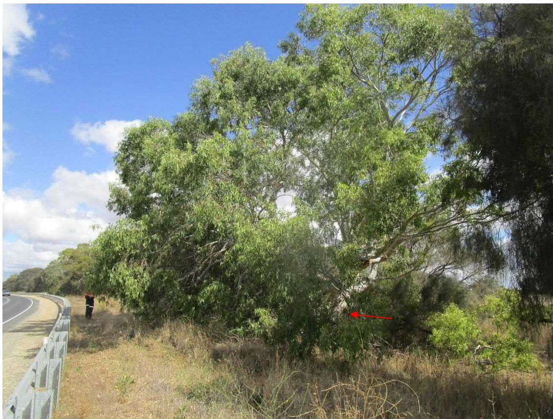
Plate 10-20: Scattered tree 27 (was S_20)(centre)