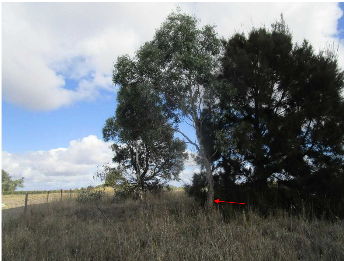
Plate 10-16: Scattered tree 23 (was S_16) (centre of photo next to Pine)