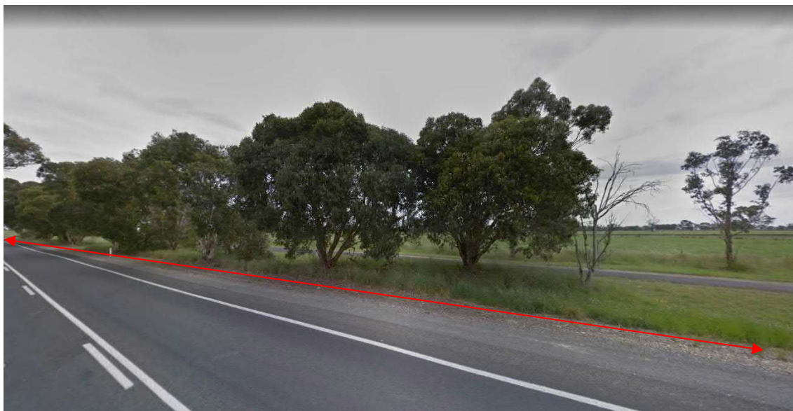
Plate 10-46: Amenity patch 2 (S_AP2) Layby. Facing south. All vegetation shown