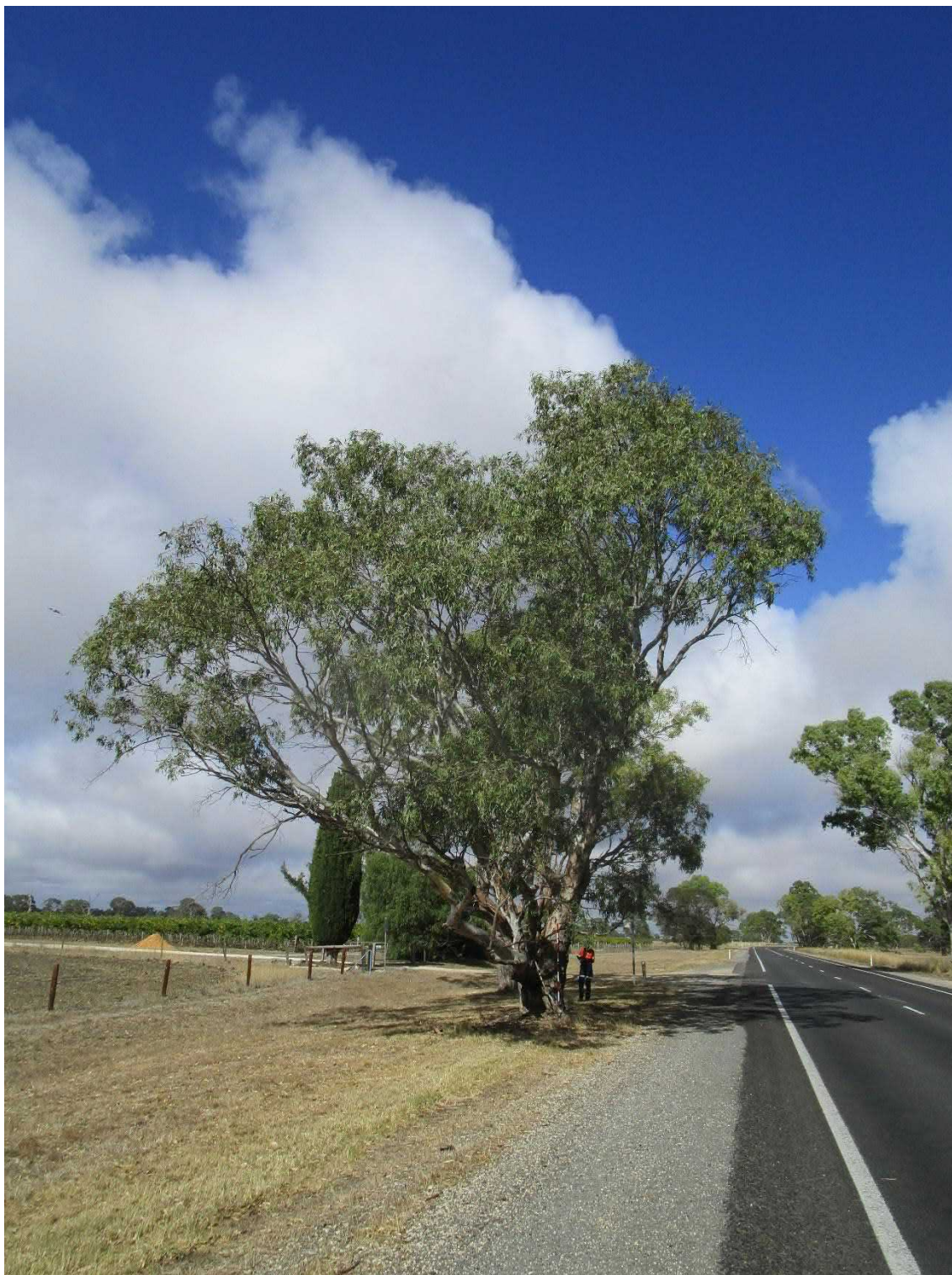
Plate 10-7: Scattered tree 15 (was S_7) (centre)