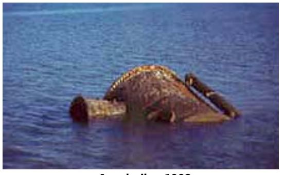
Iron boiler, 1992