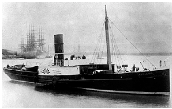
Paddle tug Adelaide.

Department of Marine and Harbors records indicate that Hines Metals scrapped numerous vessels in Port Pirie during the 1950s and 1960s, including the barge (ex tug) Myee and Adelaide Steam Tug Company's barges No. 7 (ex paddle tug Adelaide ) and No. 5 (ex steel barge Grampus ). Whether these sites were completely cleared, or remains were abandoned on the bank, is unknown at this stage.