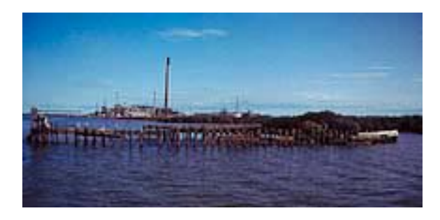
Wreck at Port Pirie, 1992 (Note position of chimney)

Aerial photographs from the 1940s show an abandoned vessel (possibly a wooden barge) near the BHP smelter, while a 1992 photograph shows deteriorating wreckage of what is probably the same vessel.