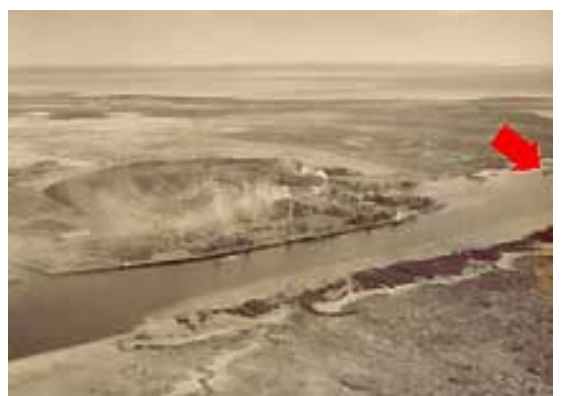
Aerial photograph of Port Pirie, 1945.