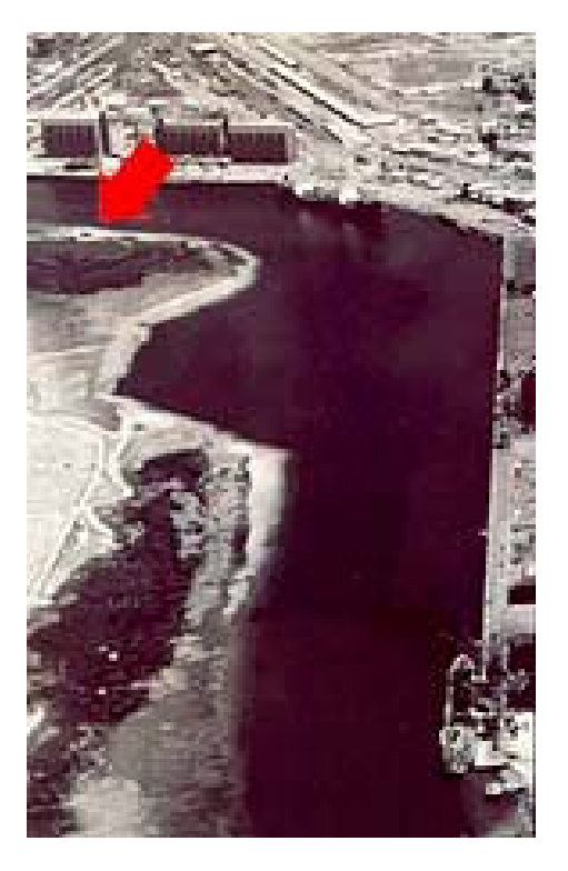
Aerial photograph of Port Pirie, 1968.

Department of Marine and Harbors records indicate that Hines Metals scrapped numerous vessels in Port Pirie during the 1950s and 1960s, including the barge (ex tug) Myee and Adelaide Steam Tug Company's barges No. 7 (ex paddle tug Adelaide ) and No. 5 (ex steel barge Grampus ). Whether these sites were completely cleared, or remains were abandoned on the bank, is unknown at this stage.