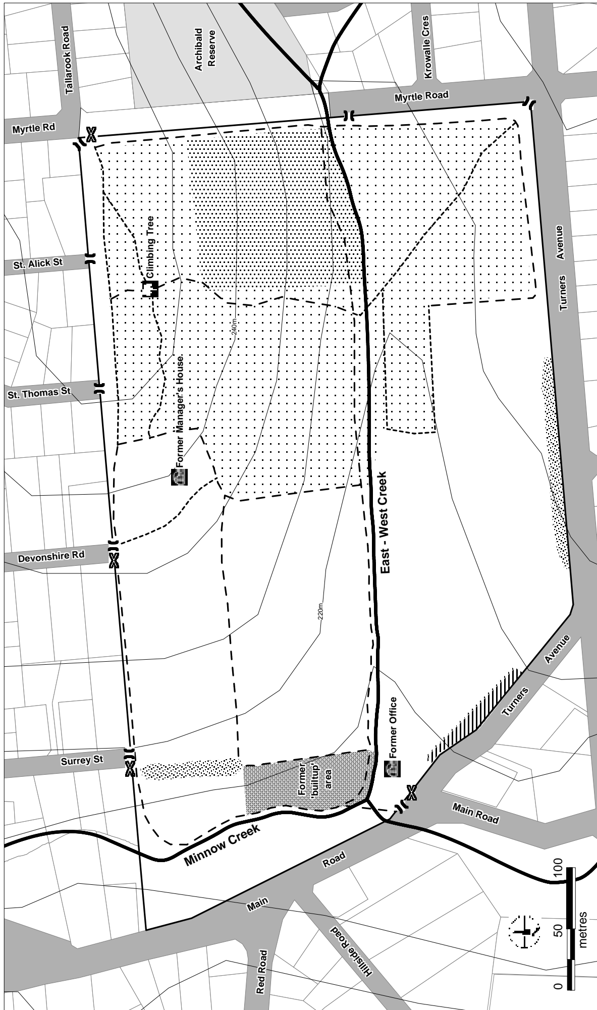
Figure 2 Blackwood Forest Recreation Park Features