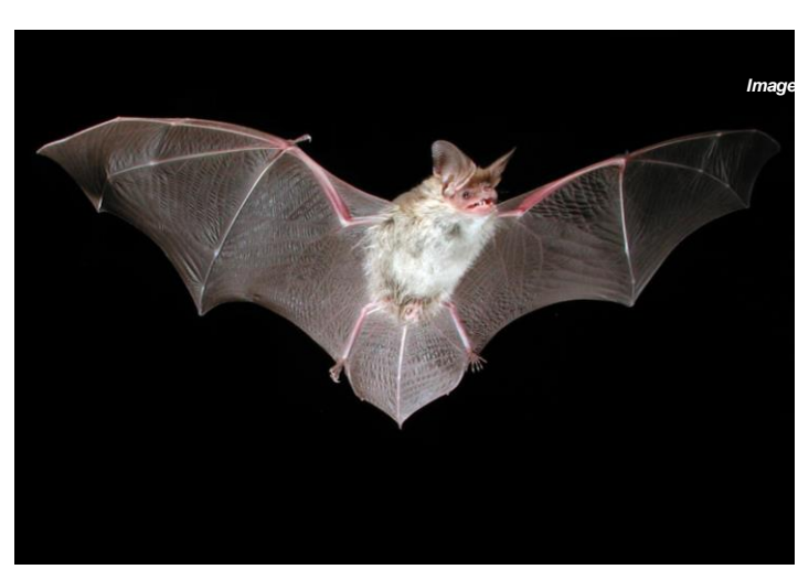
South-eastern Long-eared Bat

In South Australia, any dead tree south and east of Yunta and north of Swan Reach with a trunk circumference of two (2) metres or more and with hollows or a rotten butt is included as 'native vegetation' under the definition of the Act.