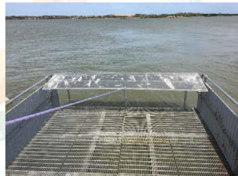
Figure 2. Gate at Tauwitschere barrage