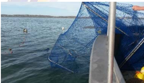
Figure 2. Double winged fyke net being checked

results of the underwater seal deterrent trials will be made available when all trials have finished and all data have been analysed.