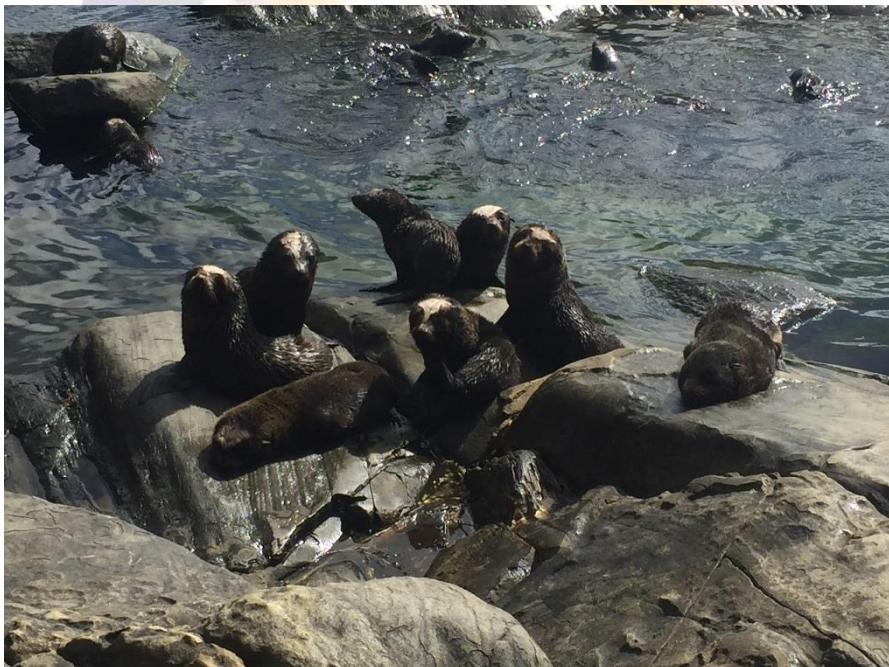
Figure 2: Long-nosed fur seals pup with hair-cuts, applied as a temporary mark to aid mark-recapture estimation of pup production in the Cape Gantheaume Wilderness Protection Area, Kangaroo Island.