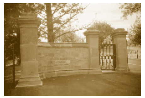
Reconstructed front gates, Scotch College.