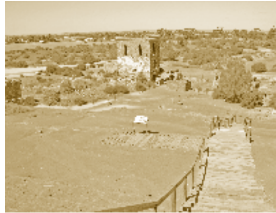
Moonta Mines State Heritage Area.