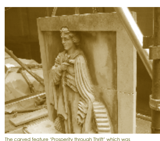
removed for cleaning and re-fixing of a new frame prior to refitting to the building.