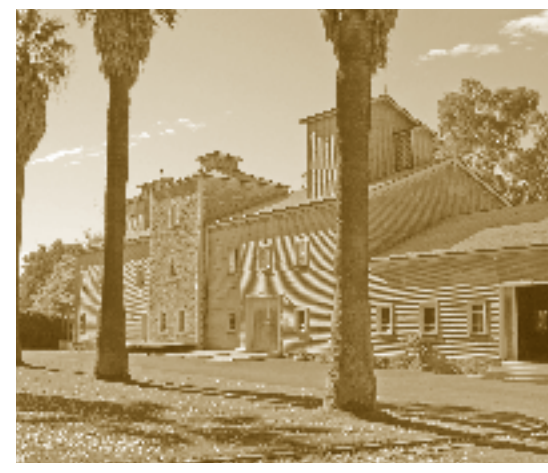
Distillery and Charger Shed, Seppeltsfield Winery Seppeltsfield, Barossa Valley