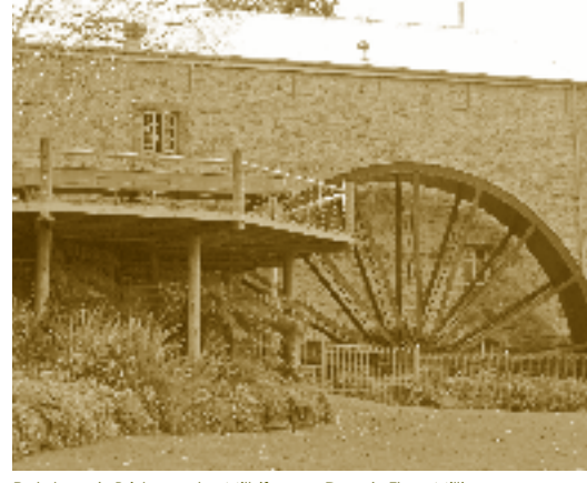
Petaluma's Bridgewater Mill (former Dunn's Flour Mill), Mount Barker Road, Bridgewater