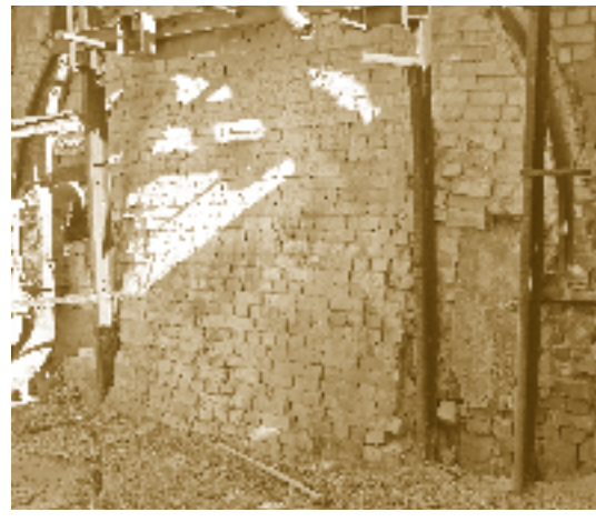
Three original Down-Draught Brick Kilns and Chimney, Krieg's (previously Nuriootpa) Brickyard, Murray Street, Nuriootpa.