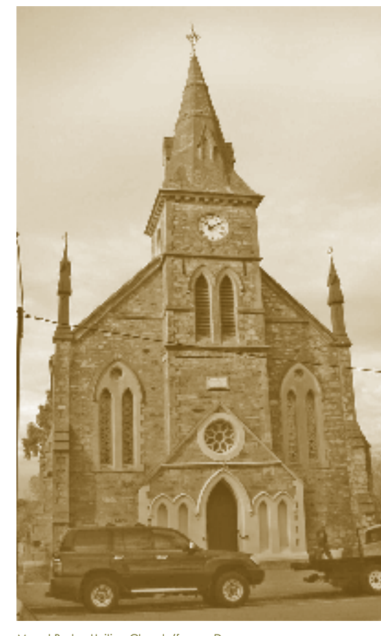
Mount Barker Uniting Church (former Dunn Memorial Church)