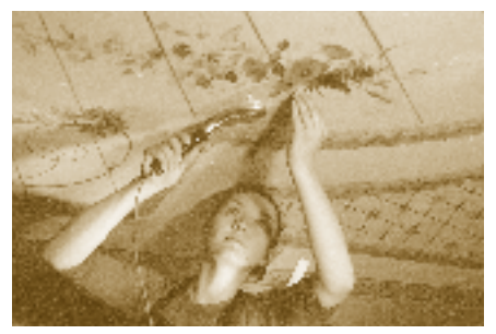
Conserving the ceiling of the Summer Sitting Room, Ayers House.