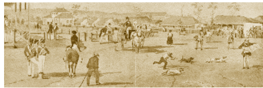
'North Terrace' painting by ST Gill. B7170.

The State Library holds all of the publications indexed and can provide copies. Library staff can also advise customers on the finer points of using the Index.