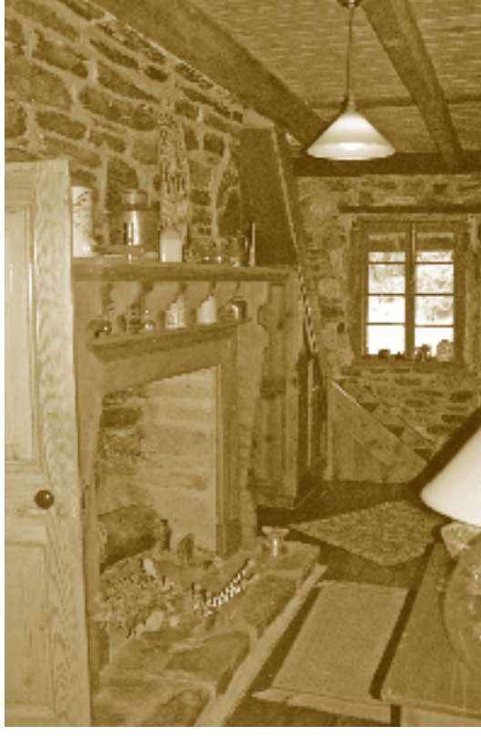
Schubert House "Flurkuchenhaus" or passage kitchen house