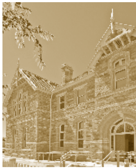
Sturt Street Community School