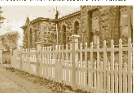
North Adelaide Primary School, fence designed by Heritage Fencing in conjunction with Swanbury Penalase Architects.