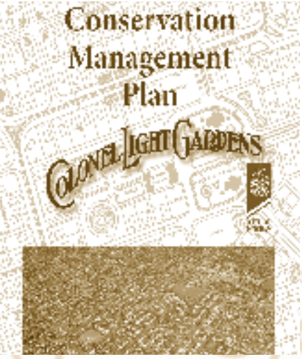
Colonel Light Gardens Conservation Management Plan.