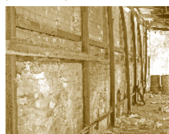
Three original Down-Draught Brick Kilns and Chimney, Krieg's (previously Nuriootpa) Brickyard, Murray Street Nuriootpa.