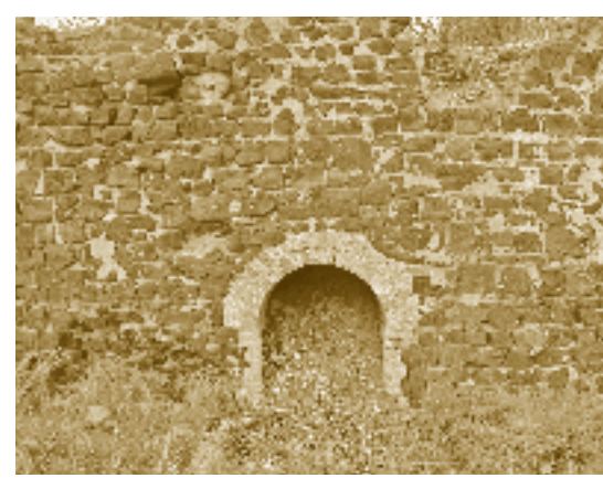
Wallaroo Smelters Site, Wallaroo.