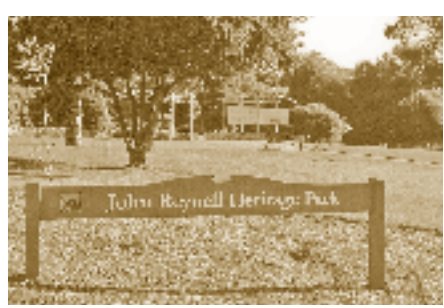
John Reynell Heritage Park