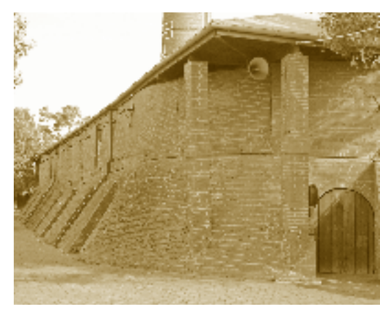
Former Hoffman Brick Kiln, Brickworks Market (former Hallett Brickworks), South Road, Torrensville