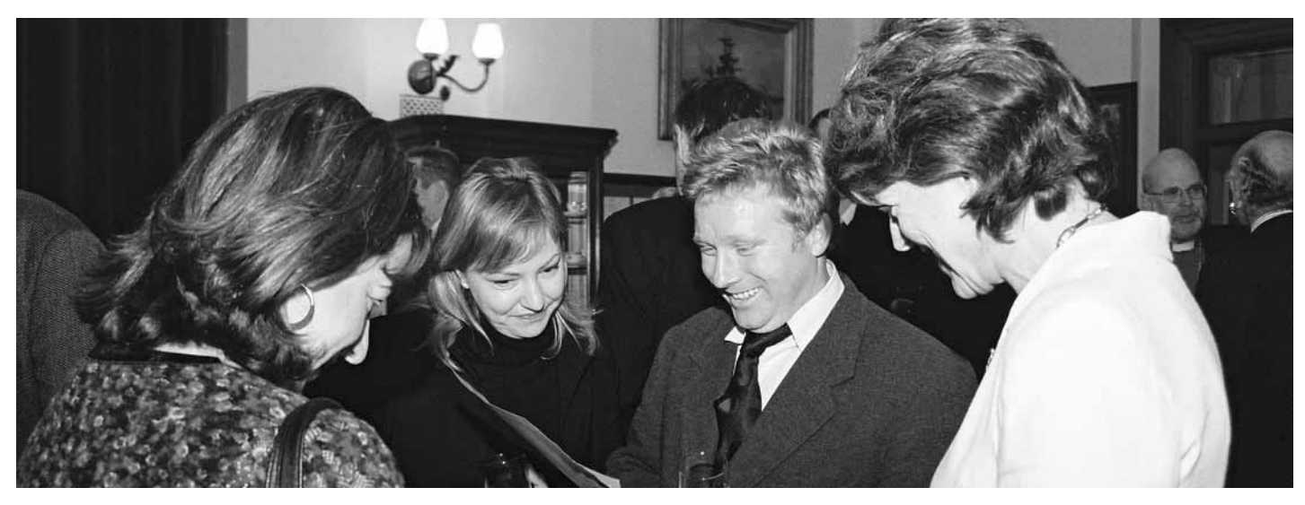
Guests and nominees at the 2004 Edmund Wright Heritage awards

For further information on the winners and commendations, please refer to the Edmund Wright Heritage Awards website at http://www.environment.sa.gov.au/heritage /awards/index.html.