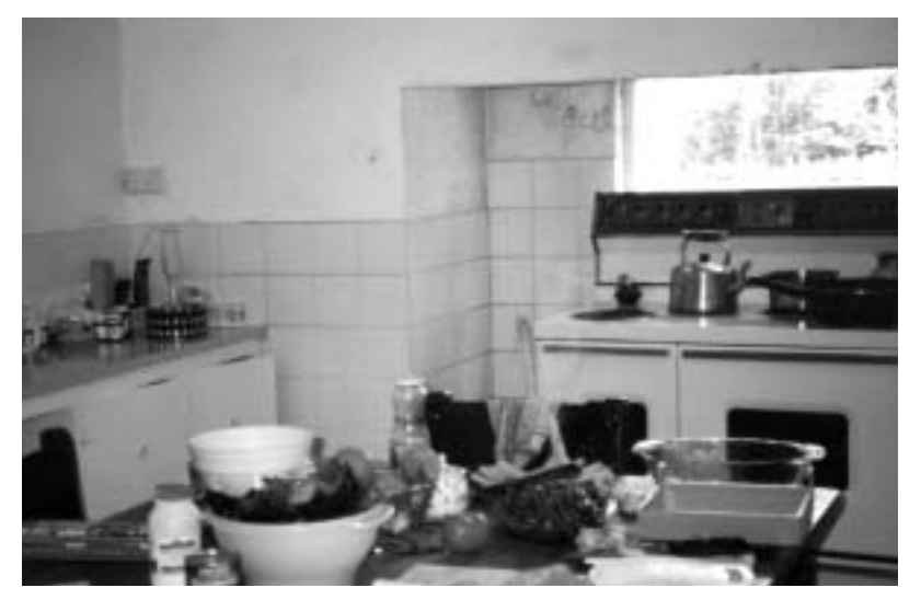
above: Kitchen before restoration

One major challenge they faced was rising damp in the stone walls, and dampness and cold throughout the house. Solutions for the causes of this damp had to be found, rather than a treatment for the symptoms.