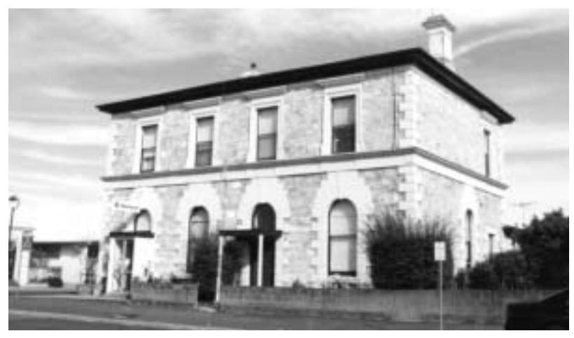
National Bank, Penola