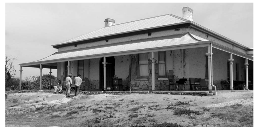
Cantara Homestead, Coorong National Park

A number of lighthouses (including cottages, supply routes and cemetery);