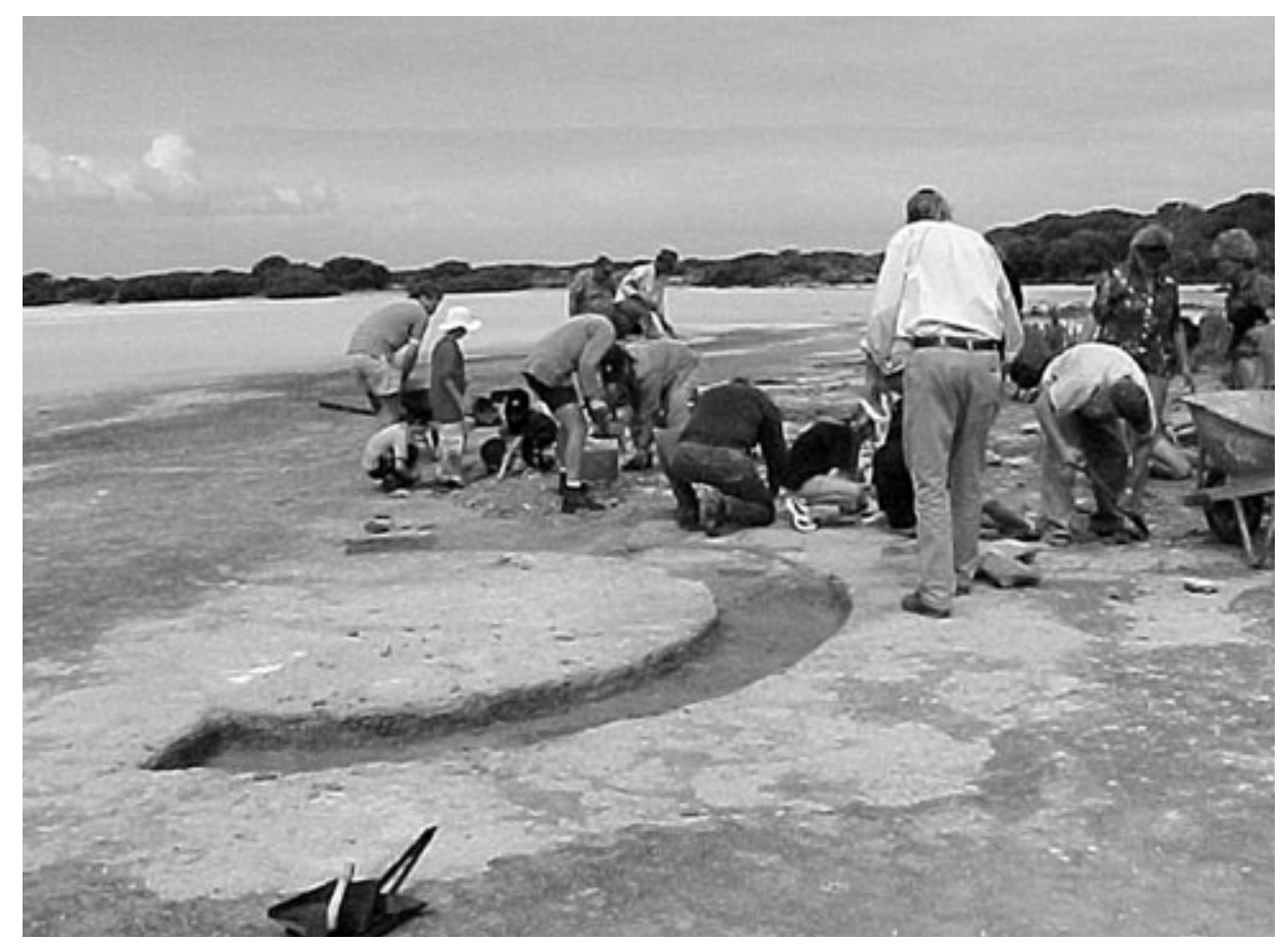
Volunteers cleaning out the quarries at Chinamans Well.