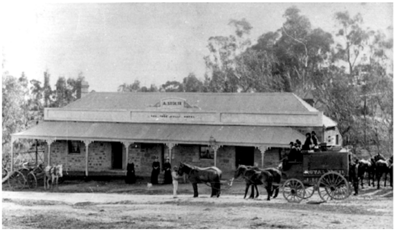
The arrival of the Royal Mail horse team outside of the Tea Tree Gully hotel. The hotel was built in 1854 and was the first hotel and one of the earliest buildings in Steventon. This building was recently listed in the Register of Local Heritage Places.