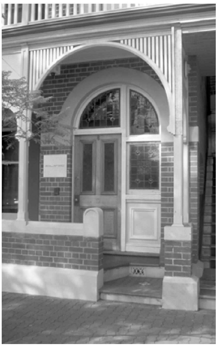
Federation doorway, Kent Town The asymmetrical setting of the door in the opening, and the use of ornate timber rather than cast iron are features of Federation construction.

The East End of the city is a good place to view some of Adelaide's most distinctive buildings of the Federation period, including the Stag Hotel, the market frontages, Tandanya (which was a power station run by the Adelaide Electric Supply Co), and the former Producers Hotel in