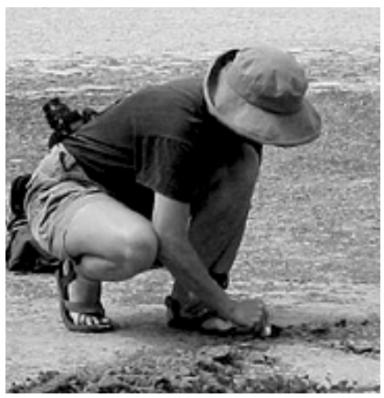
Marking the edges