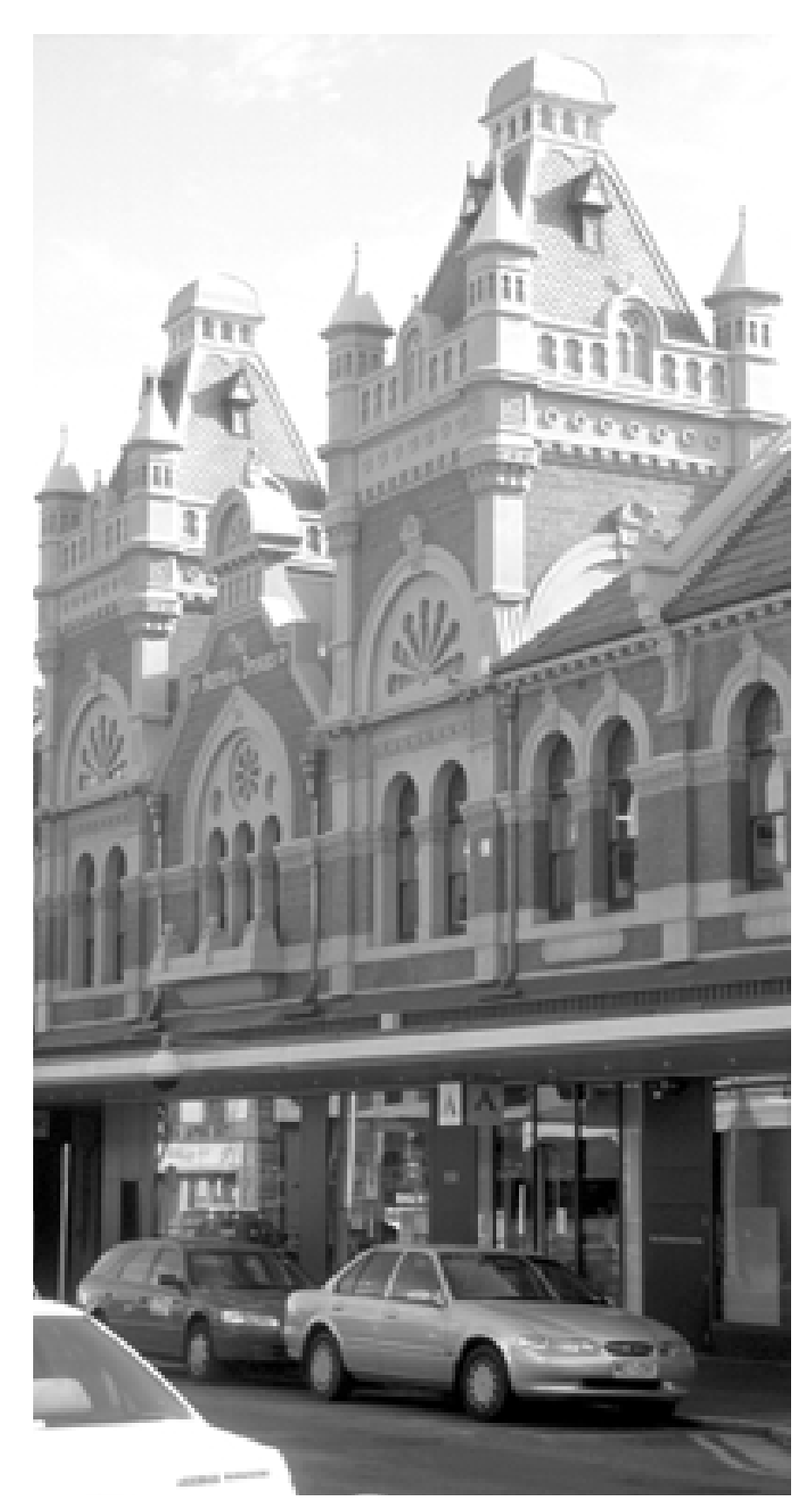
Wests Coffee Palace

The buildings of the Victorian period were regular in elevation and plan. The new designs were much freer and more 'picturesque'. The period also saw a distinct change in the use of materials and detailing as well as form. The buildings of the Federation period are most particularly identifiable by elements such as terracotta roof tiles rather than slate or corrugated iron, face red brick walls with bands of render not stone, timber fretwork rather than cast iron verandah details, gables and half gables with timber strapping, tall brick chimneys and often corner towers or turrets creating a complicated rather than regular roof line.