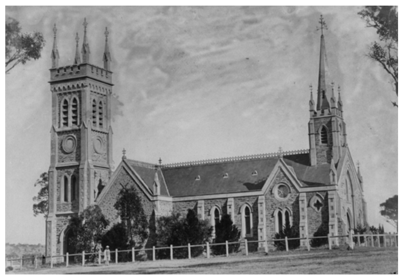
St Andrews Church, Strathalbyn c.1880. The spirelets on the left were damaged in 1956 during a winter storm.

Computer aided design was used to carry out a detailed analysis of the frame for all stages of the lifting sequence and the final erected condition. For the main lift, tie rods were fixed across each face between the corner posts to limit spread of the frame. These rods were detailed to enable them to be later removed, after the spirelets were in place on the tower. Four corner lift points near the bottom of the frame were positioned to allow easy access for derigging from within the bell tower once erected. In its final position, the main frame is concealed behind the parapet walls of the bell tower.