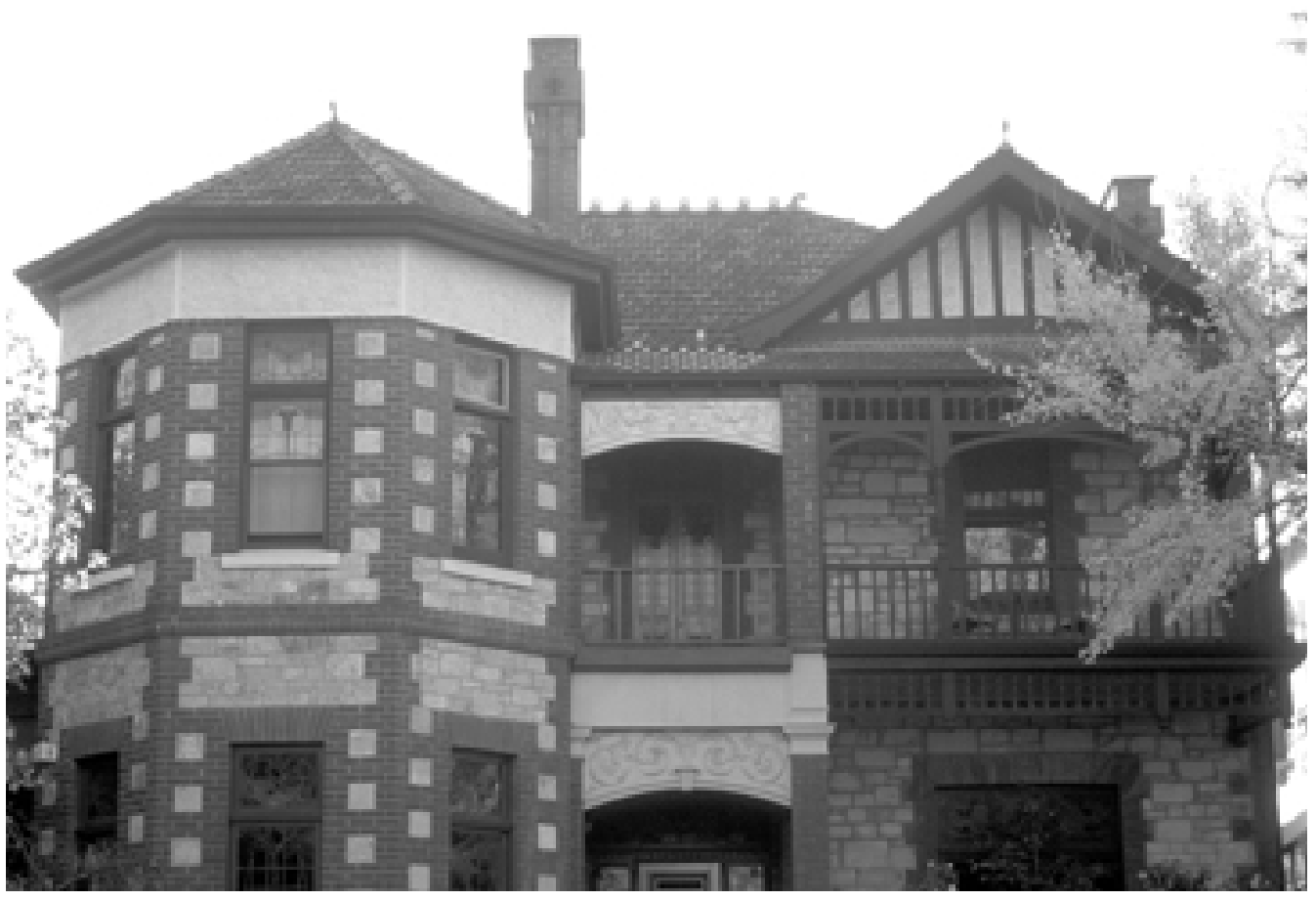
Taylor House, North Adelaide The irregular roofline of this house, red brick feature walls, terracotta roof and timber fretwork characterise the Federation period.

houses, though more modest in size than the North Adelaide mansions, still displayed the terracotta tiles, gabled roofs and timber fretwork around the verandahs which the grander houses had. Many of the architects working in Adelaide at the turn of the century are included in the Cyclopedia of South Australia which was published in 1909.