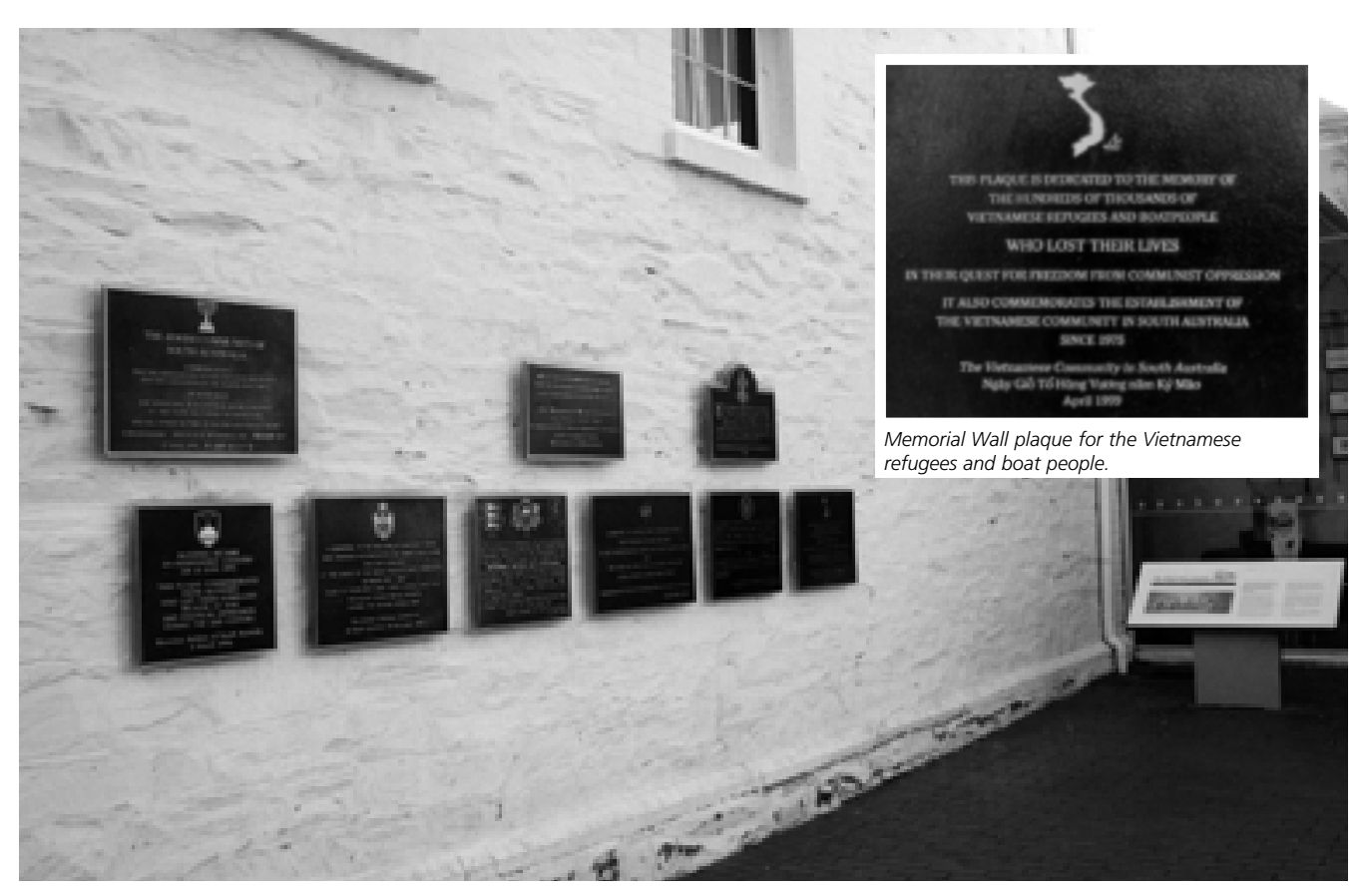
The Memorial Wall, Migration Museum