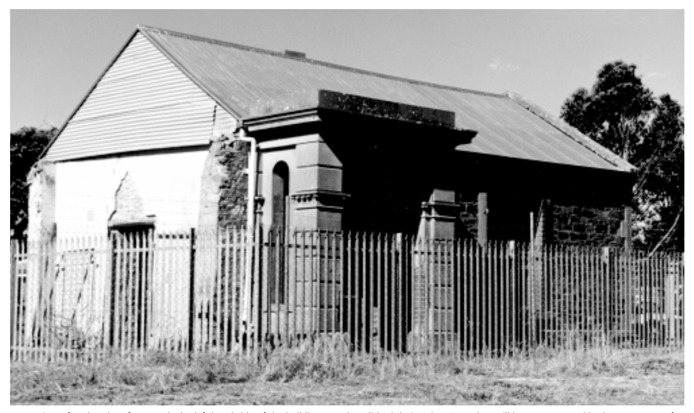
Front view of Lochend, unfortunately the left hand side of the building was demolished during the 1970s, but will be reconstructed in the next stage of redevelopment. The roof covering has been replaced with new galvanised iron.

The project involves the conservation and restoration of a heritage building, and its development into a cultural facility. Stage One of the Lochend Project, which involved the stabilisation of the existing structure is complete. It followed guidelines laid down with the detailed recommendations of the Conservation, Management and Development Plan