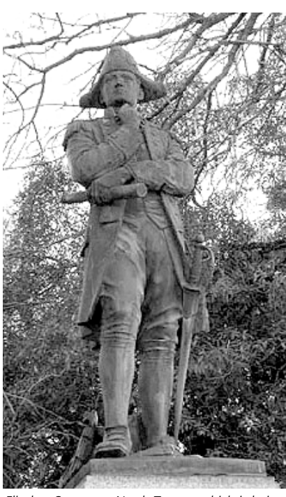
Flinders Statue on North Terrace which is being recommended for heritage listing.

There could be other significant sites, not already entered in the State Heritage Register, and therefore Heritage SA would appreciate any advice as to other places that could be assessed for entry in the Register.