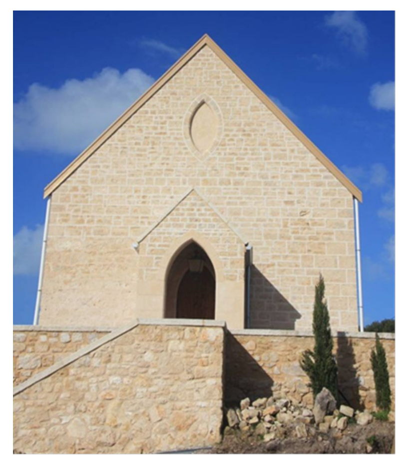
Image: Former Robe Bible Christian Chapel, 6 August 2013, showing north elevation with porch and reinstated blind gable opening.

This place was nominated by a member of the public on behalf of the Robe Branch of the National Trust of South Australia. The nominator believed the Chapel met criteria (a), (c), (f) and (g) of s16 of the Heritage Places Act 1993 for listing as a State Heritage Place, in the South Australian Heritage Register.