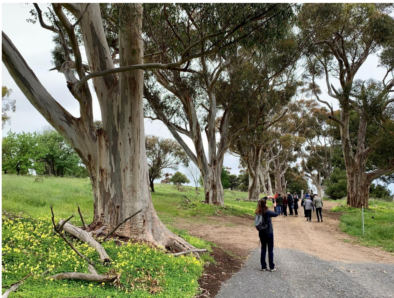
Image: Glenthorne National Park.