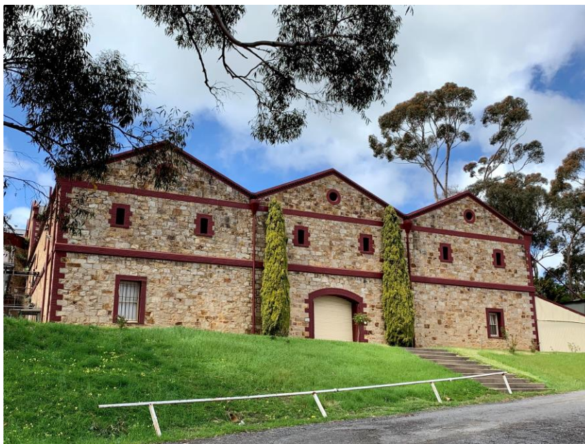
Image above: Horndale Winery. Image below: the winery in 1910.

Source of historic information: Wines and Wineries of the Southern Vales by Rosemary Burden.