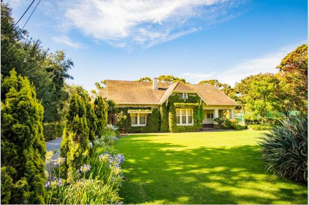
Driveway and front of house 2020 CBRE