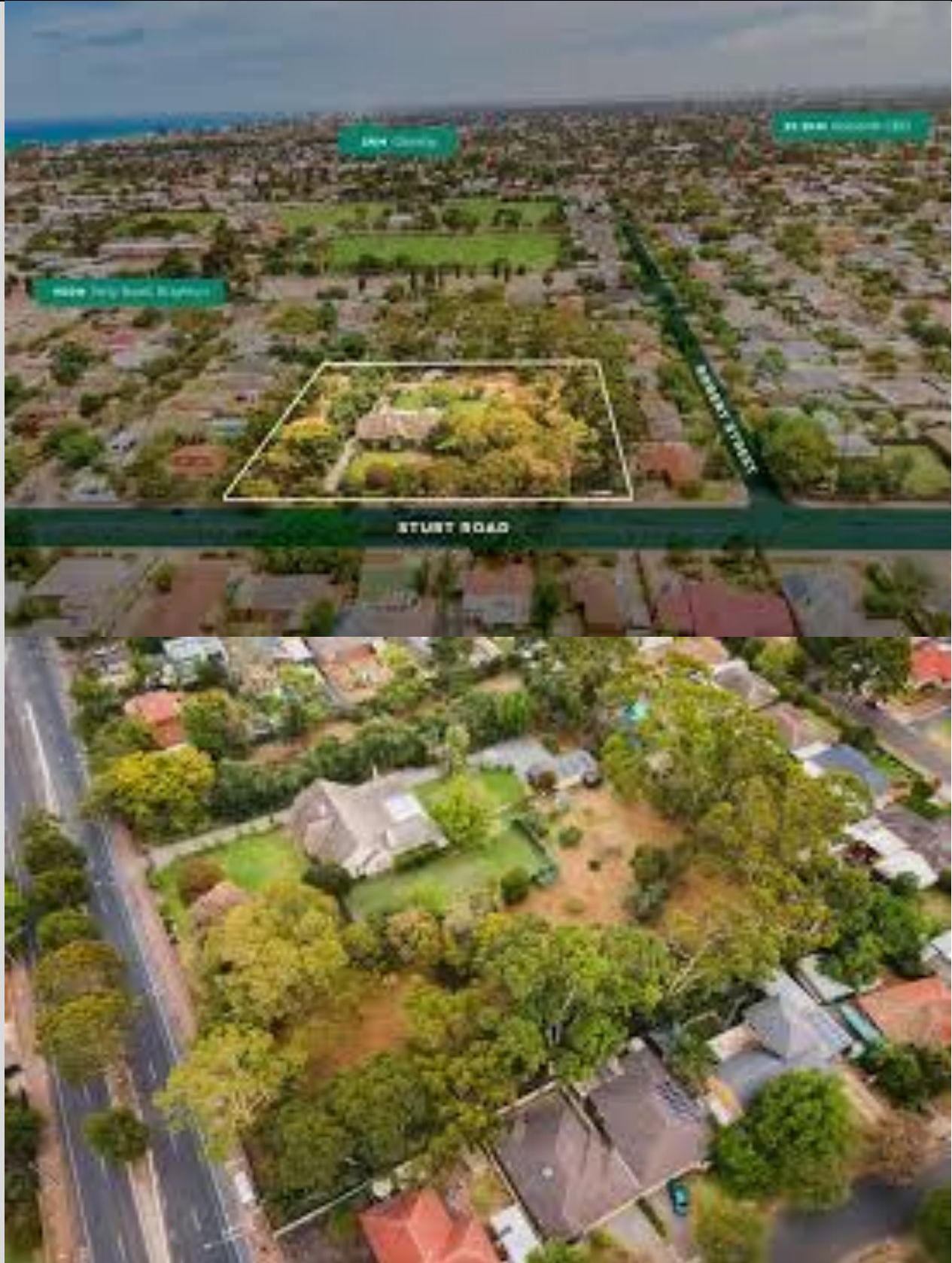
Aerial Views from S & SE