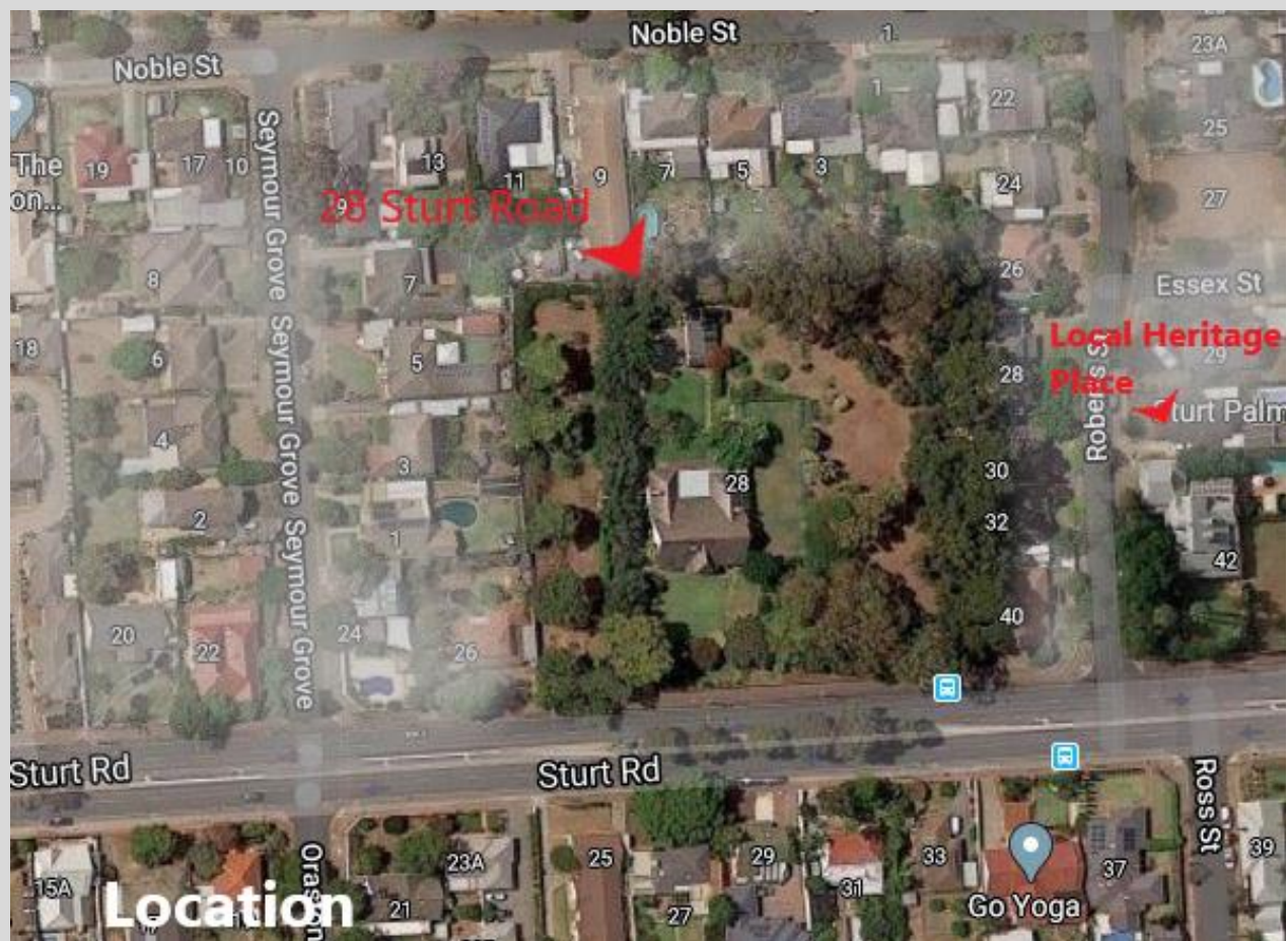
Site Location – Google maps