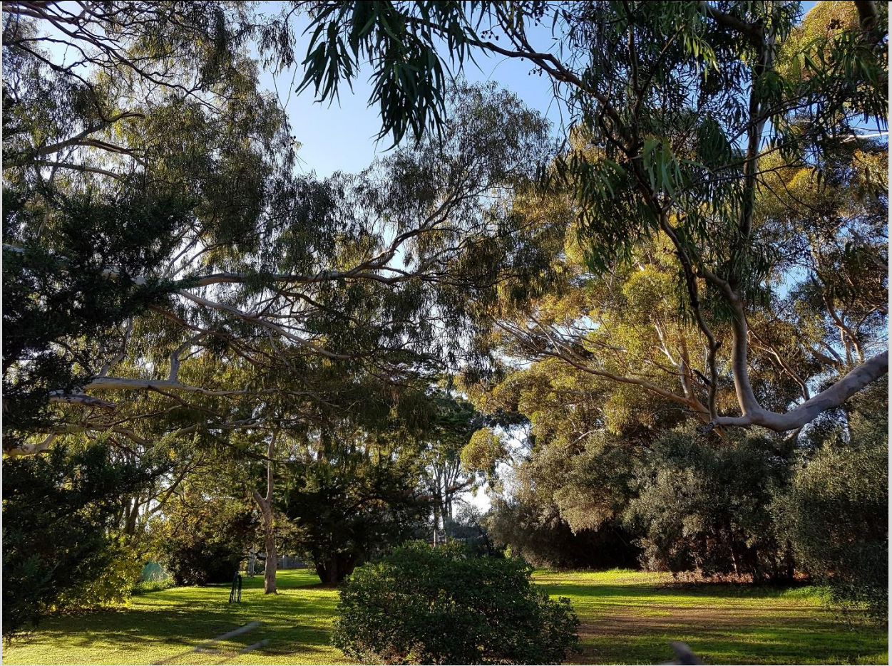
Garden View to right of house from Sturt Road 2020 applicant

The South Australian Heritage Council is committed to transparency in relation to the listing process and wishes to enhance public confidence in the nomination, listing and decision-making process. The Council's policy is to make nominations for State heritage listing and submissions on provisional entries publicly available via webpage or to interested parties. The Council will adhere to the Privacy Principles and your name and personal details will not be released.