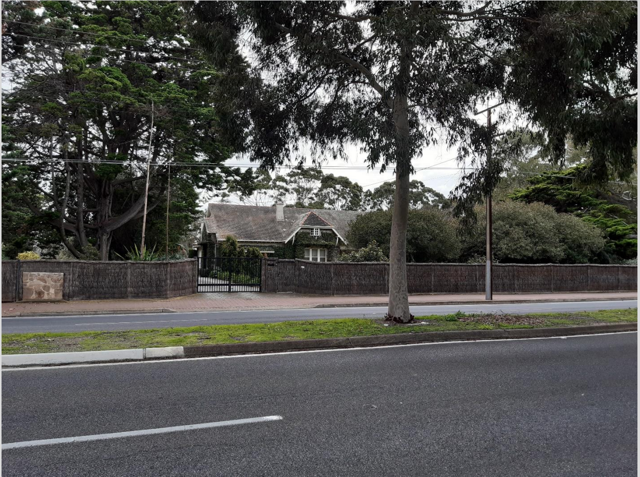
Sturt Road Frontage – main entry July 2020 applicant