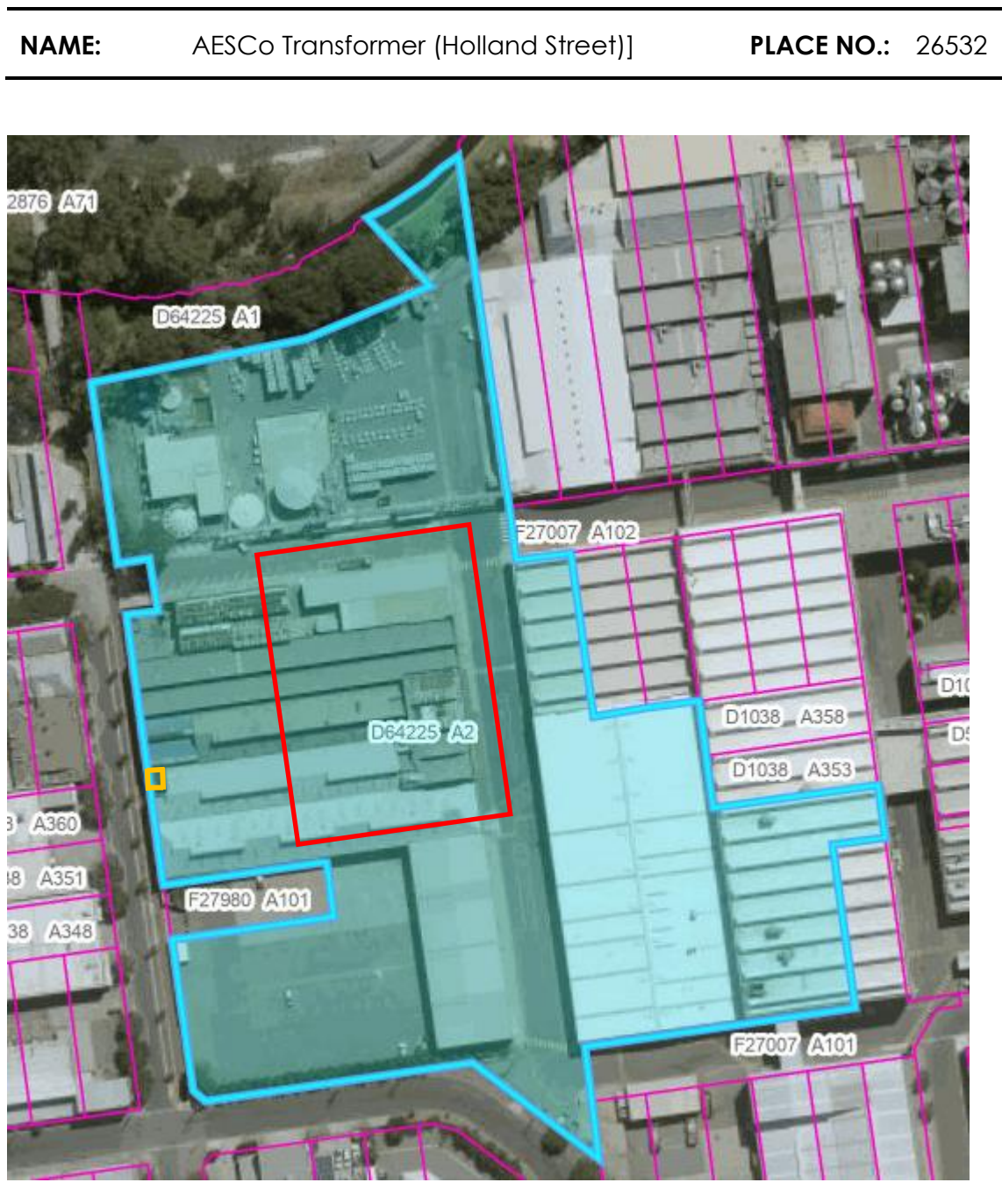
AESCo Transformer (Holland Street) 107 Port Road, Thebarton, CT 5941/298 D64225 A2, Hundred of Adelaide