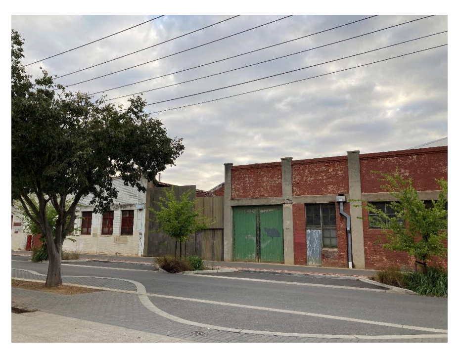
AESCo Transformer is located behind the section of corrugated iron fencing

NAME:AESCo Tranformer (Holland Street)PLACE NO.:26532