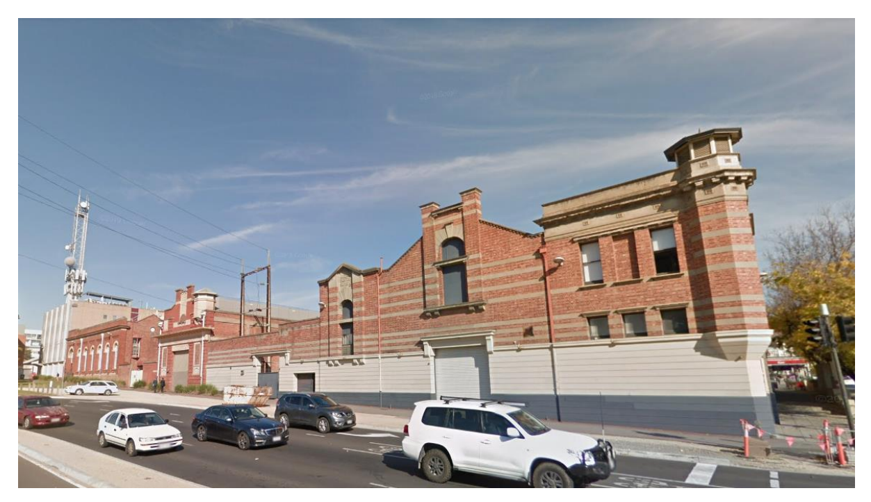
View of East Terrace showing Tandanya (former Adelaide Electric Supply Company Power Station) (SHP 10984) (right), Former Adelaide Electric Supply Company Converter Station (SHP 10985) (mid) and Former Municipal Tramways Trust (MTT) No.1 Converter Station (SHP 10986) (left).