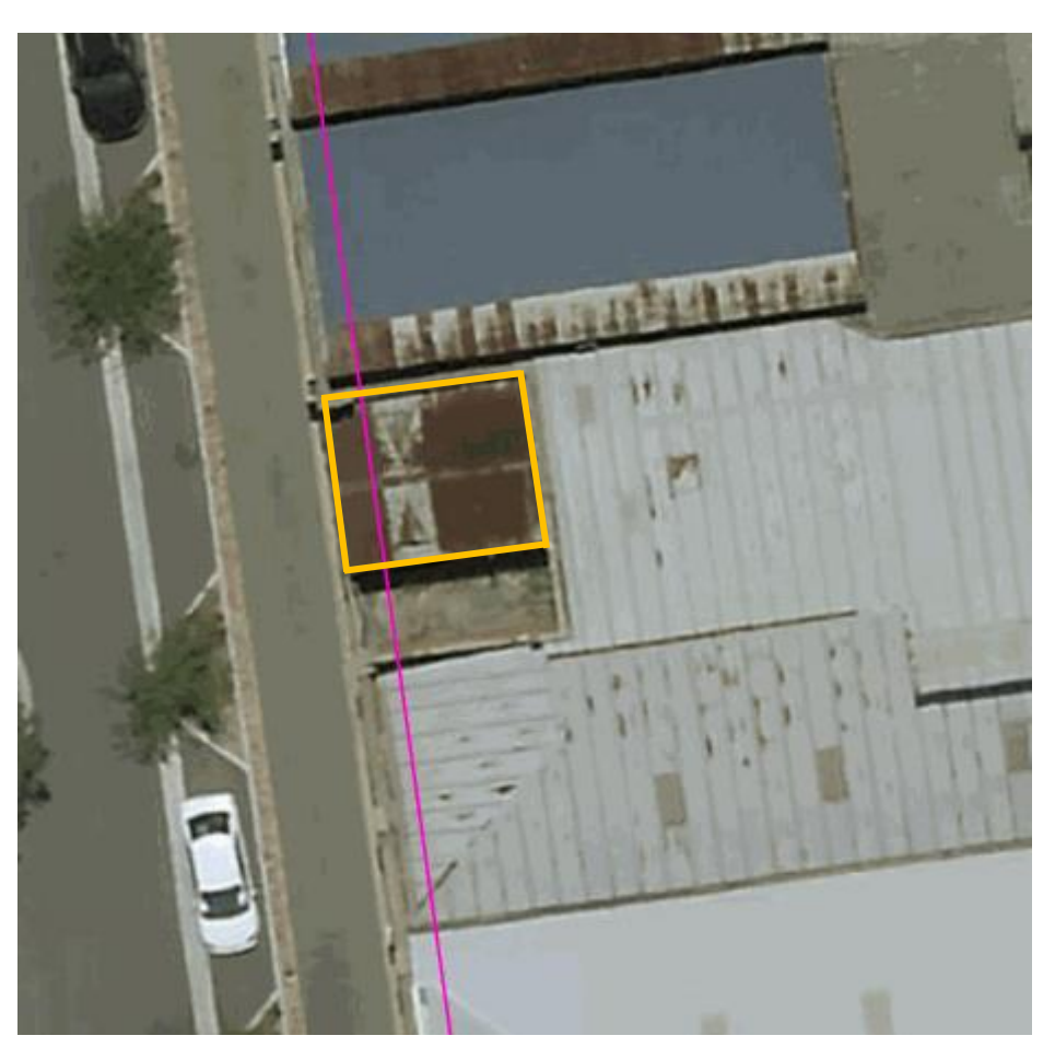
AESCo Transformer (Holland Street) 107 Port Road, Thebarton, CT 5941/298 D64225 A2, Hundred of Adelaide (detail of location).

NAME:AESCo Transformer (Holland Street)]PLACE NO.: 26532