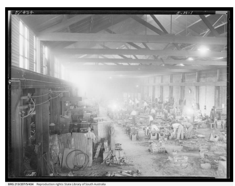
Inside the Mason Cox Foundry Southwark, c.1941, note the casting taking place directly on the sand/dirt floor.