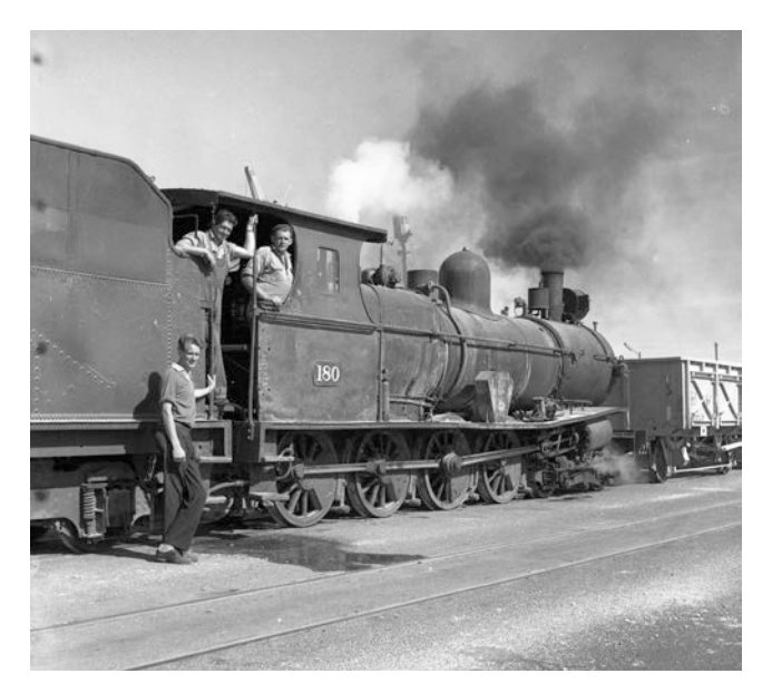
Photo 1: Andy Wyschnja on a Z class loco shunting Port Lincoln yard, 1951.

Photo 2: Wally Woldt, Walter Krug and Andy Wyschnja on locomotive T216 in the loco depot at Port Lincoln in the 1950s.