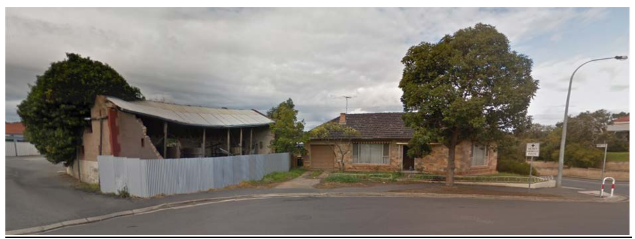
Photo: Street view from Light Square of Barn and dwelling. Google 2017

The new Heritage Agreement will allow the owner to demolish a house on site (not heritage), rebuild the Barn to the satisfaction of Heritage South Australia architects, and build a new medical centre on site.