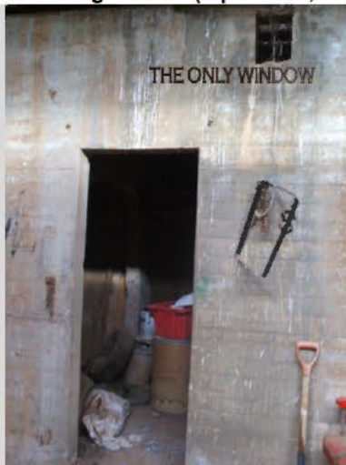
Back portion of the building showing the cells and central drain.

Paste images here: (if possible, i will take more photos Easter Saturday and email them to you)