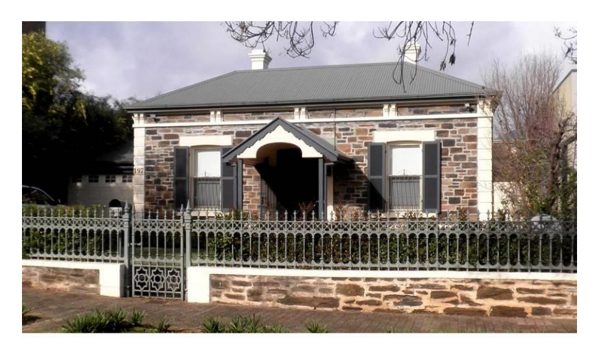
197 Childers Street home closer up (photographer and date unknown)