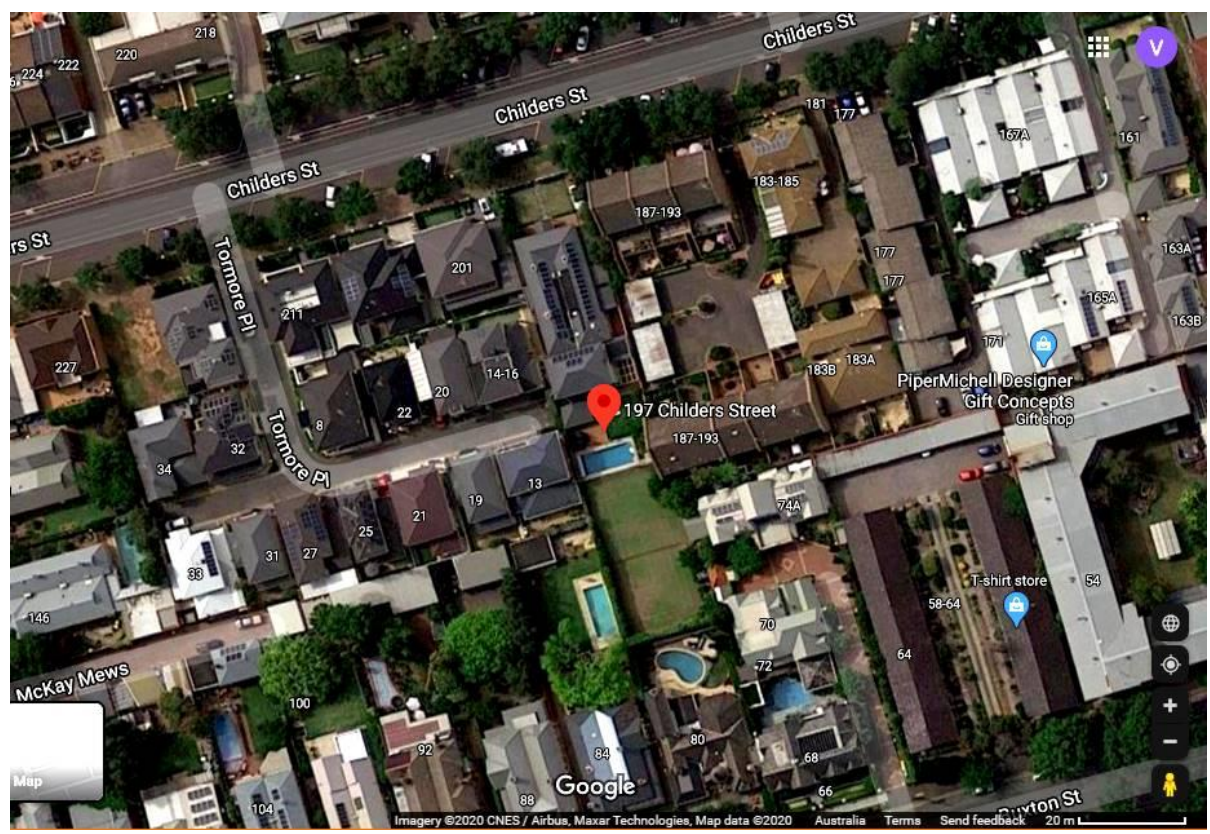
Aerial View of Property (Google Maps current image at time of this application)