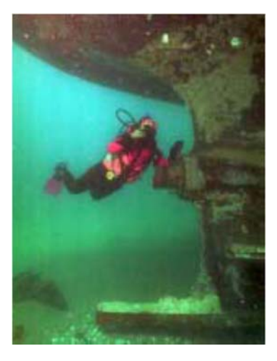
Diving the H.A. Lumb

On 9 December 1994 the H.A. Lumb was towed by the tug Mudgee to a site in St Vincent Gulf, approximately 2 kilometres off O'Sullivan Beach, where it was scuttled in 20 metres of water adjacent to (and approximately 30 metres from) the Port Noarlunga tyre reef.