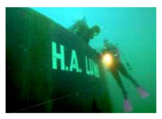
Diving the H.A. Lumb

The steel tug H.A. Lumb was built in 1943 by the Decatur Iron and Steel Company, Alabama, USA and registered to the US Navy. The vessel measured 78.1 feet (23.8m) in length, 23.8 feet (7.3m) breadth, 8.8 feet (2.7m) depth and was 153 gross tons. In 1956 the H.A. Lumb was acquired by the Geelong Harbour Trust Commissioners and registered in that port, but was later sold and converted to a deep-sea trawler based in Port Lincoln and operating in the Southern Ocean.