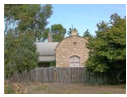
Rear view, March 2005

Architecturally the limestone dwelling is of an unusual T-shaped design, with a curved, self-supporting, corrugated iron roof.