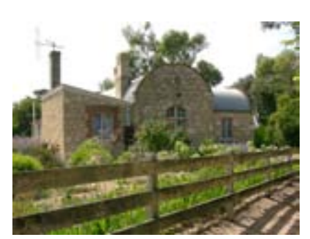
Side view and garden, March 2005