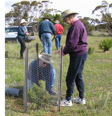
Trying out tree guard ideas