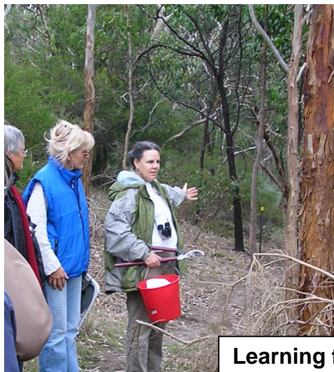
Learning from each other's experiences