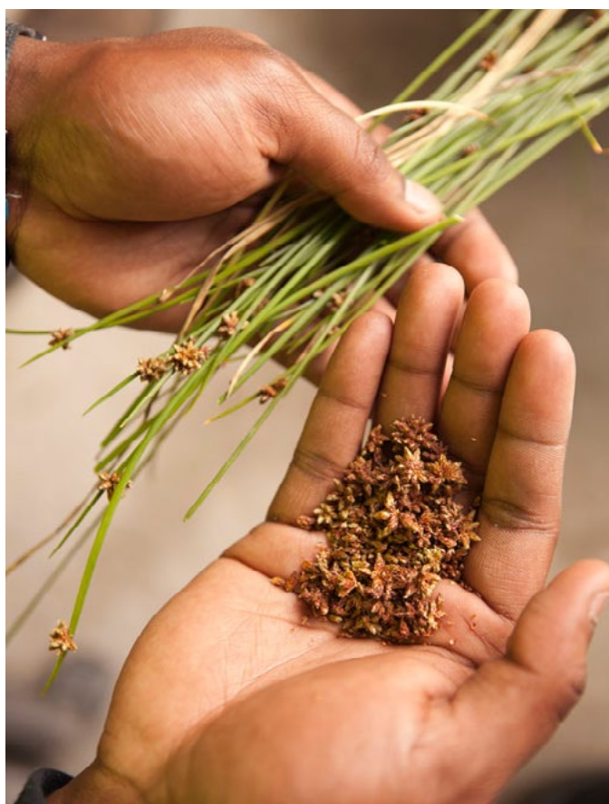
Ficinia nodosa seed harvest ©2012