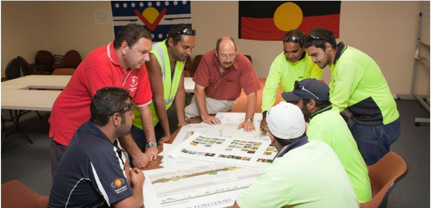
Ngarrindjeri Ruwe contracting staff review Lakefront Habitat restoration project plans

The Ngarrindjeri Partnerships Project aims to support the active, long-term participation of Ngarrindjeri people, the traditional owners of the Coorong, Lower Lakes and Murray Mouth area, in the management of the region's natural resources and cultural heritage.