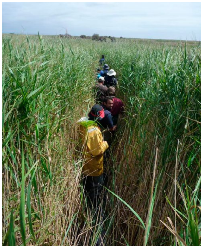
Joint DEWNR and NRA revegetation assessment © 2012