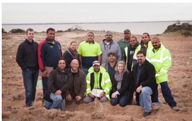
Ngarrindjeri graduation ceremony Warrangie Farm

The Ngarrindjeri Partnerships Project supports Ngarrindjeri engagement in on-ground activities for the CLLMM Recovery Project, including heritage assessments, ecological monitoring, reed translocation for the Meningie Wetland Project, and sediment collection for the Ruppia Translocation project.