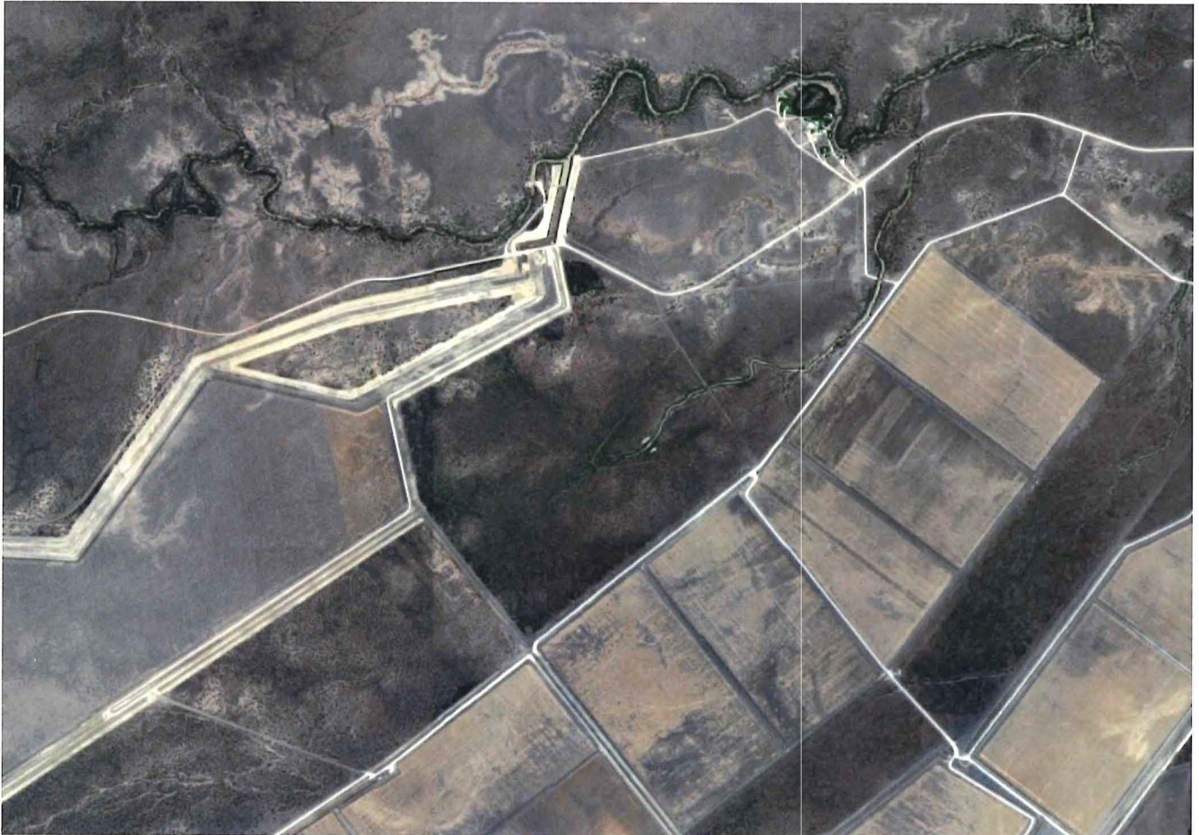
Cubbie Station Wier at Dirrinbandi

Only when in major flood events does any water flow down past these weirs.