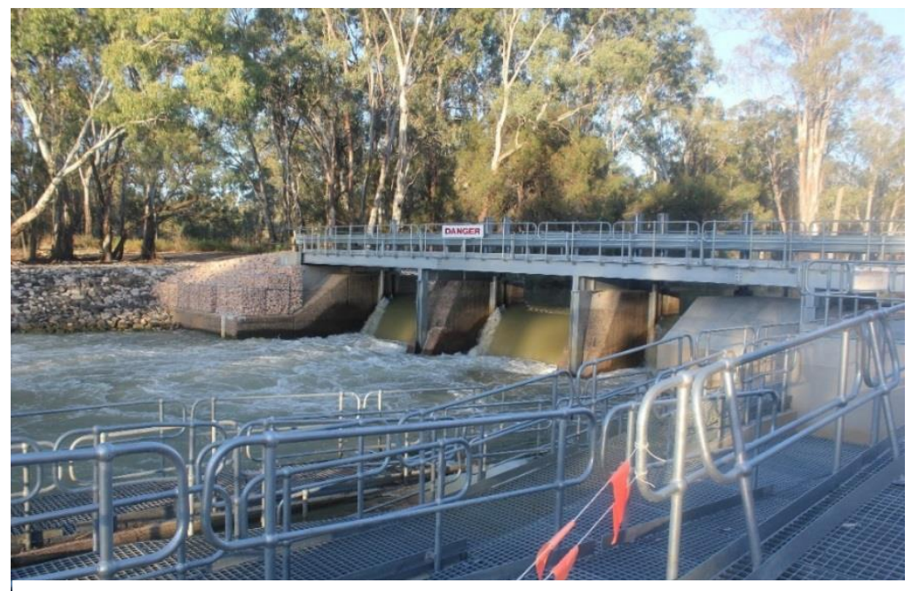
Pipeclay weir in operation during the event

Work is continuing to refine the management of flows through the upgraded Pipeclay and Slaney weirs in conjunction with achieving optimal operation of the new fishways.