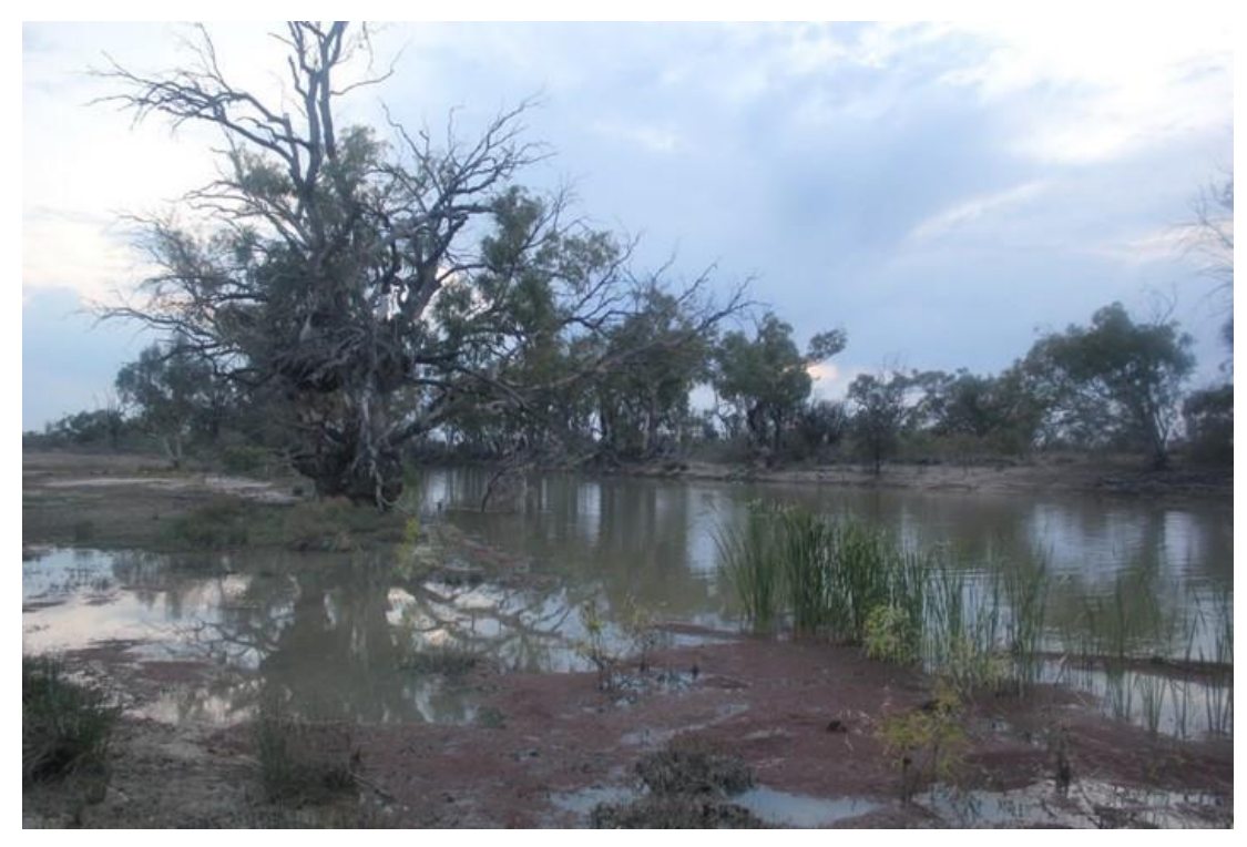
Raised water levels in Punkah Creek during operation

The watering event provided freshening along the anabranch channels and connected some of the lower lying floodrunners providing benefits to near bank trees and understorey vegetation.