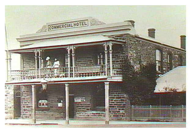
Commercial Hotel, Burra 1890

Architecturally, this building is interesting as a small, refined hotel in a large country town. While its width is comparatively narrow, the two-storey height and the decorative features create a distinctive building. Following the hotel's opening, the Northern Mail (8 September 1876) provided a detailed description of its layout and features: