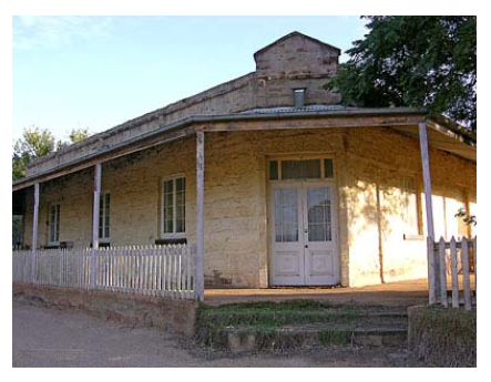
Former Smelts Hotel, 1994

Market Street, Burra SAHR 10419 - confirmed as a State Heritage Place 8 November 1984