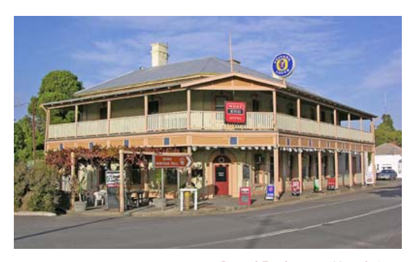
Royal Exchange Hotel, 2005

Historically, the Royal Exchange Hotel played a significant role in Burra's adjustment to a trade and supply centre, following the closure of the mine in 1877. This large, relatively ornate Victorian hotel, on a corner allotment, was built in 1880 and incorporates an earlier bank building. The Royal Exchange seems to have taken over the trade of the Aberdeen Hotel, which was situated further south on the allotment and had burnt in 1878. This included a regular transport service between the hotel and the railway terminus.