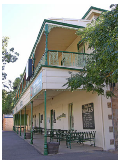
Burra Hotel, 2005