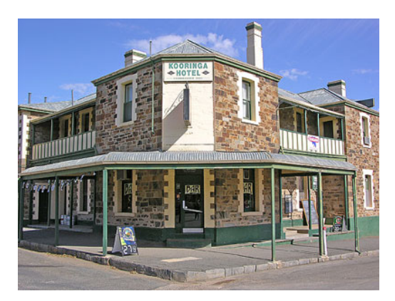
Kooringa Hotel, 2005

SAHR 10410 - confirmed as a State Heritage Place 8 November 1984