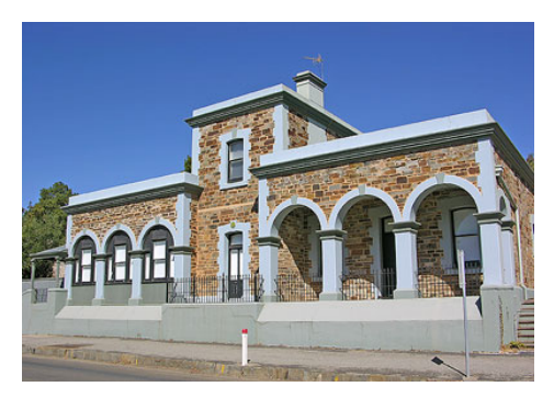
Former Burra Post Office

In 1862 <u>John McDouall Stuart</u> sent a message from this telegraph station to the Governor of South Australia, informing him of his successful crossing of the continent.