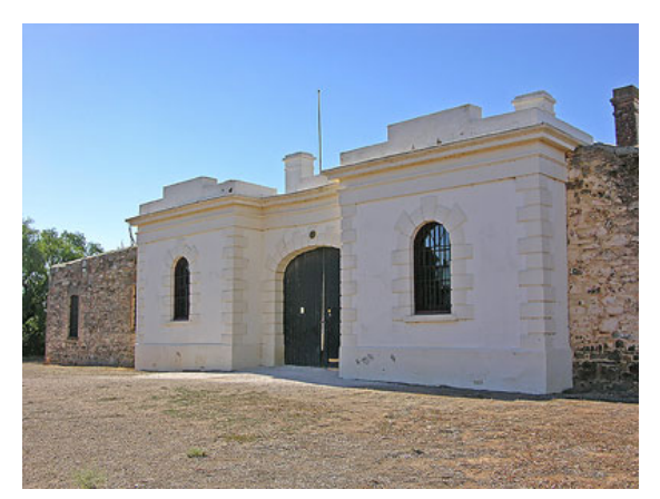
Former Redruth Gaol, 2005

The Redruth Gaol, erected in 1856 at a cost of £3,200, was South Australia's first country gaol.