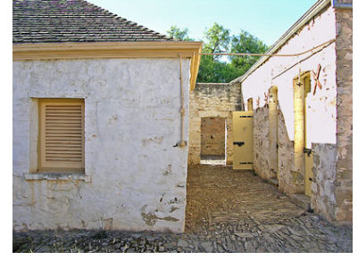
Stables & cell block, 2005

In 1872-73 new cells, stables and a stable-yard were added to the existing police station. These still stand on the site. The original stable was converted into a forage store, and this is also still onsite.