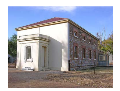
Former Redruth Courthouse, 2005

The building was designed by the Colonial Architect, E.A. Hamilton, and was completed at a cost of £800. In 1864 the original, single-storey courthouse was enlarged, the roof raised in the process and a new clerk's