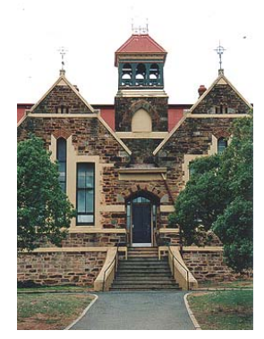
Front entrance, 2005

The school was intended for 800-1000 students, but when it opened in January 1878 only 300 had enrolled. Many rooms remained unoccupied until the high school opened in the western wing in 1913.