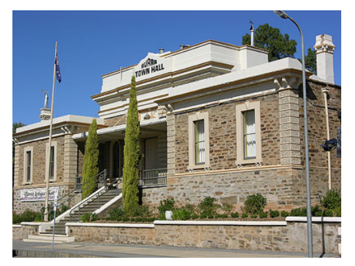
Burra Town Hall, 2005