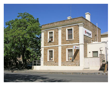
National Bank, 2005