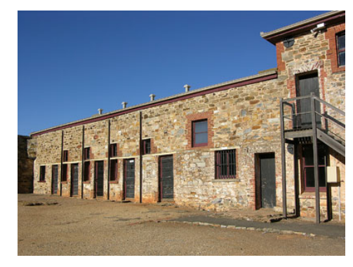
Cell Block, 2005

The National Trust now maintains the building. In 1979 Breaker Morant was filmed in and around Burra, with the Redruth Gaol one of the major locations.