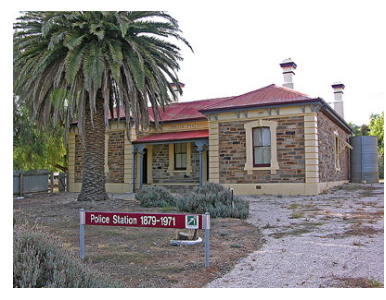
Former Redruth Police Station, 2005