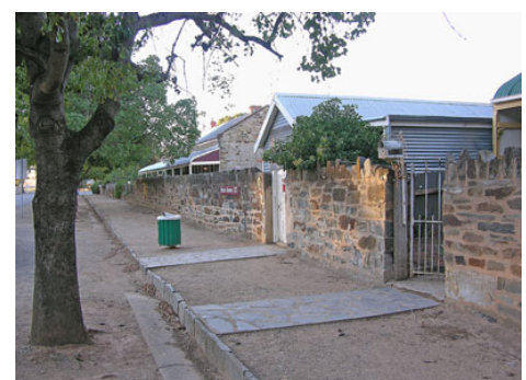
Brewery wall and entrance, 2005

A Commonwealth Act that came into force on 1 January 1902, stated that " No person shall make beer unless licensed to do so. " The new regulations were so stringent, and the required paperwork so involved, that only the larger breweries could afford to comply.