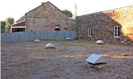
Cellar vents and school residence, 2005

The sale of the brewery buildings and machinery proved difficult, and for many years the complex remained deserted.