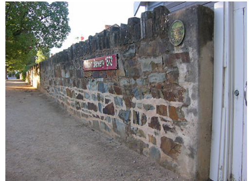
Entrance to Unicorn Brewery, 2005

In 1873 the erection of a new brewery in Burra probably seemed a risky venture. Although the Burra Mine was still working, the number of miners employed there had dropped from 1 000 in the early 1860s to less than 300, and the town's population had fallen to 3 000, with more mining families leaving each week. There were still nine hotels open in the townships, but these were supplied by another, long-established brewery in Burra.