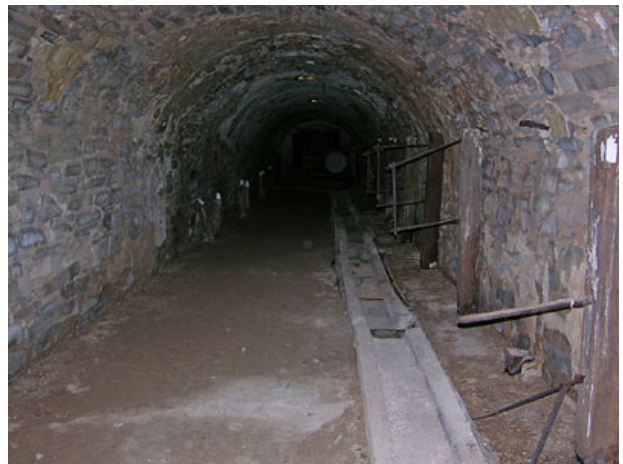
Underground tunnel, 2005

Massive timber beams support the flooring of the storeroom at ground level.