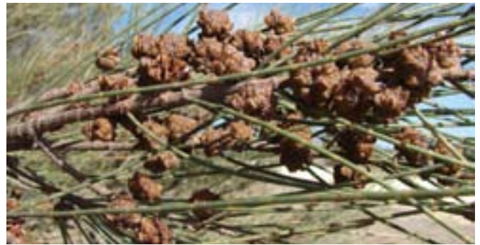
Buloke woody cones