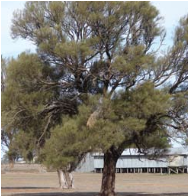
Mature Buloke paddock tree