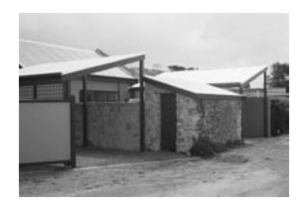
The simple skillion roofs of these new carports complements the original stone outbuilding. Little Scotland, Goolwa.