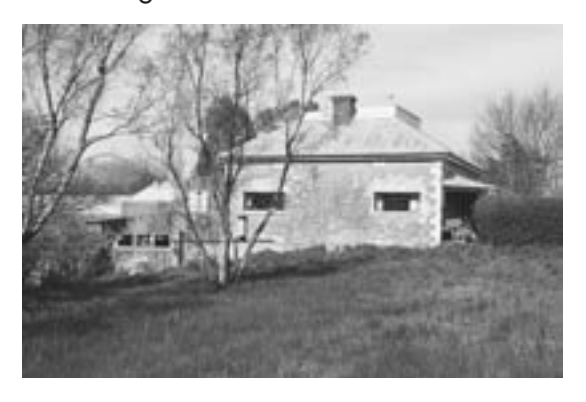
The character of this cottage has been compromised by an unsympathetic roof extension and by new windows that are horizontal rather than vertical in proportion.

Extensions into the roof space should not alter the visible roof form. For example, the addition of dormers where none previously existed dramatically alters the character of a building.