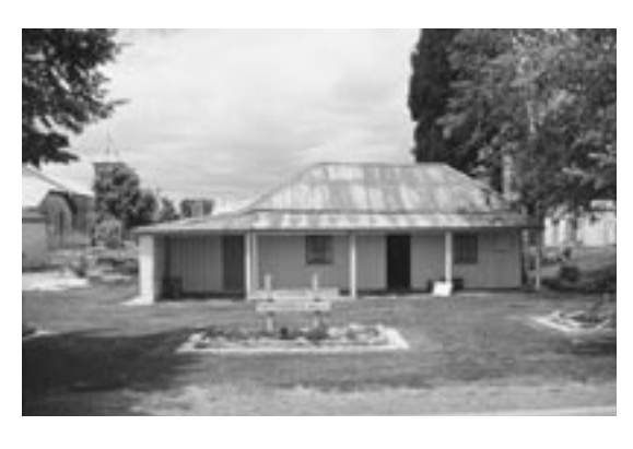
Ulva Cottage in Penola awaits the reconstruction of its fence and cottage garden to complete its restoration.

New fences can be designed to complement the scale and character of the existing buildings.