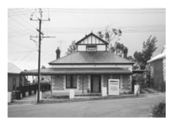
Extending this verandah to form a carport has spoilt the symmetry of this cottage.

If a new carport must be attached to an existing building, simple lean-to roofs rather than bullnose or concave roofs often fit in better. Flat roofs and metal roller doors are usually not in character and are best avoided.