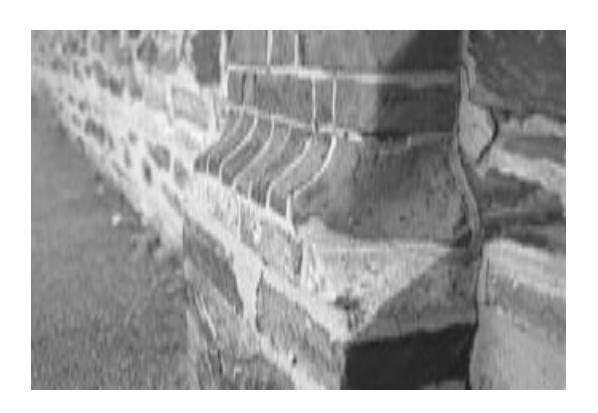
These bricks at the former Grote Street Model School, Adelaide, record the wear of many boys' hobnail boots.

It is rare to find a building that has not been modified to some degree over time to better accommodate the occupant's requirements. Often these modifications assume an importance in themselves and demonstrate the growth and history of the place. Before removing previous work it is important to consider its contribution to the history of the place.