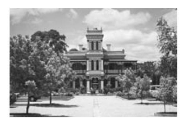
New car parking at Eynesbury College complements the formal character of the building.

Gravel or brick paving, flush edge strips, and shade trees using traditional plants can be used to create an informal and sympathetic car park. Fences and hedges can be used to screen parked cars from view.