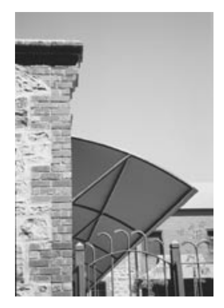
A cleanly detailed cantilever canopy contrasts with the texture and patina of the masonry wall. Frome Street Stables, Adelaide