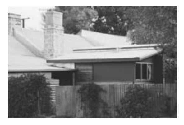
House addition using the existing lean-to as a link.

Where a lean-to or main roof extension cannot accommodate the floor area required, a better solution may be to build a new, linked structure. This may follow the general form of the original but avoid exact replication. A sympathetic addition can be designed that maintains the general form, scale and roof pitch of the original.