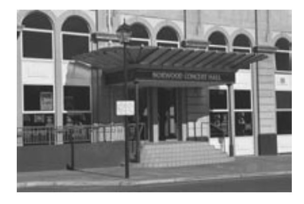
This distinctive new entrance to the Norwood Town Hall has improved access and fire egress. Along with conservation work and new services, this has made an under-utilised hall into a viable, modern concert venue.

To accommodate new uses and to meet contemporary needs it is often necessary to alter, adapt or add to buildings. Heritage buildings can be changed provided the elements that give the building its heritage value are not destroyed or compromised in the process.