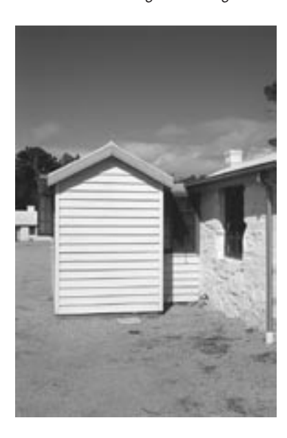
New bathrooms to the rear of the Paxton Square cottages in Burra are separated from the lean-to by a recessed link.