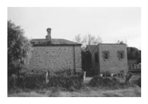
These additions to a stone cottage in Goolwa follow traditional practice and forms but are clearly contemporary.

There is clearly a need to understand why a