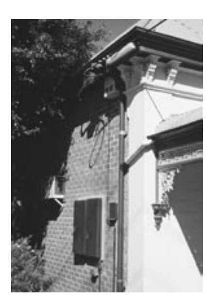
Services dominate this corner which faces the side road and main approach to the house.

External pad mounted transformers, hydrants and fire boosters can also be intrusive and difficult to screen, especially when placed close to street boundaries.