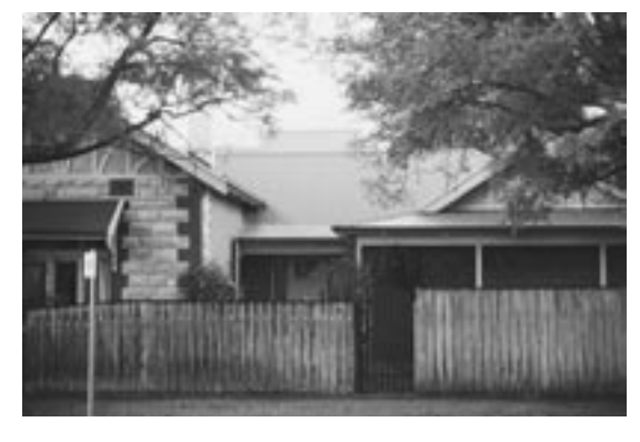
Hipped and gabled extensions of the main roof form.

When adding to an existing gable, the new roof can be joined under the existing barge boards and the walls set in slightly to maintain a clear distinction between new and old.