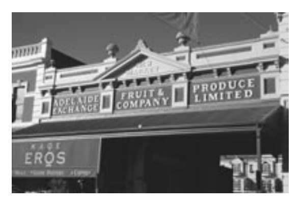
Parapet walls can be used to conceal low pitched roofs. Former East End Market, Rundle Street, Adelaide

However, the appearance of seemingly flat roofs does not sit comfortably with traditional pitched roof forms, and these roofs, where unavoidable, are best concealed behind parapet walls.