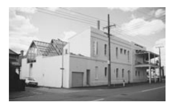
Additions at the rear of the Astor Hotel provide a contemporary space that complements but does not intrude.

mass and scale are important elements to be considered. Take particular care at ground level to ensure that the new facade is detailed and scaled to maintain the pedestrian amenity of the street.