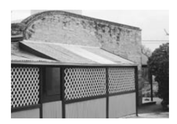
Corrugated polycarbonate roofing provides an unobtrusive skylight.

Locate new skylights to minimise their visibility. Where skylights are used, flush glazed lights or translucent corrugated sheeting are less intrusive than an acrylic dome.