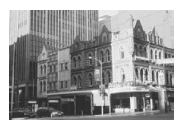
Unsympathetic "improvements" have concealed but not destroyed the original facades of the Beehive Corner, Adelaide. These changes should not have occurred in the first place – they are at least reversible.

Where possible, incorporate change in a way that is reversible, as this leaves open the possibility of future restoration to the original condition.