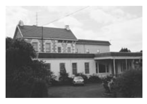
Ad hoc additions and unsympathetic reroofing have largely concealed this house constructed of dolomite.

The purpose of these guidelines is to promote a better understanding of the design issues and possibilities presented by heritage buildings. Many heritage buildings in the past have been compromised by ad hoc and ill-considered alterations and additions. The guidelines aim to assist owners, architects and designers plan and design alterations or additions that will complement rather than compromise the heritage value of their buildings.