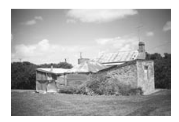
The various stone additions to this hipped roof, timber framed cottage in Robe provide clear evidence of the changing needs and aspirations of past owners.

Alterations and additions made to suit contemporary uses become part of the history of the building over time, and provide evidence of our social and cultural values to future generations.