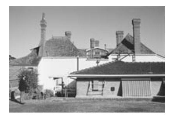
The slate roof and original chimneys of Waite House are inherent design features. The caretaker's residence is not. A roof extension is well concealed behind the main roofs.

As chimneys are very exposed to the weather, on-going checking and maintenance is required. Regular repointing with lime-based mortar will provide protection against deterioration and ensure longevity.