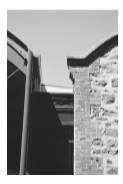
Steel and glass complement but do not imitate the stonework. The new is separated from the old by a recessed link. Frome Street Stables, Adelaide

New walls can be designed to blend with or complement the existing walls. In many instances it is better not to copy the original wall materials and details, as this detracts from the identity of the original.