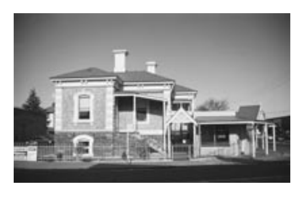
Commercial additions in a pseudo-heritage style have destroyed the curtilage of this old house in Kent Town.

It is important to define a curtilage zone around existing buildings to protect their setting and ensure that new structures or car parking do not dominate. Consider views into and out of the existing buildings when defining the curtilage. Environmental factors such as over-shadowing and wind channelling are also important considerations.