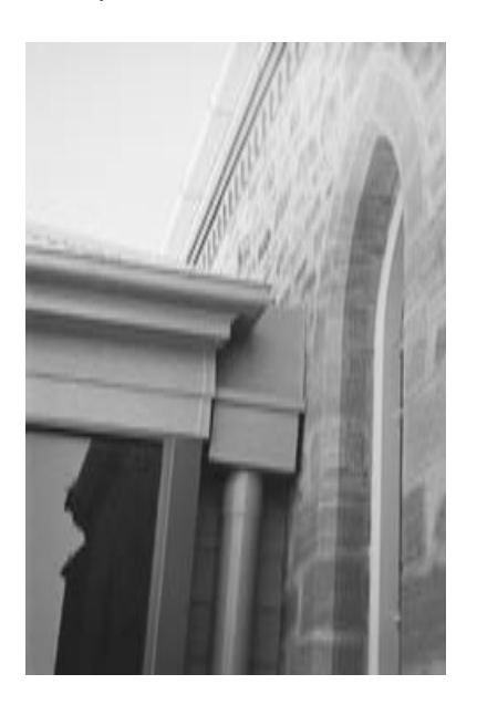
This new wall has been kept clear of the existing window opening. The new roof is separated and the junction is set back behind the downpipe and rainwater head. St Matthew's Church, Hahndorf.

Lightweight wall materials such as painted weatherboard, corrugated iron or texture-coated cement sheet are more suitable for use than lightweight brick facings, cement sheet planks or PVC weatherboards.