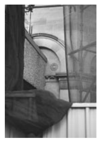
This 1967 addition to the State Library showed little regard for its heritage value. Changed community attitudes would prevent such mistakes today.

Changes of use, land division and any demolition will also require local council approval. Alterations and additions to local heritage places may also require development approval.