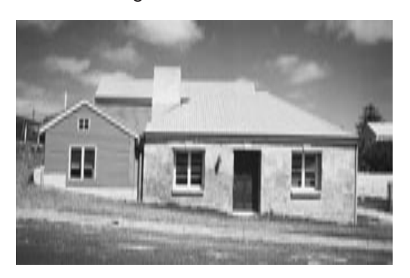
Additions to the Criterion Cottage in Robe have been articulated into small forms that retain the dominance of the original. New materials and windows complement but do not mimic the original.

The rear of many Victorian and Edwardian buildings often consisted of lean-to structures to accommodate porches, service rooms or kitchens. These structures have often themselves been altered or extended and they contribute to the character and history of the building.