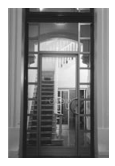
A contemporary aluminium door provides a secure airlock to this stairway. It does not intrude because it does not compete with the original Victorian detailing. Oxford Hotel, North Adelaide.

If doors or windows are no longer required they can be simply closed and locked. If a more permanent modification is required, plasterboard may be fixed to cover the opening wherever possible, leaving the original elements in place. Any original fabric that is removed should be labelled and kept in safe storage on the site to allow for future reinstatement.