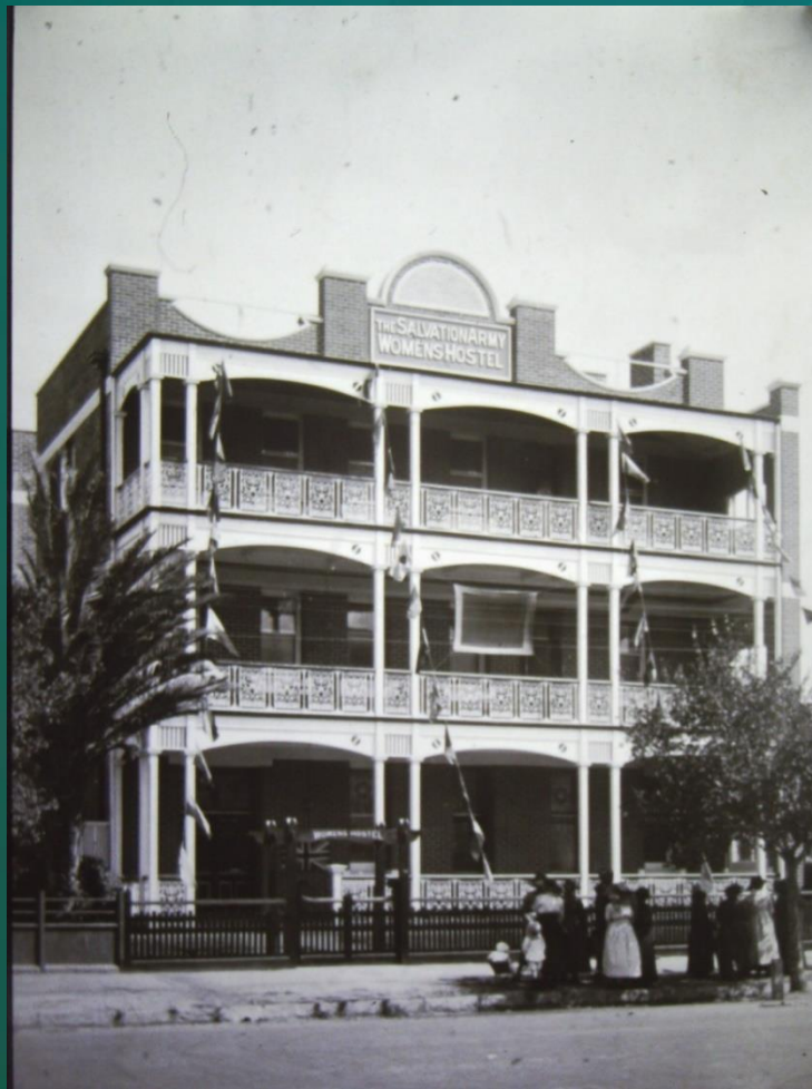
Image: Salvation Army Women's Hostel, 341 – 345 Angas Street, Adelaide.

Heritage News contains updates from the South Australian Heritage Council meeting held on 27 February 2025 and other topical news relating to conserving and promoting South Australia's unique heritage.