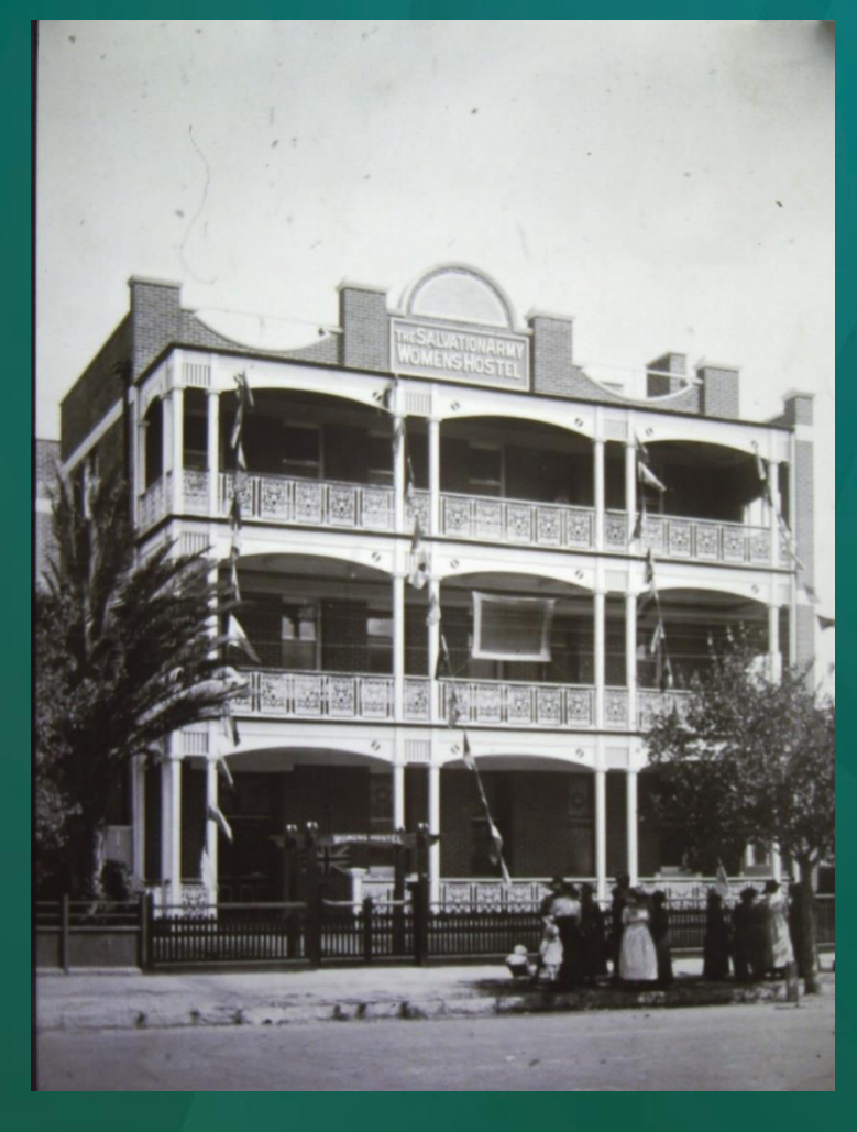
Image: Salvation Army Women's Hostel, 341 – 345 Angas Street, Adelaide.

Heritage News contains updates from the South Australian Heritage Council meeting held on 27 February 2025 and other topical news relating to conserving and promoting South Australia's unique heritage.