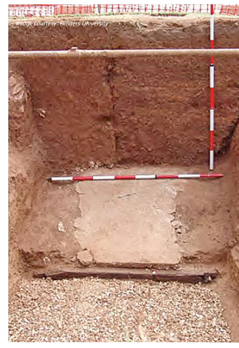
Buried path leading down to the entrance of a former air raid shelter at the Daw Park Repatriation General Hospital (SHP 26305), excavated in 2007

it is an archaeological artefact, or any other form of artefact, that satisfies one or more of the significance criteria defined in the Act (the same as for a State Heritage Place – see below)