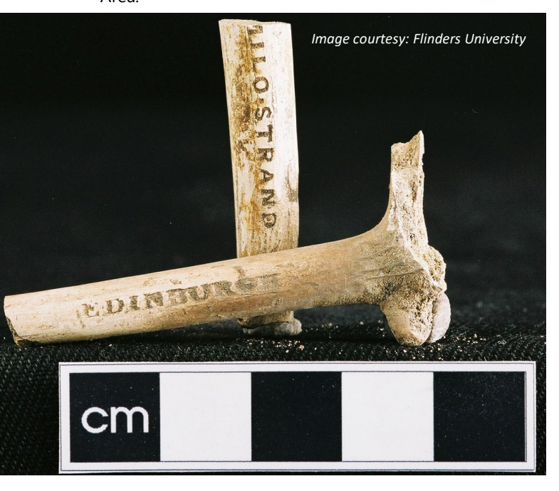
Engraved clay pipe stems excavated from a small dwelling in the Port Adelaide State Heritage Area (SHP 13252) in 2003