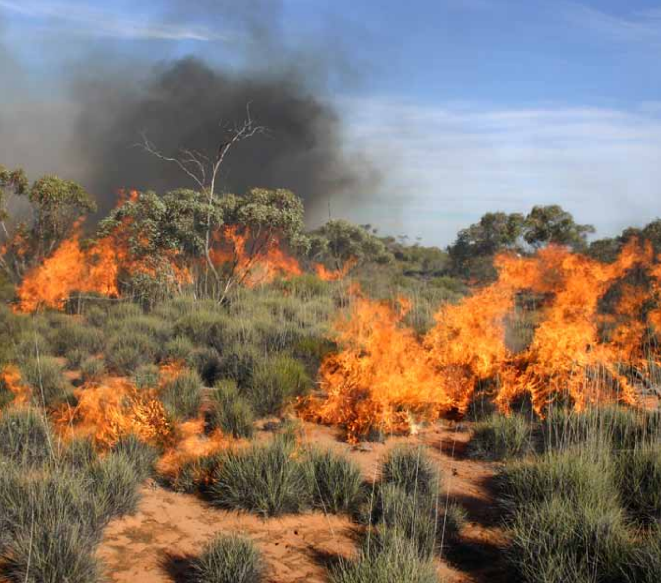
Figure 3. Prescribed burning in a Spinifex grassland.