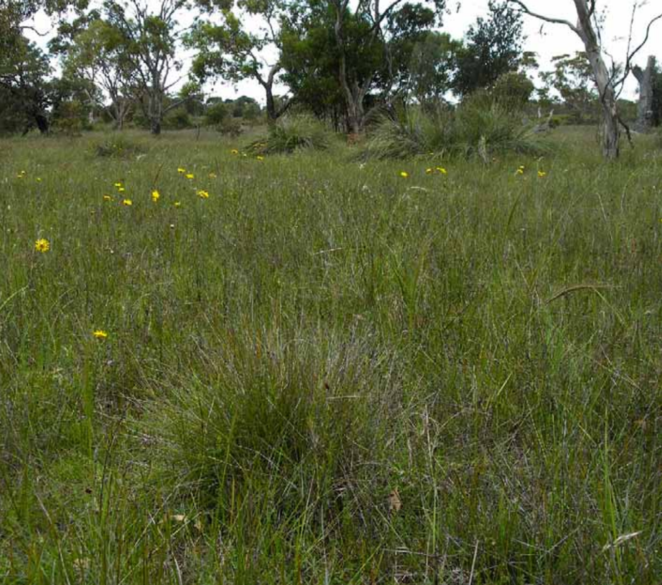
Figure 5. Grassy eucalypt woodland.