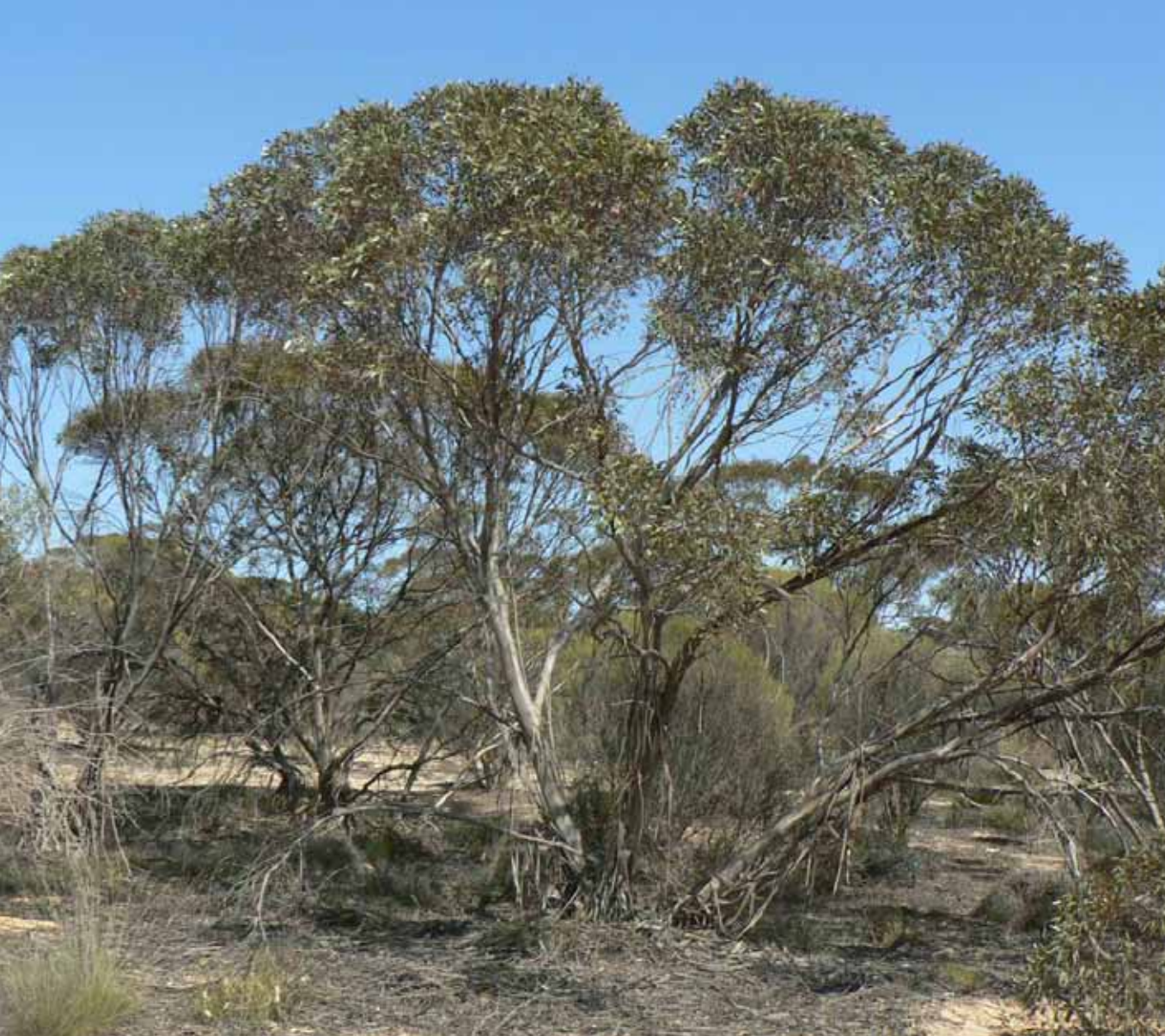
Figure 2. Semi-arid mallee.