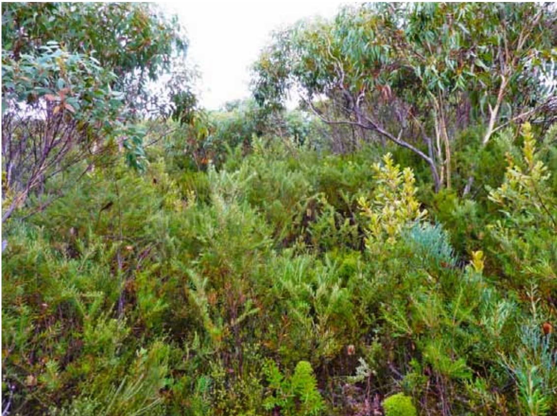
Figure 6. Coastal mallee heathland.

The prescriptions for conducting coastal wet and damp mallee woodland prescribed burning are in Table 9.