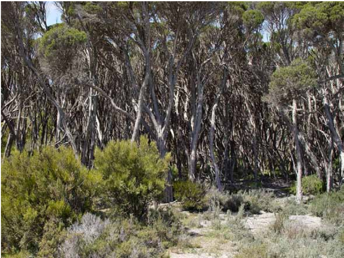
Figure 7. Tea-tree non-eucalypt woodland and heathland.

The prescriptions for conducting non-eucalypt woodland and heathland prescribed burning are in Table 9.