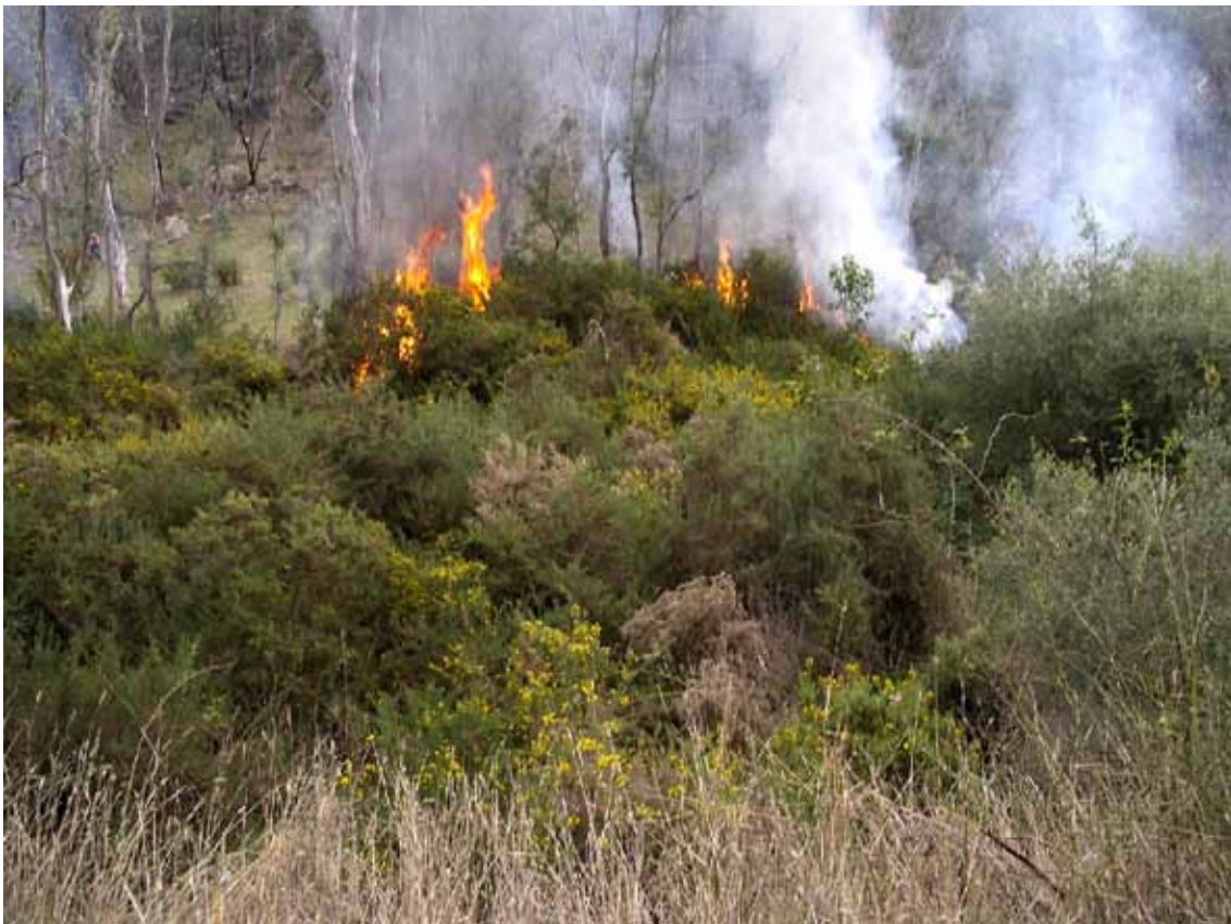
Figure 8. Gorse prescribed burning.

The prescriptions for conducting woody weed management prescribed burning are in Table 9.