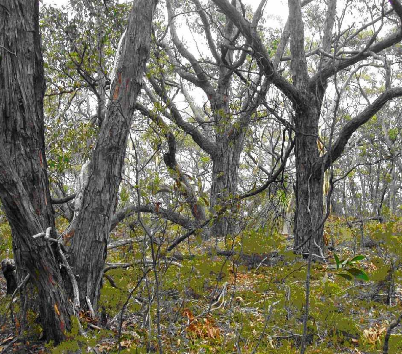
Figure 4. Eucalypt heathy open forest.