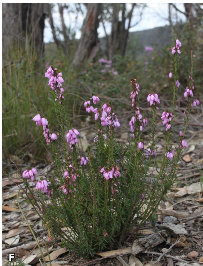
Pl. 1. A, Tetraloche ciliata. B, T. halmaturina, on ironstone substrate. C, T. insularis. D–F, T. pilosa : D, older flowers viewed from below; E, younger flowers; F, plant in stringybark forest, Adelaide Hills.