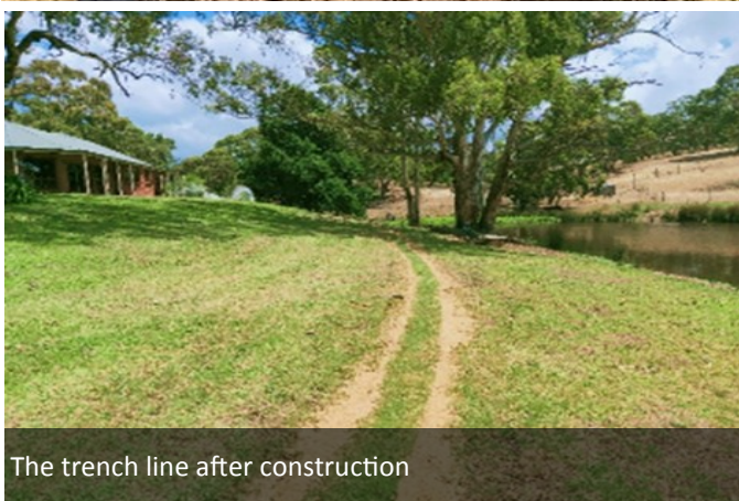
The trench line after construction