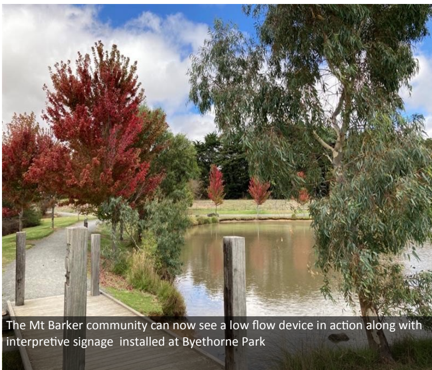
The Mt Barker community can now see a low flow device in action along with interpretive signage installed at Byethorne Park

A new interpretive sign installed next to the device explains how the device operates and benefits the local environment. The device returns critical flows to the environment and benefits the local site. A community member who resides downstream of this site commented "Since the device went in the flow has been more even and less flash-floody".