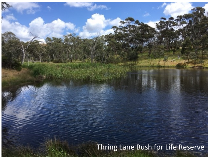
Thring Lane Bush for Life Reserve

work with the sites' interested parties. The devices are individually tailored to each site with minimal disturbance or ongoing maintenance."