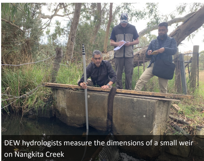
DEW hydrologists measure the dimensions of a small weir on Nangkita Creek