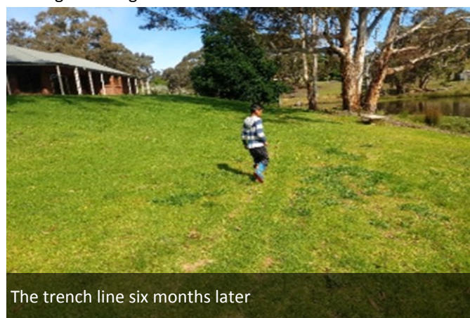
The trench line six months later

By installing a low flow device, Pauline and Sjors help support the regeneration of native aquatic plants and animals and maintain their water security. The Verwaal grandkids and future generations will benefit from a healthy system. Pauline enjoys creating fond memories with her grandkids and building a lifelong connection with nature.