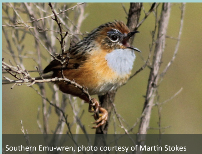
Southern Emu-wren

Read on to find out how Mt Jagged Wines is working with the Goolwa to Wellington Local Action Planning Association to protect and restore critical habitat for this endangered bird.