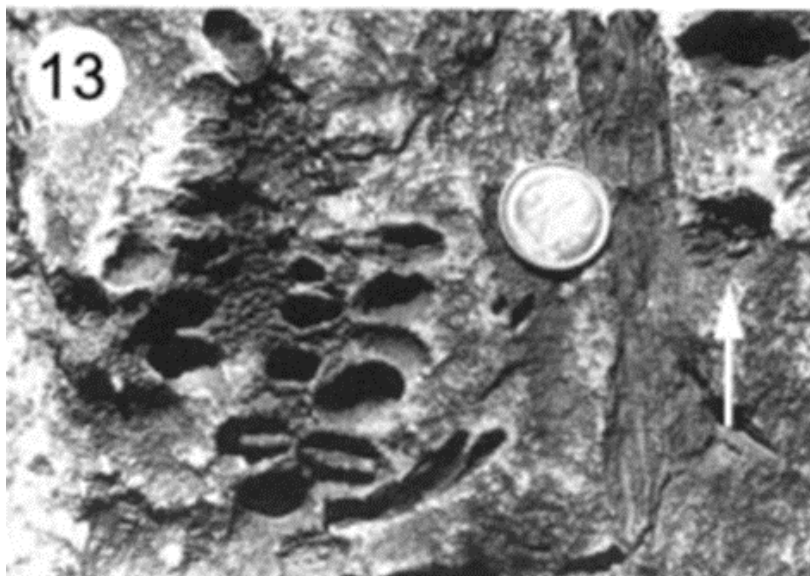
A Banksia-like cone from Poole Creek (Greenwood 2001)