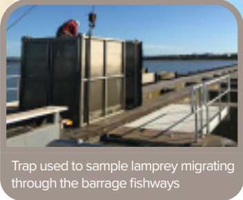
Trap used to sample lamprey migrating through the barrage fishways