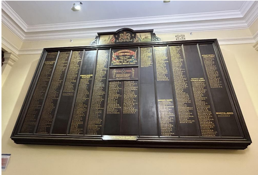
The Commissioner of Public Works Honour Board.

202-220 Tarntanyanga / Victoria Square, Adelaide SA 5000