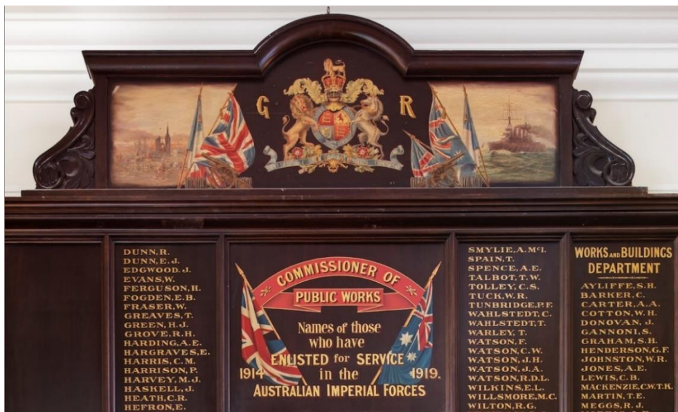
Crowning panel featuring the British coat of arms flanked by the flags of Britain, France, Australia, and New Zealand, and two scenes painted in oil.