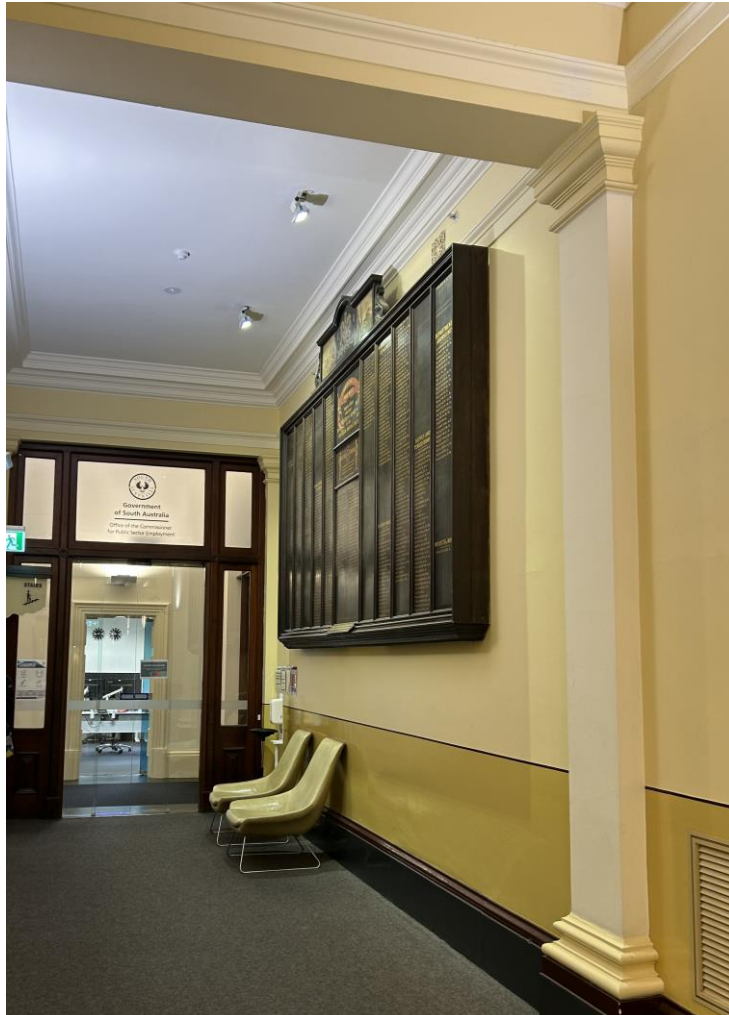
The Honour Board in situ in the western ground floor corridor of the Torrens Building.