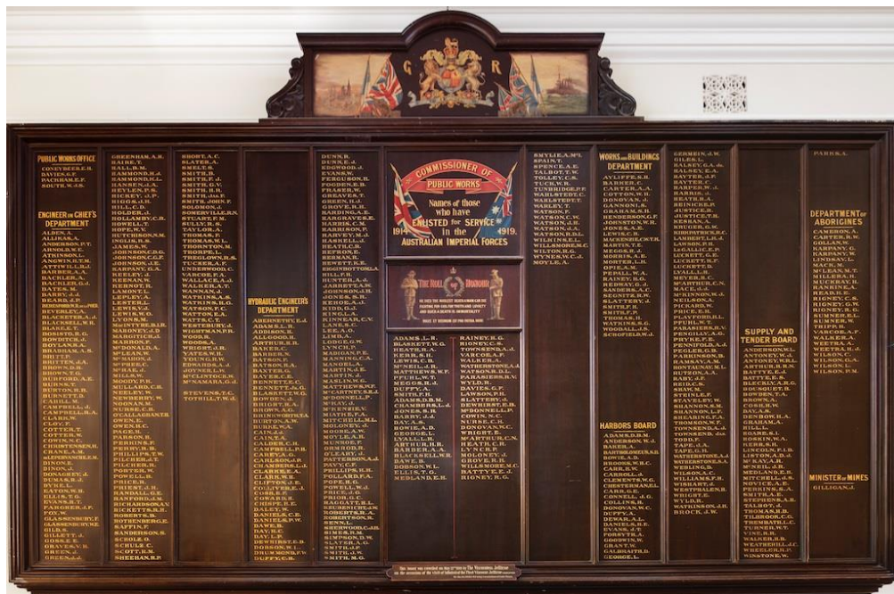
Commissioner of Public Works Honour Board, Torrens Building, Tarntanyangga / Victoria Square

ADDRESS: Karna Country 202-220 Tarntanyangga / Victoria Square Adelaide SA 5000 Hundred of Adelaide CT 5896/686 D27841 A5