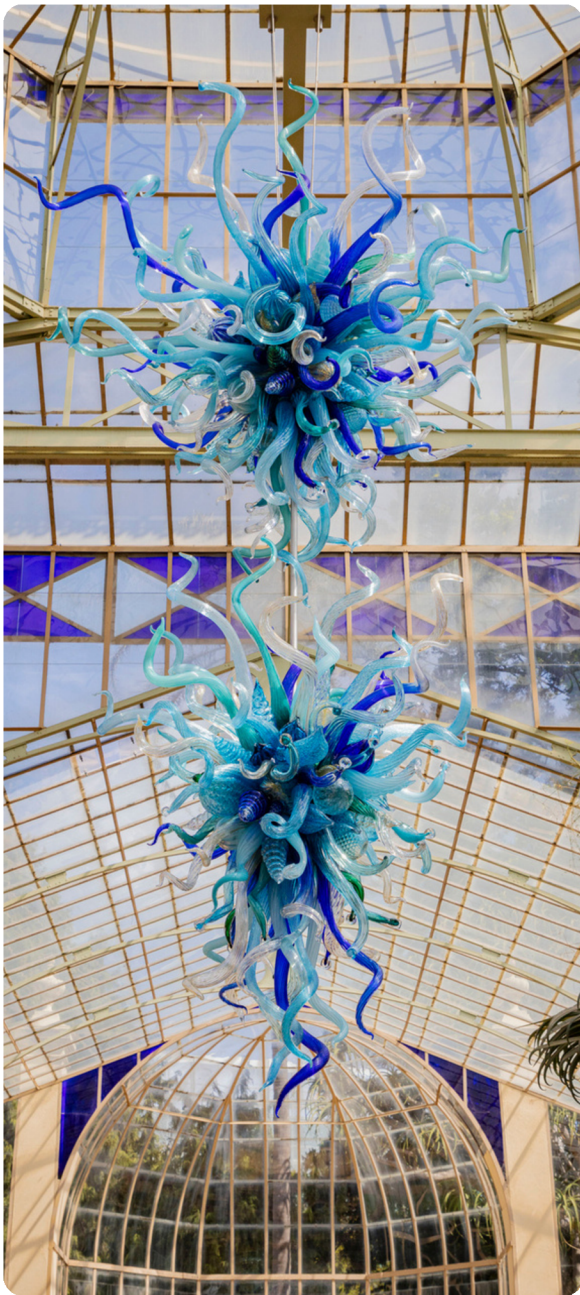
Glacier Ice and Lapis Chandelier, Dale Chihuly, 2024

Watching Glass Grow is a Challenge Course created in collaboration between Makers Empire and the Botanic Gardens and State Herbarium for Chihuly in the Botanic Garden , an exhibition featuring glass art by Dale Chihuly held September 2024 to April 2025.